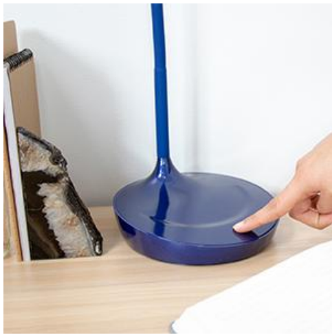
Image Description: A hand with a finger touching the circular control area on the lamp's base, demonstrating the touch-sensitive operation.