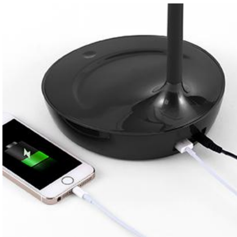
Image Description: A close-up of the lamp's base with a smartphone connected to the built-in USB port, indicating active charging.