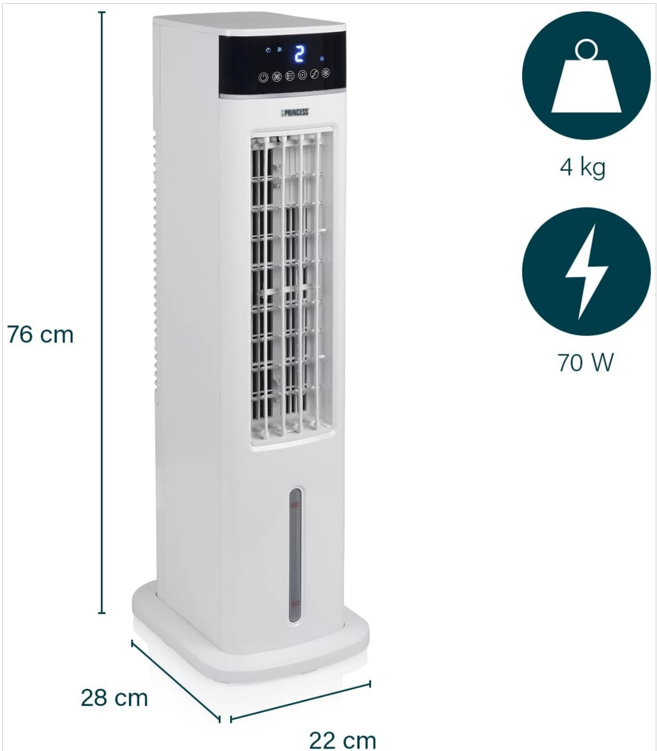
Figure 12: Dimensions and key specifications of the air cooler.