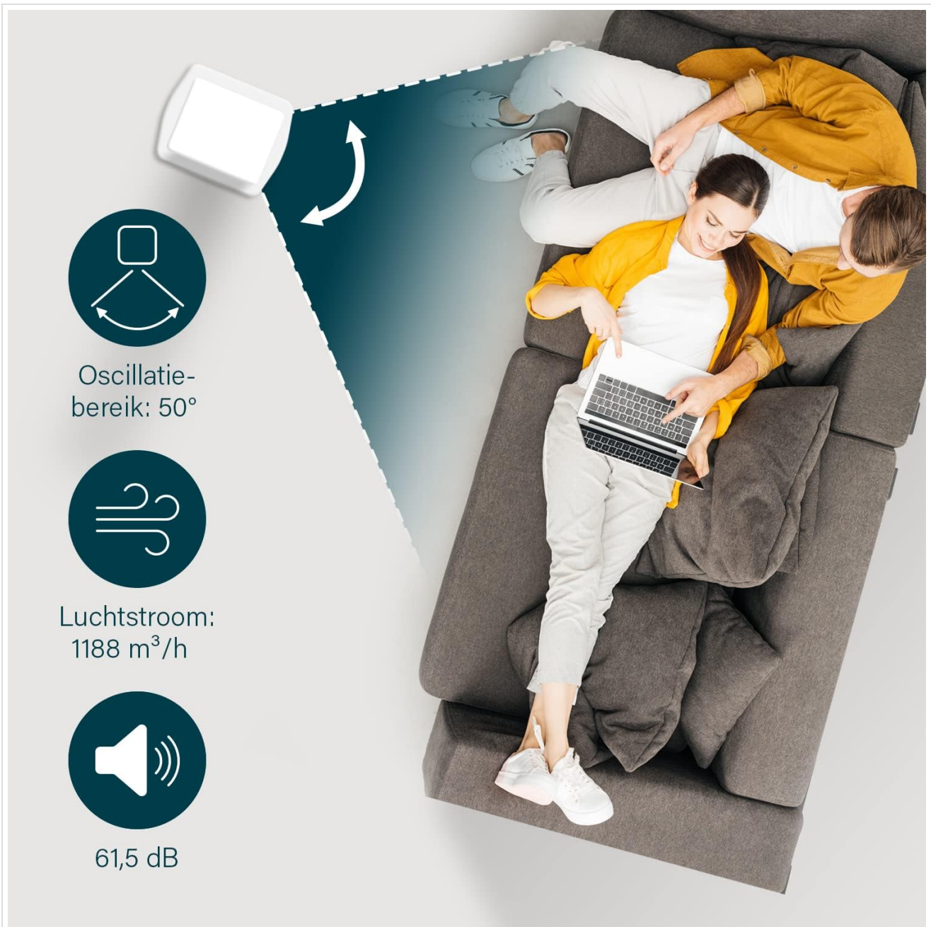
Figure 8: The oscillation function distributes cool air across a 50° range.