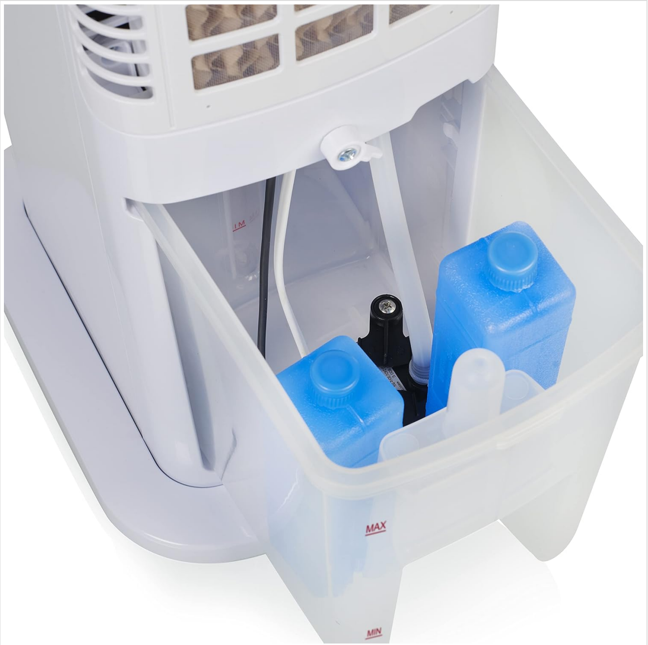
Figure 5: Water tank with ice packs, indicating fill levels.