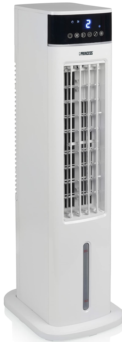
Figure 1: Princess 357250 Smart Air Cooler Fan in operation, illustrating air circulation.

The Princess 357250 is a versatile 3-in-1 appliance functioning as a fan, air cooler, and air freshener. It features a 3.5-liter water reservoir, three operating modes, and can be controlled via the HomeWizard Climate app, voice commands, or the included remote control.