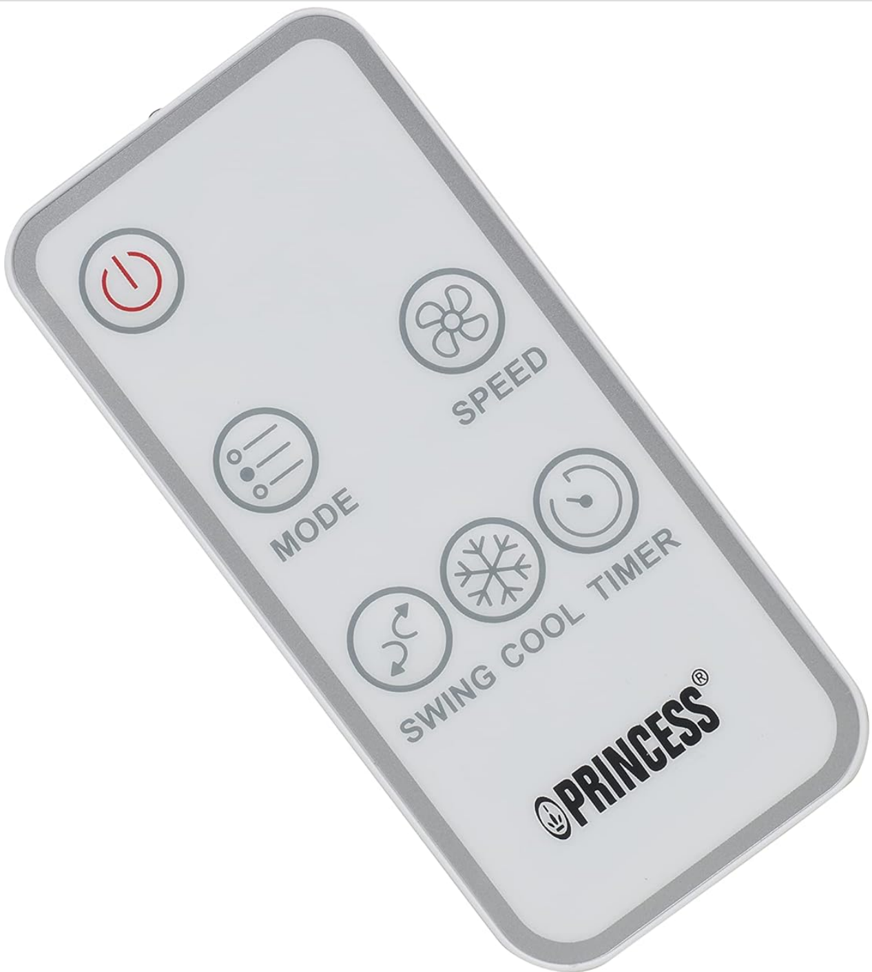
Figure 2: Included remote control for convenient operation.