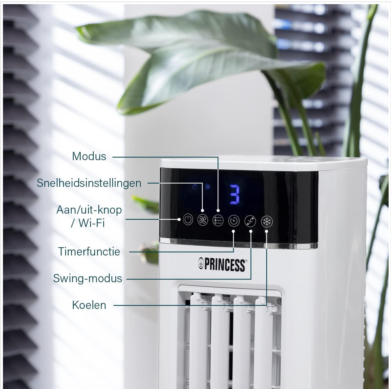
Figure 6: Control panel with various function buttons.