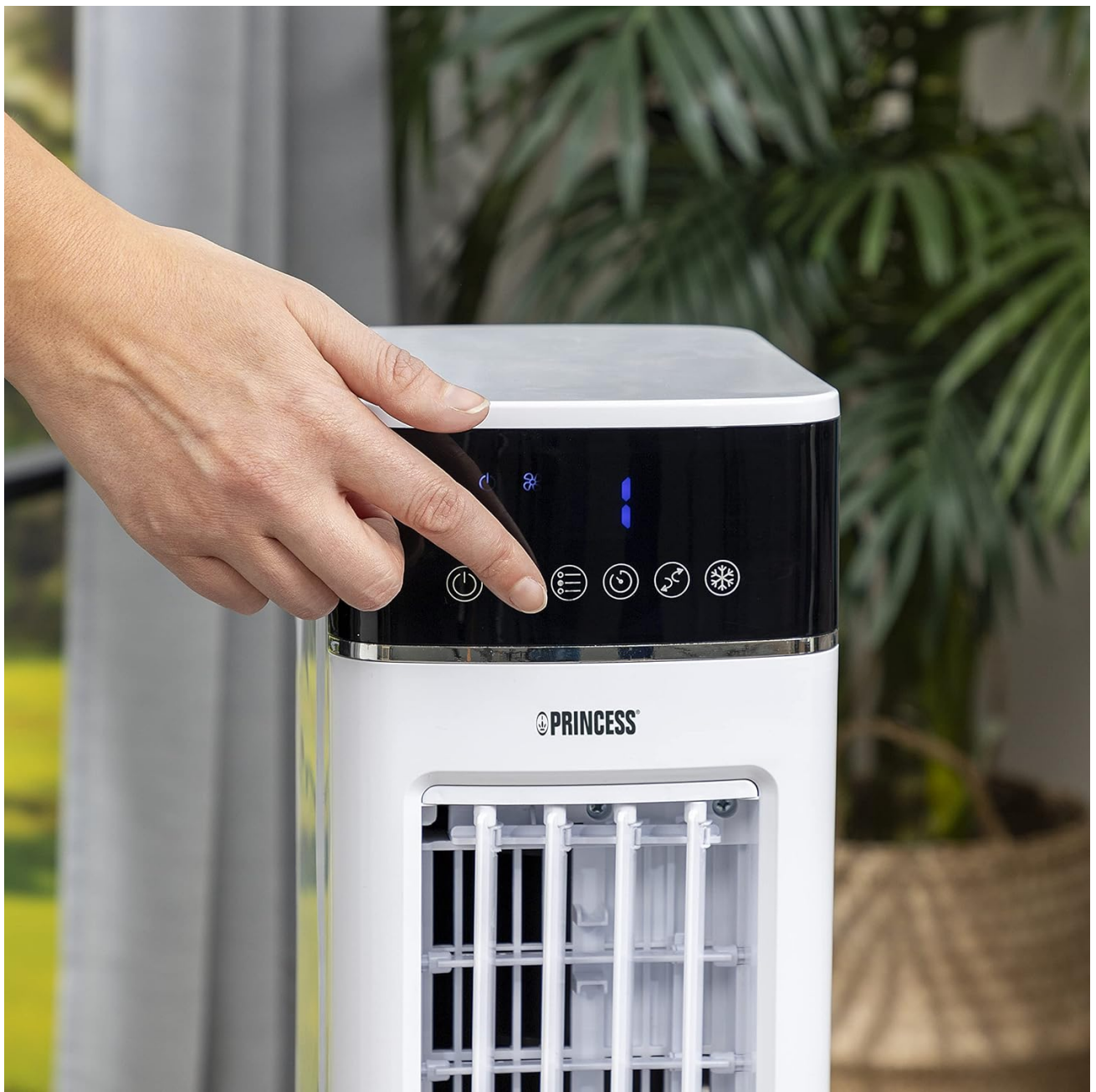
Figure 7: Manual control via the top panel buttons.