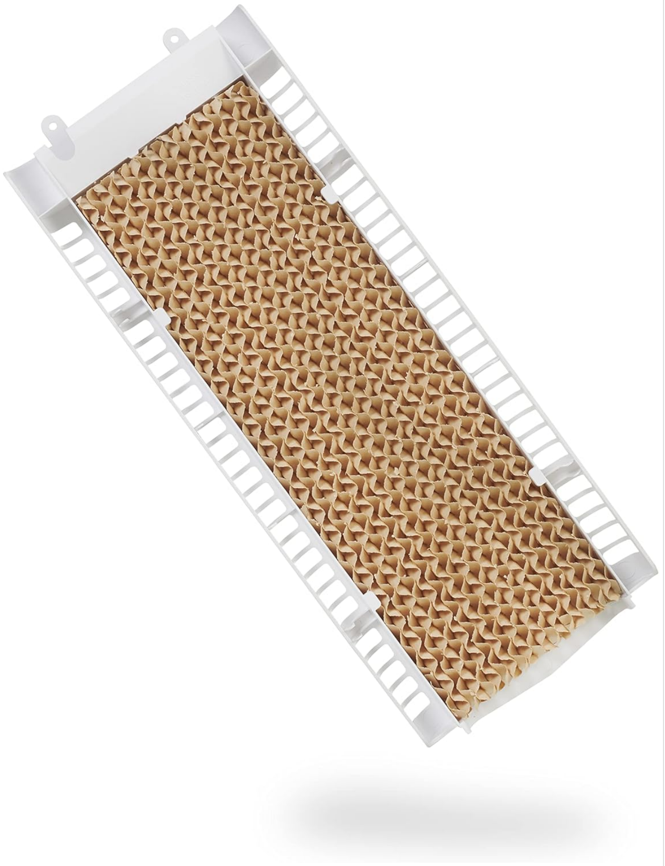
Figure 11: The cooling pad, which should be cleaned periodically.