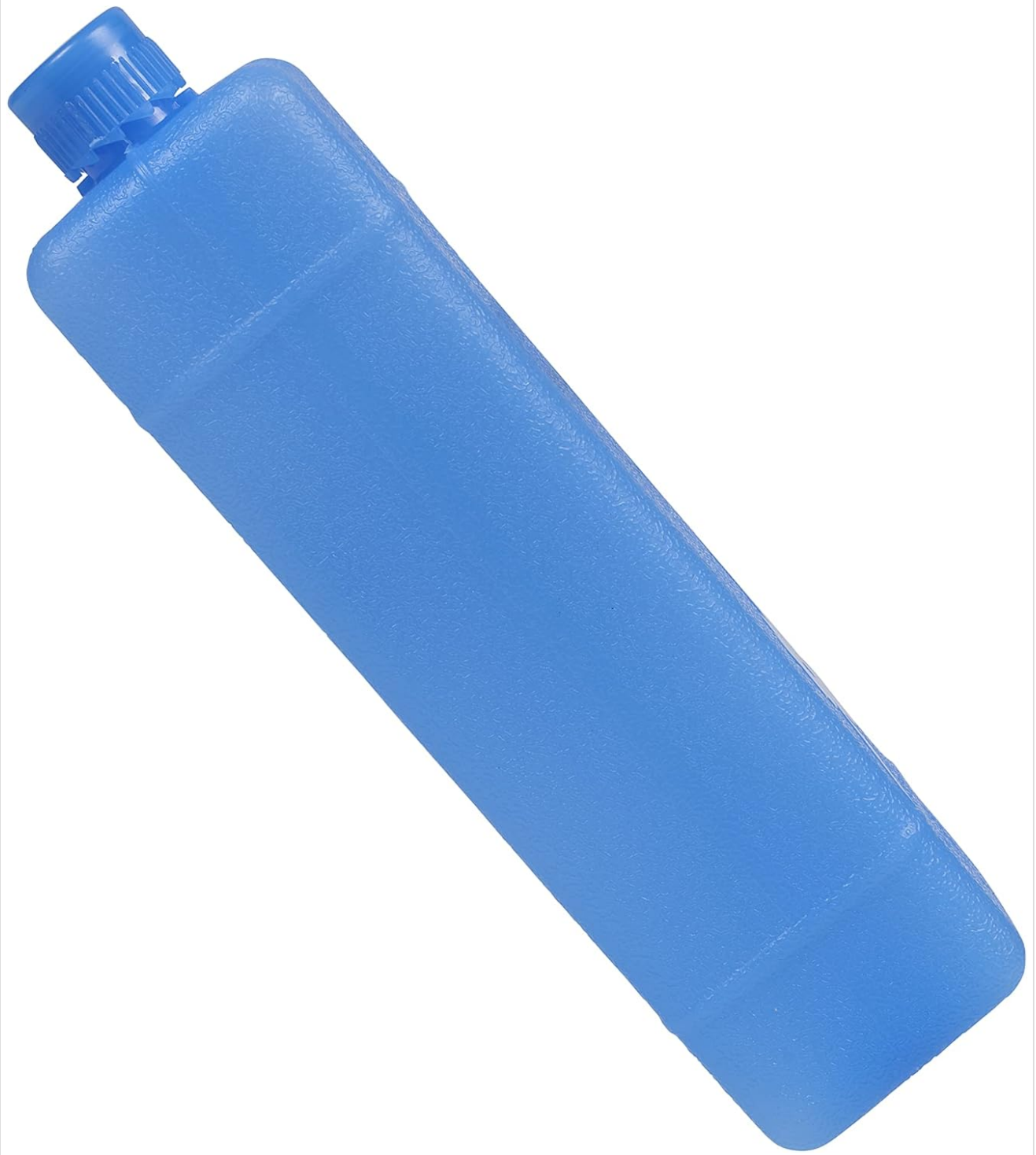
Figure 3: Example of an ice pack used to enhance cooling performance.