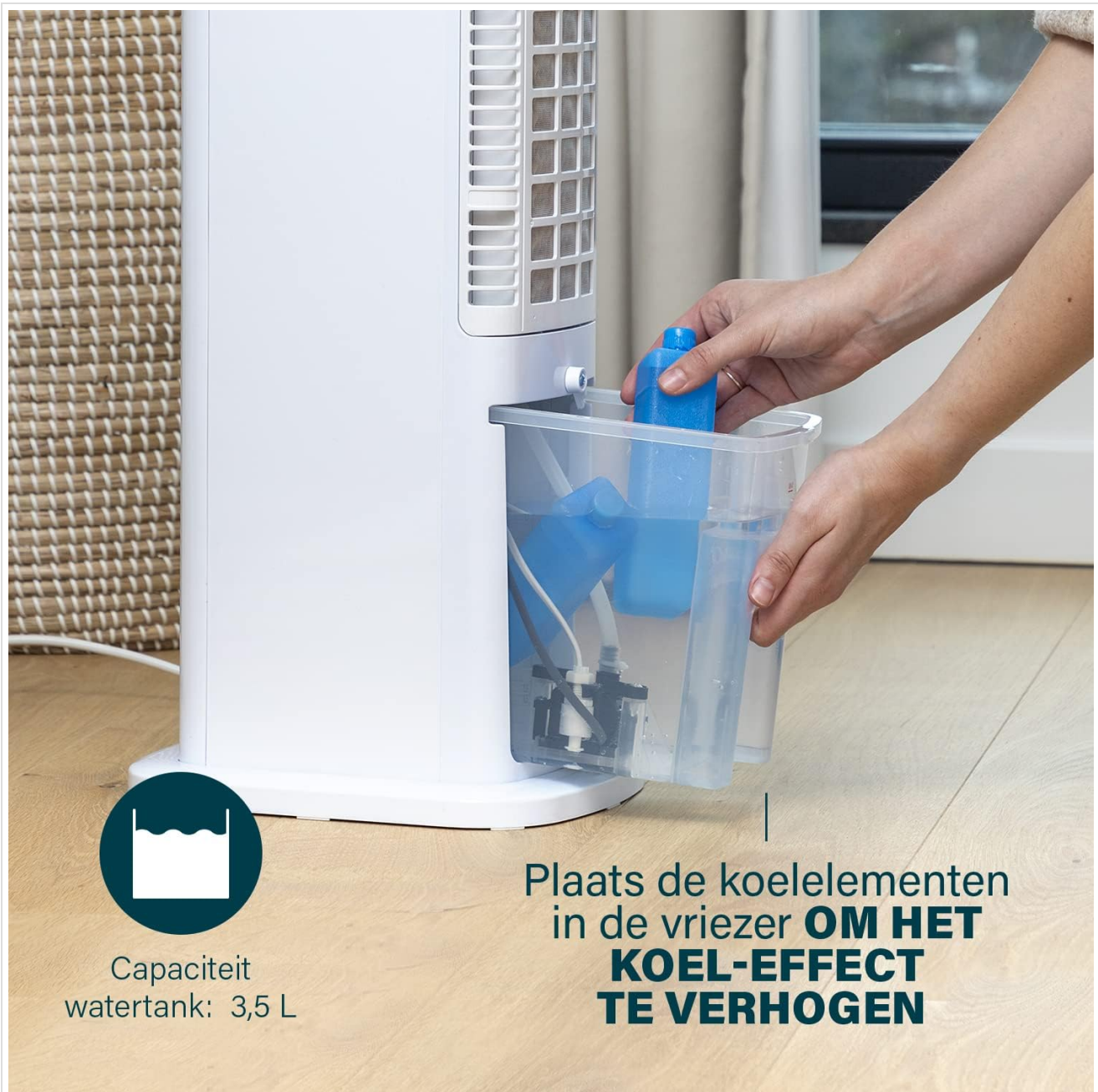
Figure 4: Adding ice packs to the water reservoir to increase cooling effect.