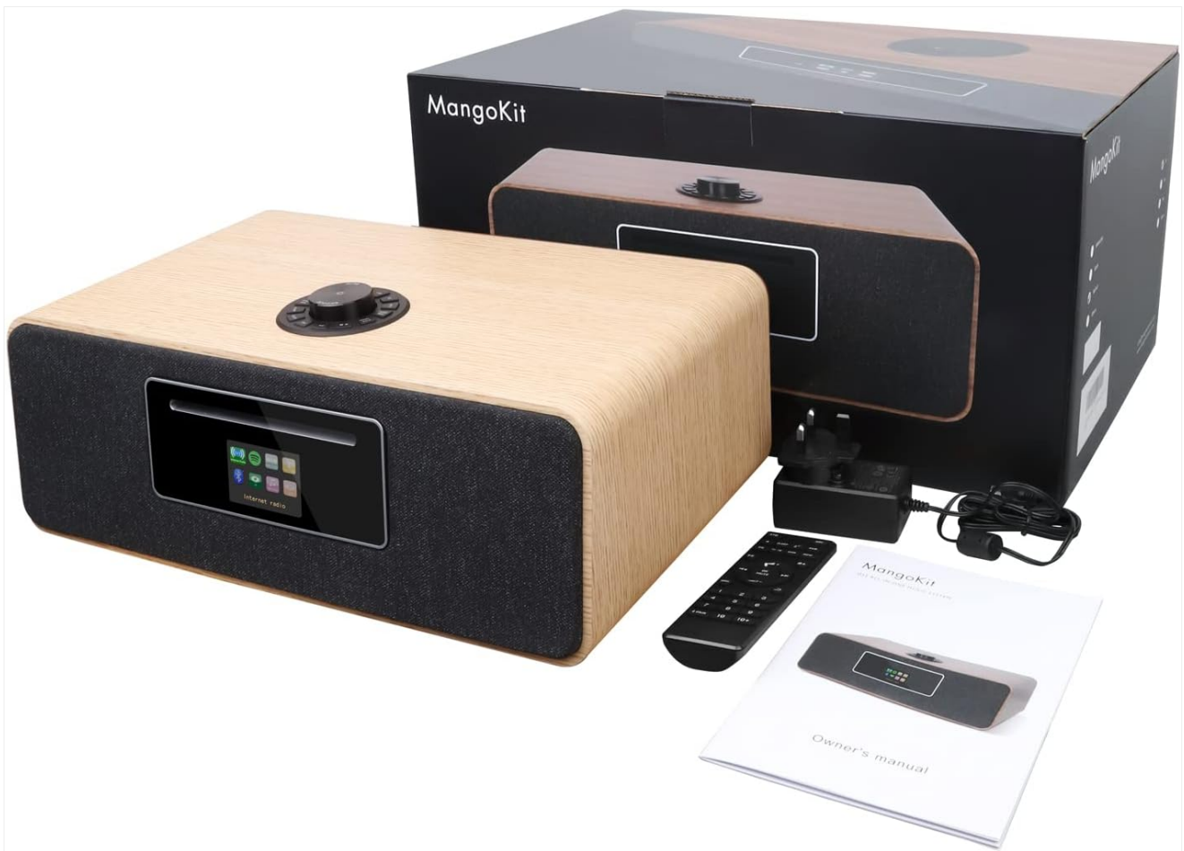
Image: The MangoKit MS5 unit, remote control, power adapter, and user manual are shown alongside the product packaging.