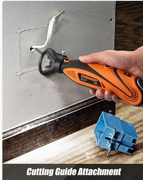
Image: Visual guide for installing accessories using the keyless chuck.