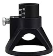
Drilling Guide X1