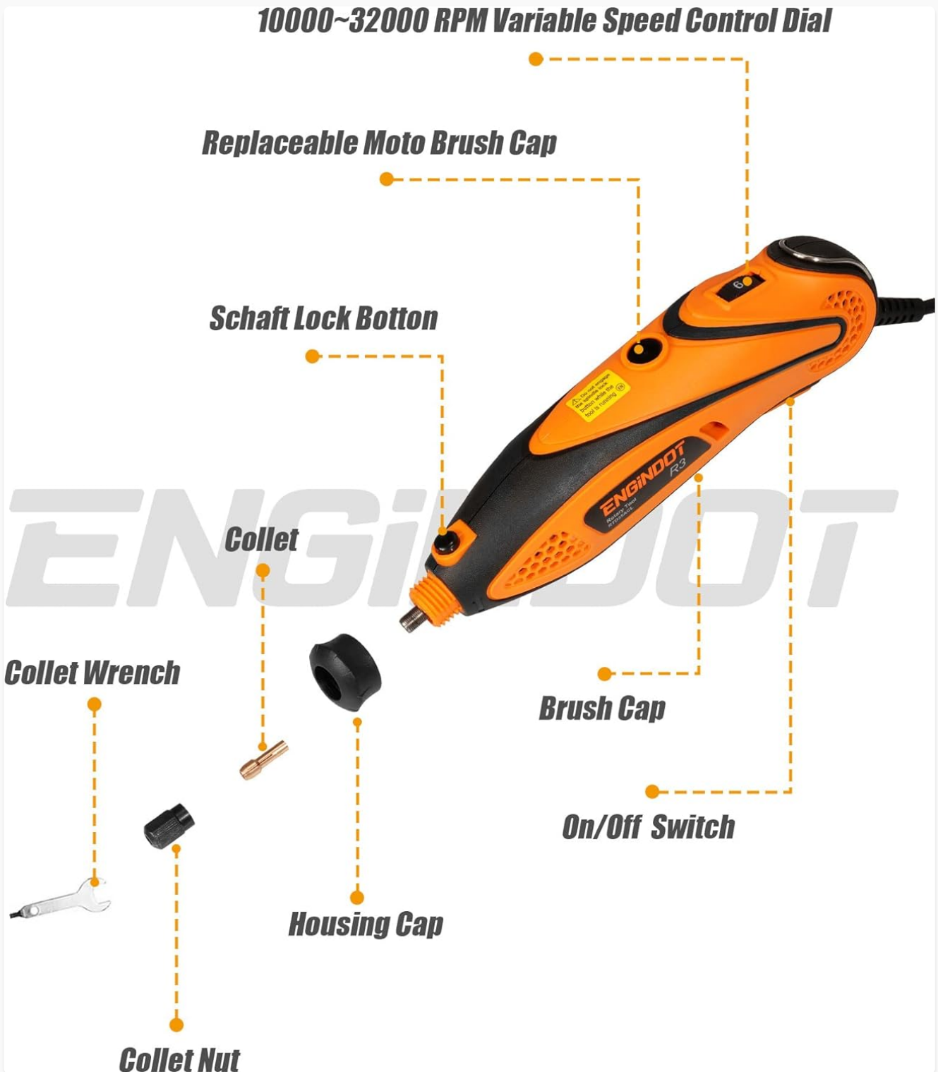
Image: Diagram illustrating the components of the rotary tool, including the brush cap.

Your browser does not support the video tag.