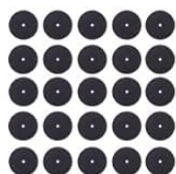
Fiberglass cutting off wheels x25