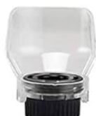
Transparent Shield x1