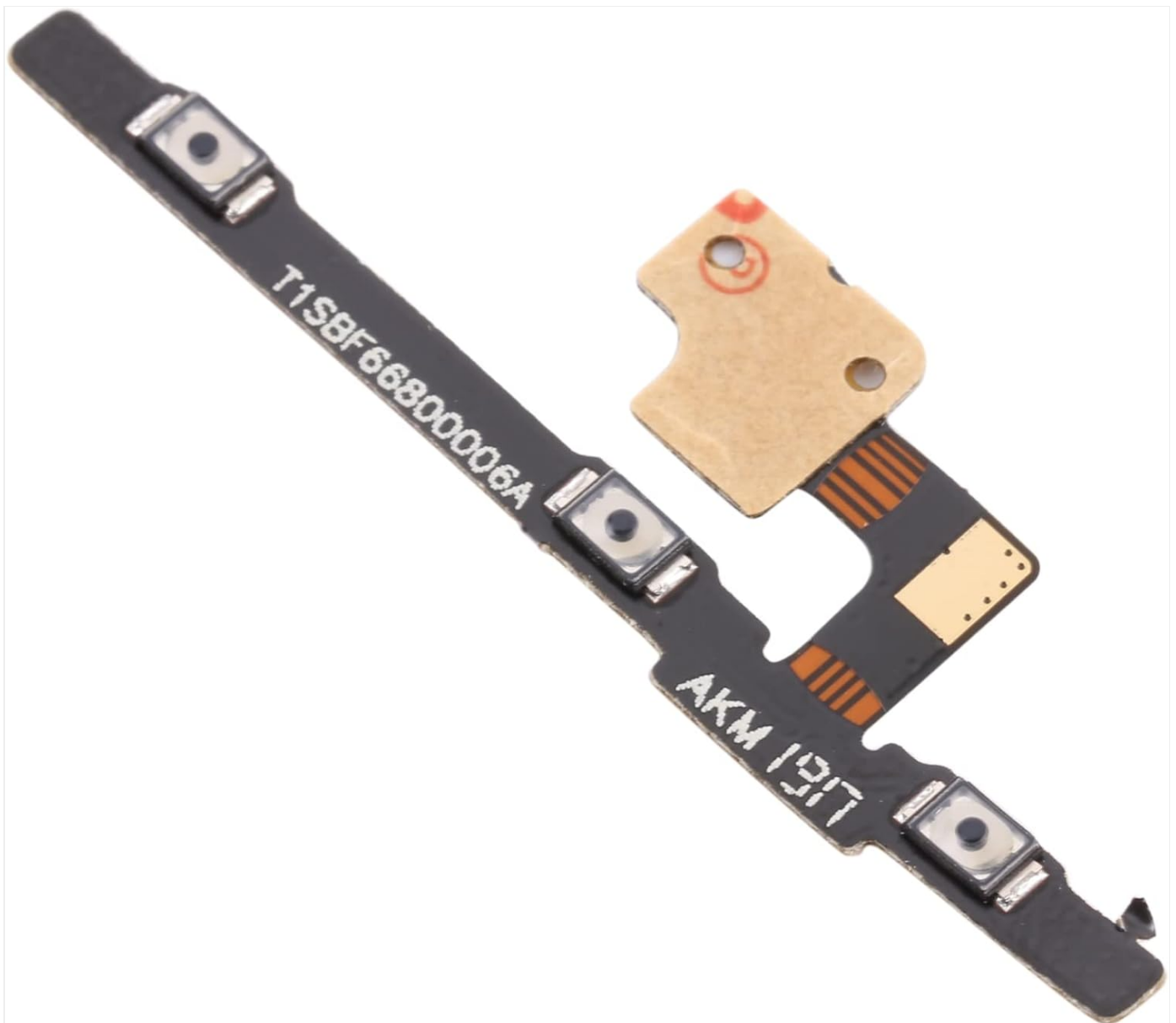
Image 2.1: Angled view of the flex cable, highlighting the button contact points and the main connector. This perspective helps in understanding how the cable would sit within the phone's frame.