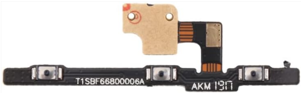
Image 1.1: Top-down view of the Power Button & Volume Button Flex Cable for TCL Plex. This image shows the overall shape and connection points of the flex cable, including the small circuit board for the power button and the longer strip for the volume buttons.

The flex cable is a critical internal component that connects the physical power and volume buttons to the phone's main logic board, enabling the device to register button presses for various functions such as turning the screen on/off, adjusting volume, and powering the device.