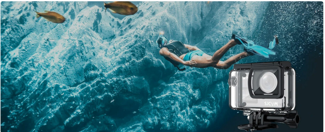
Figure 4.3: Underwater Use

When enclosed in its waterproof housing, the SJ8 Dual Screen camera is suitable for underwater activities, protecting it from water and dust.