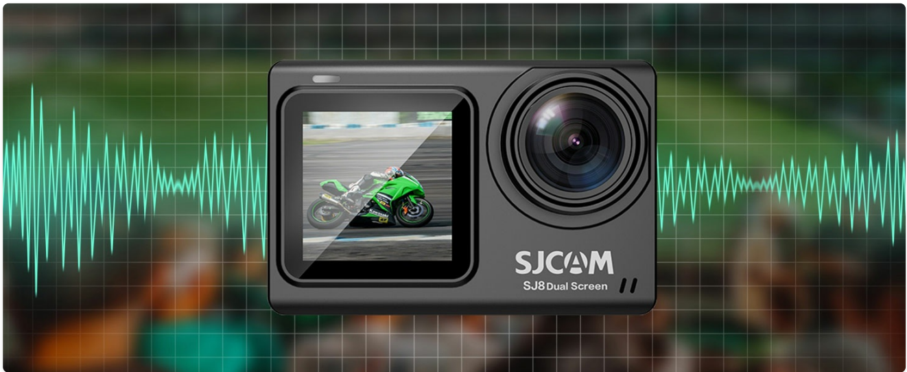
Figure 4.4: Audio Recording Capability

This image features the SJCAM camera with an audio waveform overlay, visually representing its high-quality internal dual microphone system for clear sound capture.