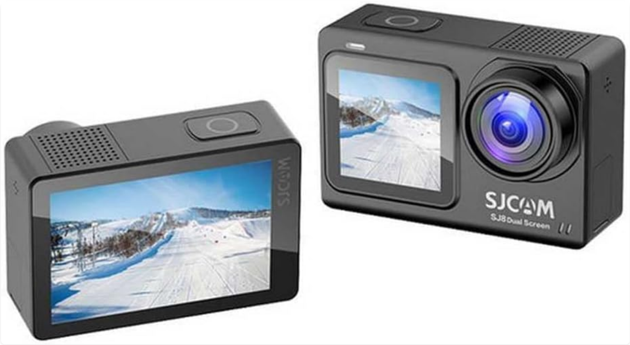
Figure 2.3: Dual Screen View

This image showcases both the front and rear screens of the SJCAM SJ8 Dual Screen camera, emphasizing its unique dual-display feature.