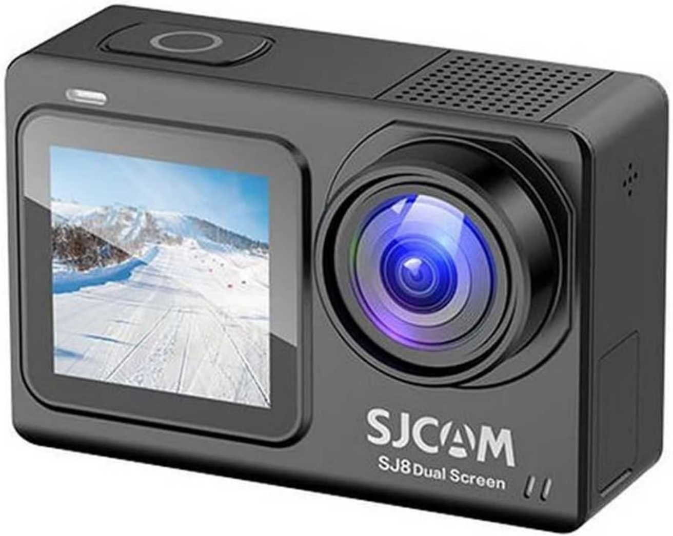
Figure 1.1: SJCAM SJ8 Dual Screen Action Camera

This image displays the SJCAM SJ8 Dual Screen Action Camera from an angled front perspective, showcasing its main lens and the front display screen.