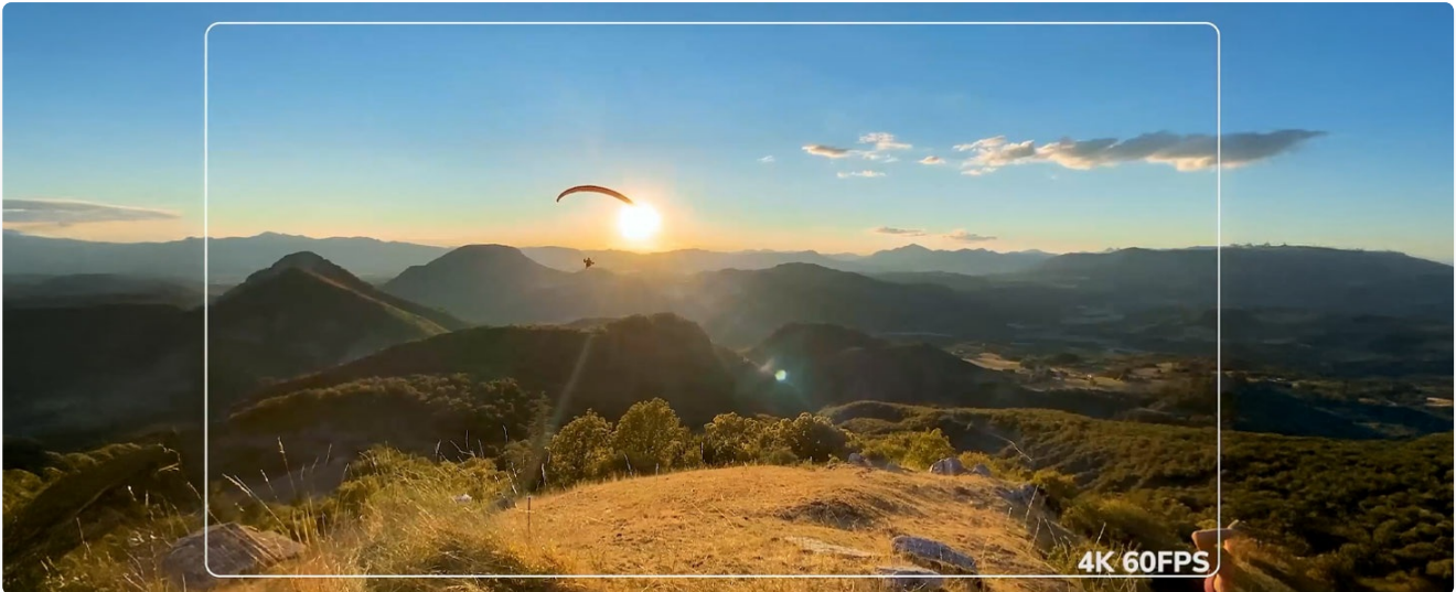
Figure 3.1: 4K 60FPS Video Capture

In Video mode, press the Shutter/OK button (on top) to start recording. Press it again to stop recording.