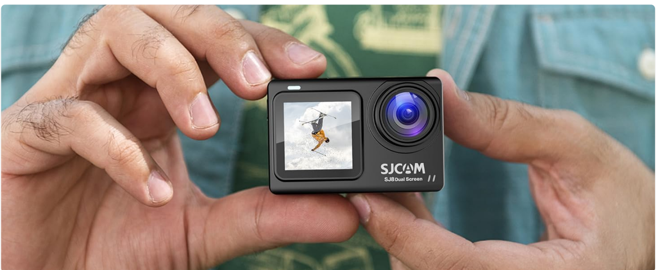
Figure 3.2: Front Screen in Use

This image shows the SJCAM SJ8 Dual Screen camera being held in hands, with the front screen displaying a live view, useful for self-recording or vlogging.