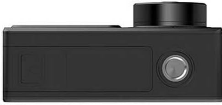
Figure 2.5: Top View

This image presents a top-down view of the SJCAM SJ8 Dual Screen camera, showing the shutter button and speaker grille.