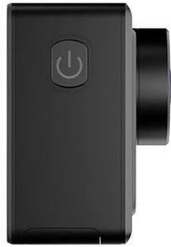
Figure 2.4: Side View

This image showcases both the front and rear screens of the SJCAM SJ8 Dual Screen camera, emphasizing its unique dual-display feature.