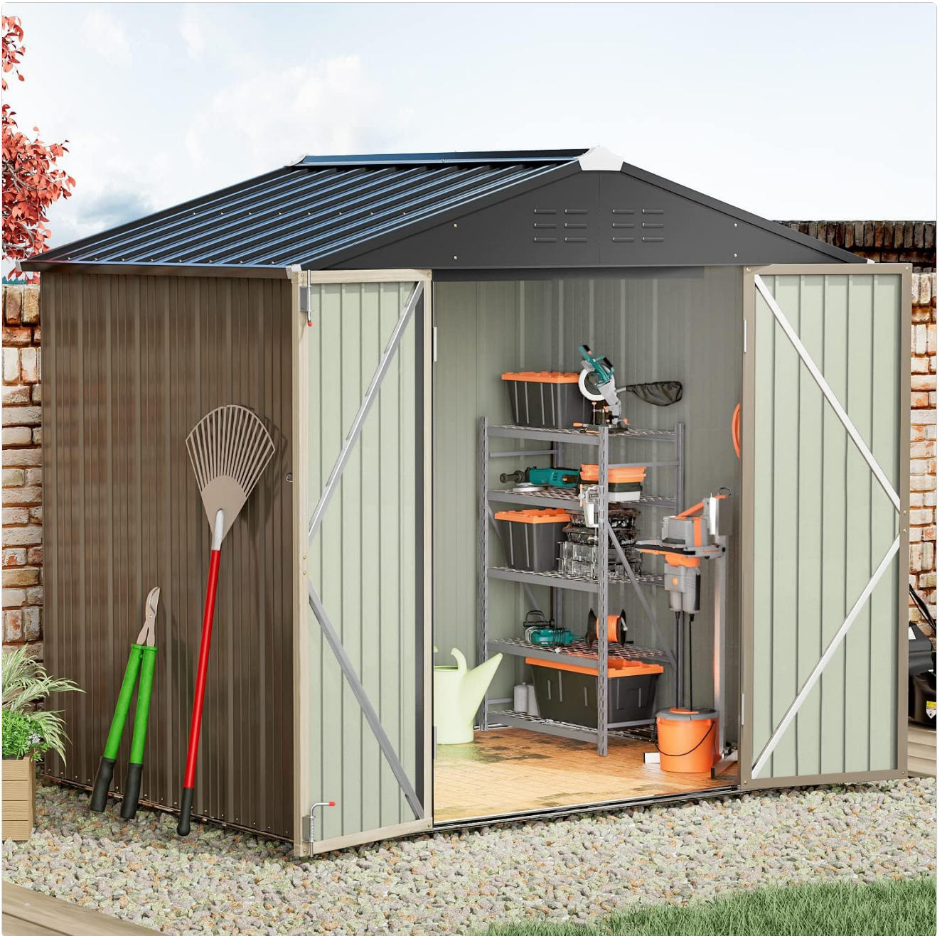
Image: The interior of the shed, demonstrating its capacity for storing garden tools and other equipment on shelves.