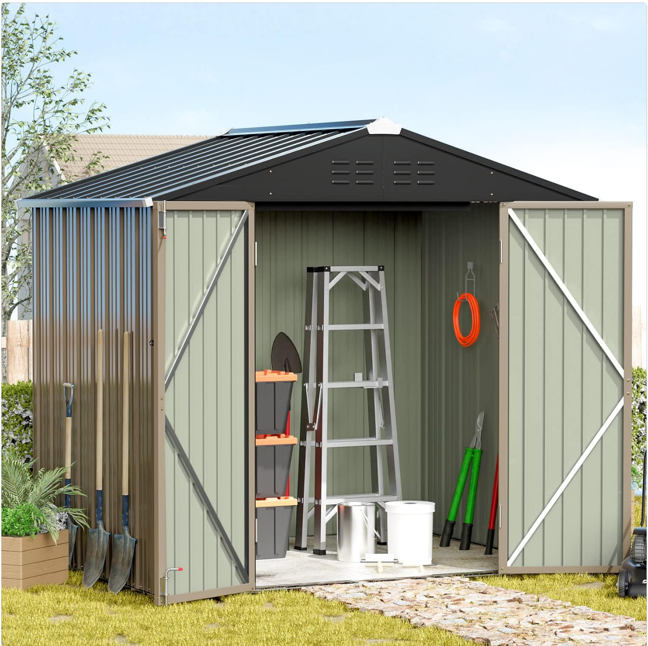
Image: Another view of the shed's interior, highlighting its utility for storing larger items like ladders and garden implements.