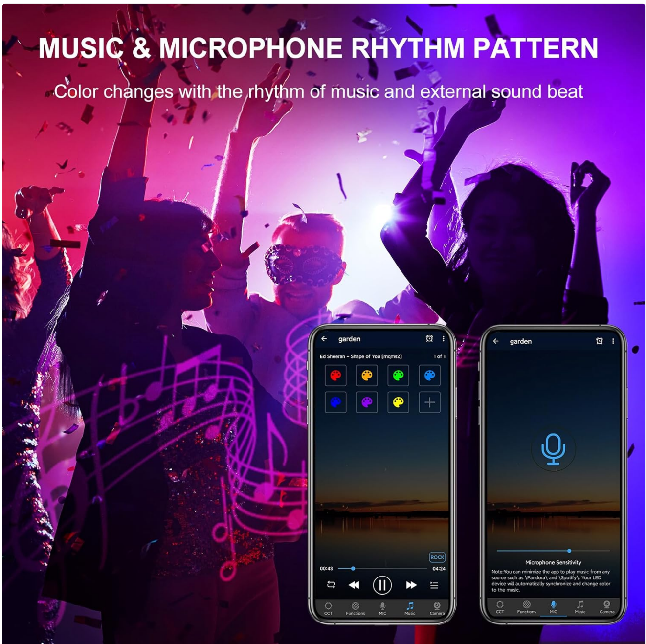
Figure 6.5: Music & Microphone Rhythm Pattern. This image depicts a party atmosphere with lights changing color, and a smartphone displaying the app's music and microphone sensitivity settings, allowing the lights to react to sound.