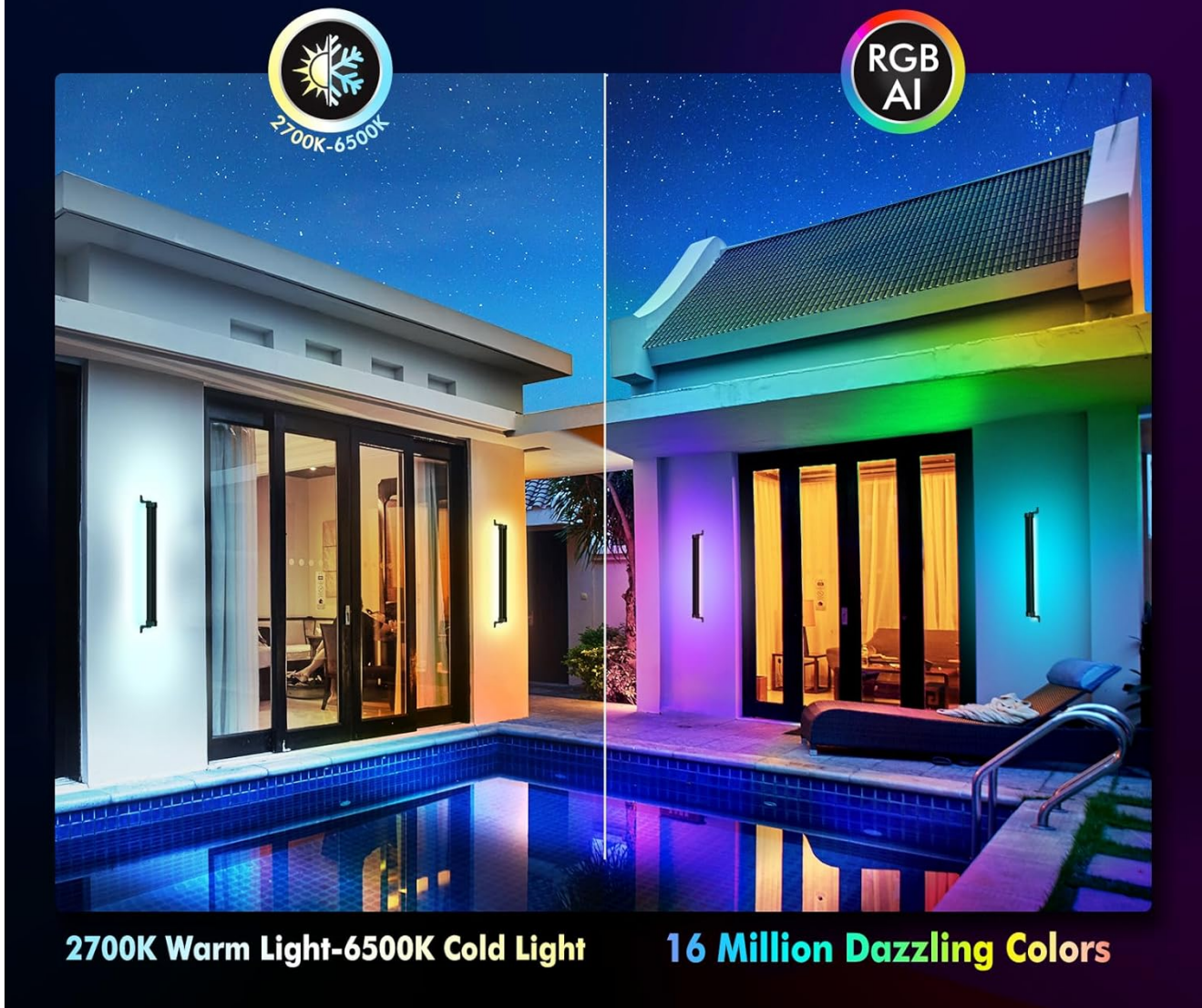
Figure 6.2: Color and Mode Variety. This image showcases the light bars illuminating an outdoor area with a pool, demonstrating the range from 2700K warm light to 6500K cold light, and the availability of 16 million dazzling colors.