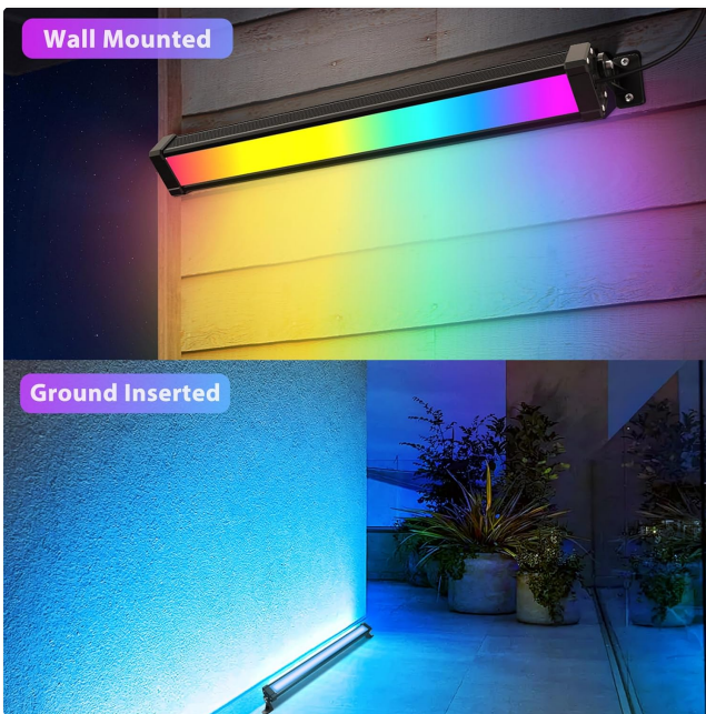
Figure 5.1: Product Dimensions and Installation

The MEIKEE RGB Wall Washer Lights can be installed as wall-mounted or ground-inserted fixtures.