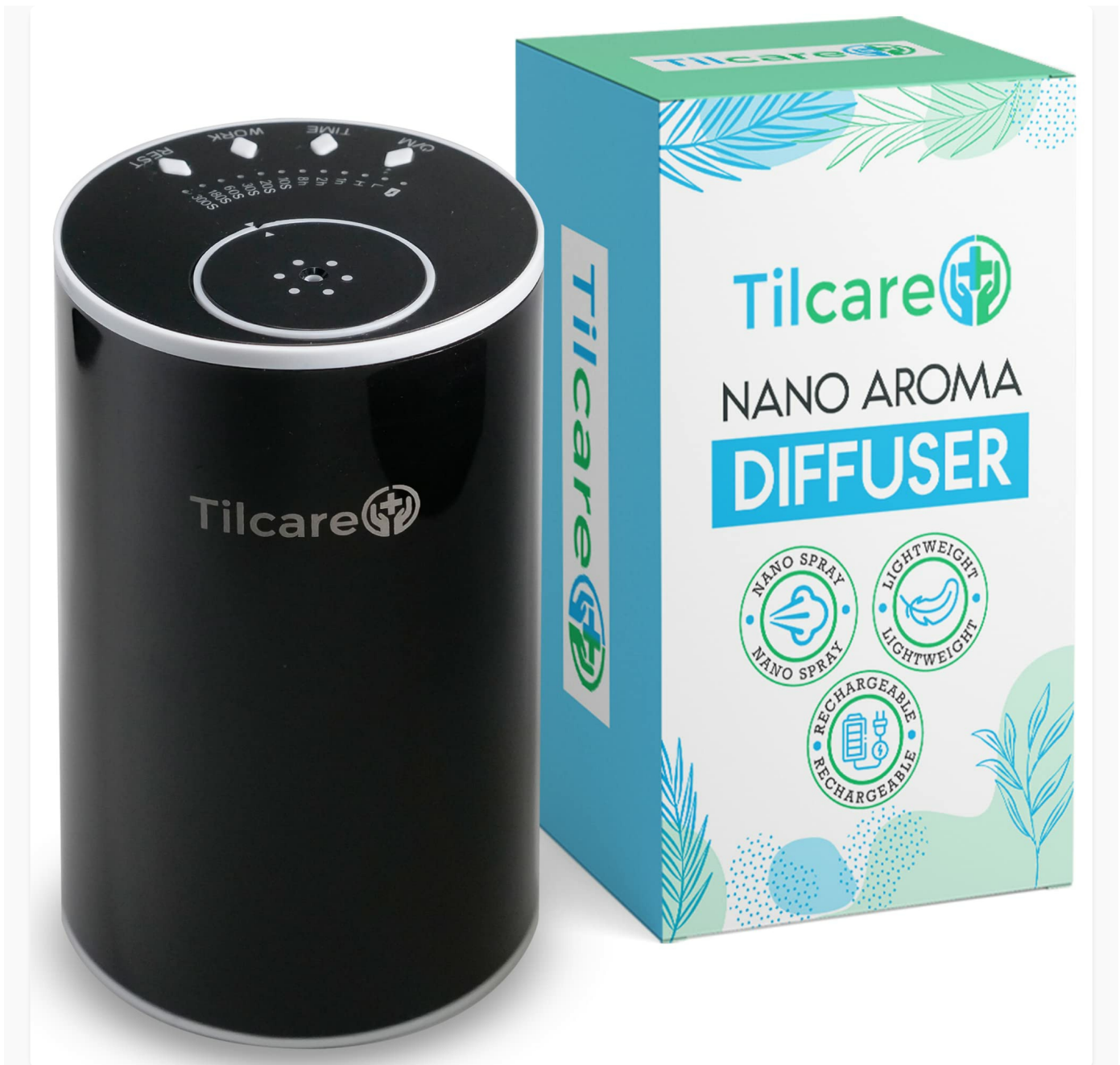
Image: The Tilcare Waterless Nano Essential Oil Diffuser placed on a coffee table in a modern living room, demonstrating its discreet presence.