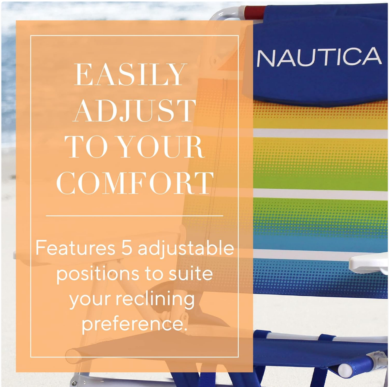
Image: A detailed view of the chair's armrest and the mechanism for adjusting the recline position.