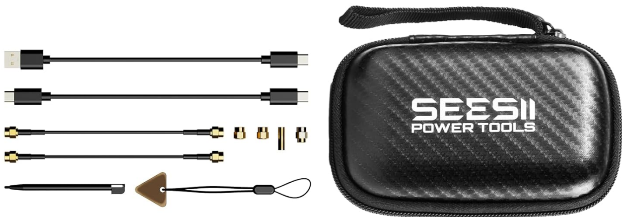
Figure 1.1: SEESII NanoVNA-H Vector Network Analyzer and included accessories.