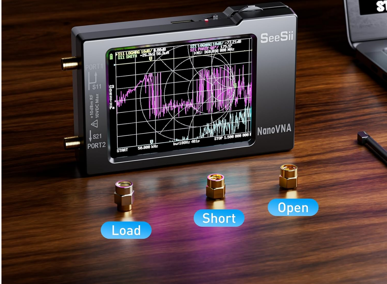
Figure 6.1: Calibration process using OPEN, SHORT, and LOAD standards.

Calibration must be performed whenever the frequency range to be measured is changed