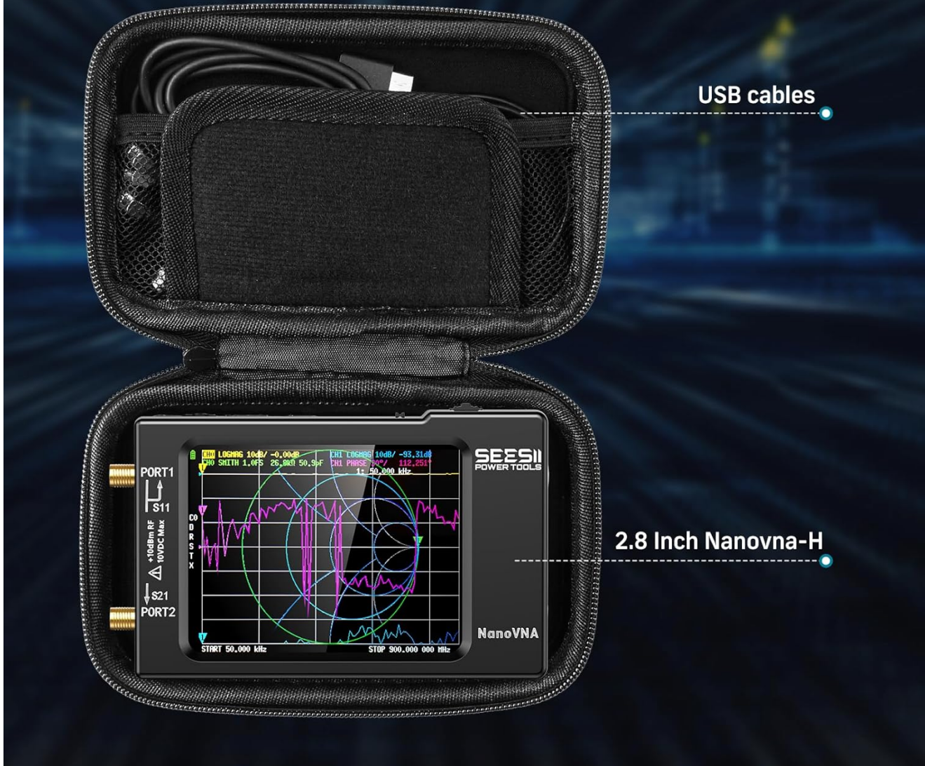
Figure 7.1: NanoVNA-H and accessories stored in the EVA case.