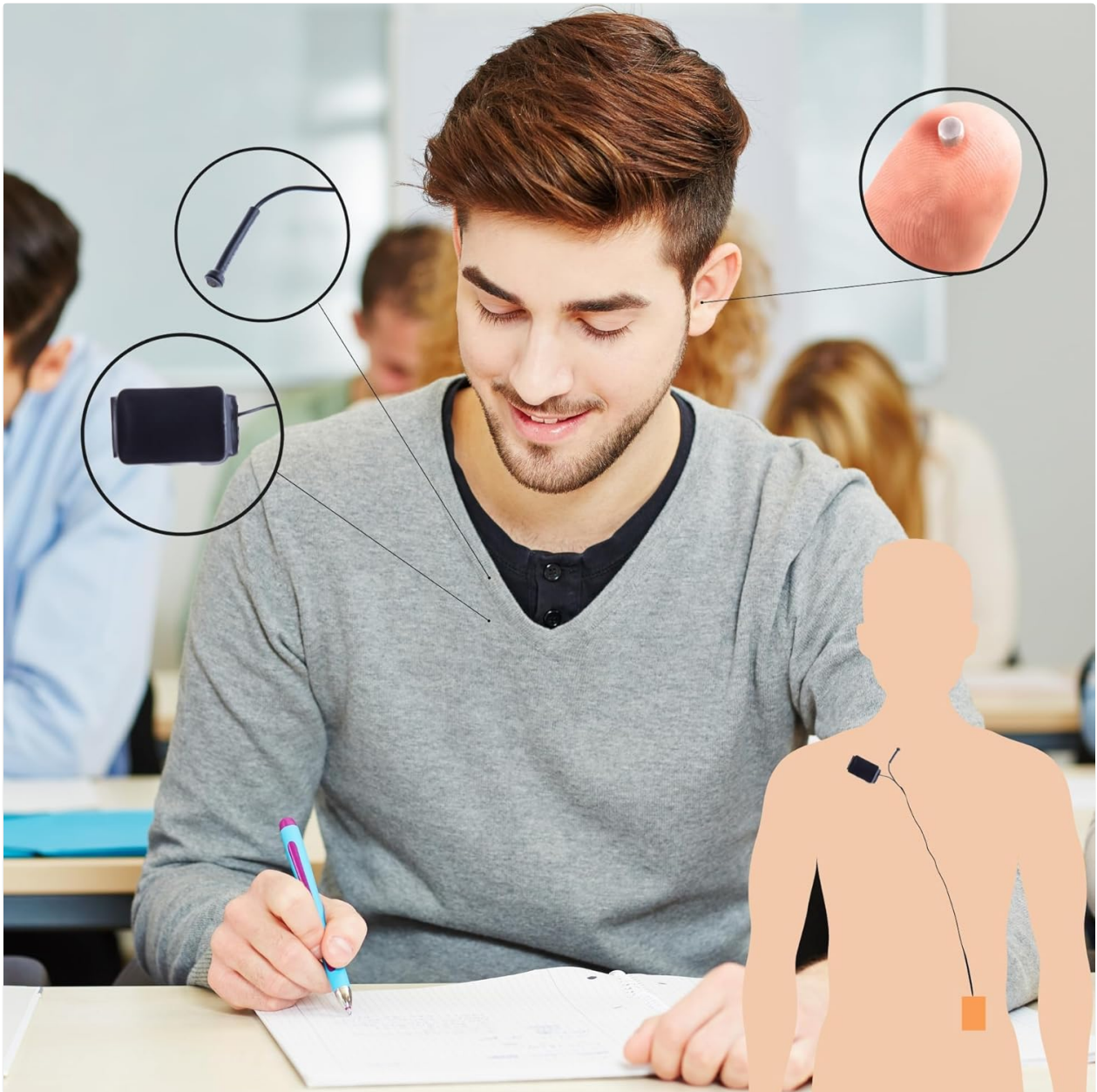
Figure 6: Diagram illustrating the discreet placement of the earpiece, necklace, and microphone.