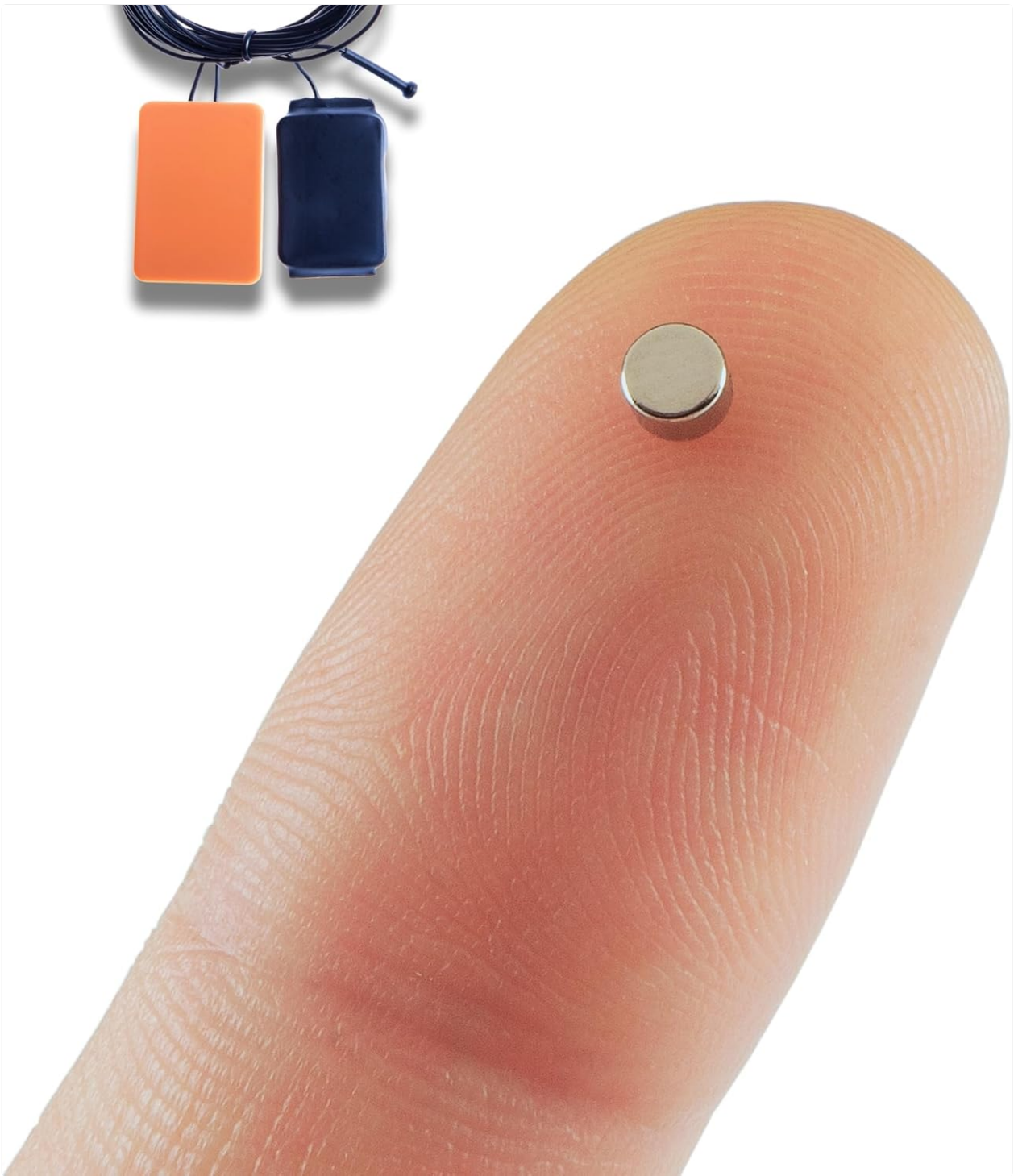
Figure 2: The Nano V6 earpiece, showcasing its extremely small and discreet design.