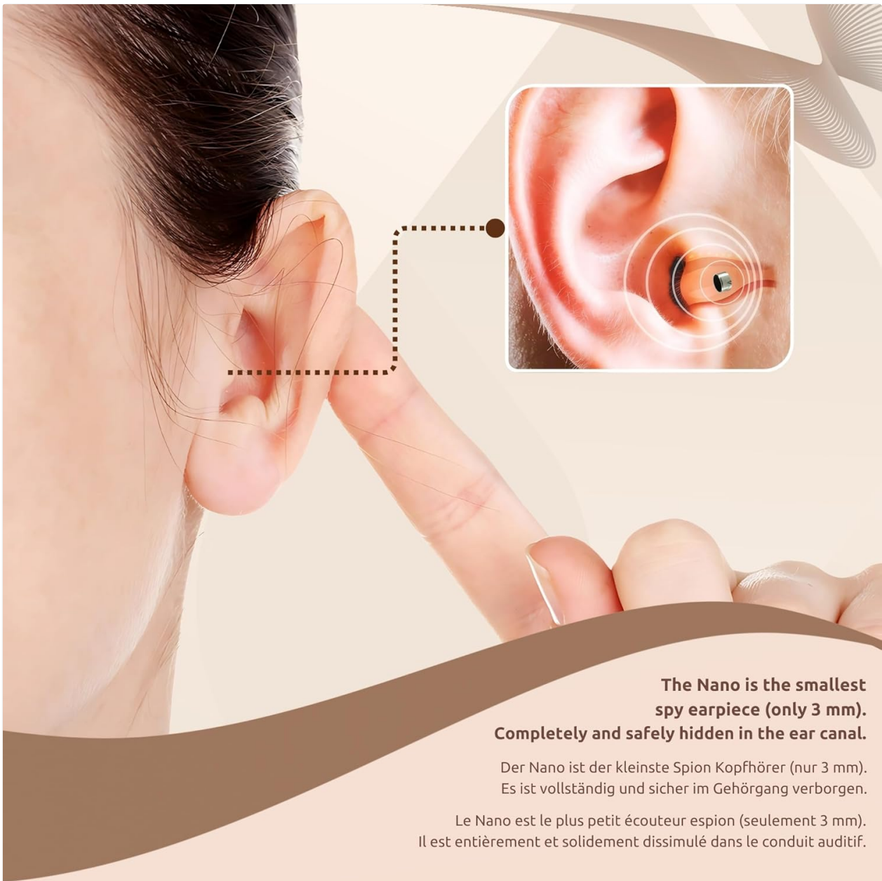
Figure 4: Proper placement of the Nano V6 earpiece within the ear canal for complete concealment.