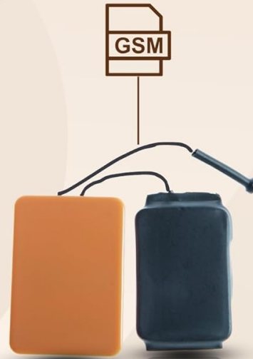
Figure 1: Overview of Nano V6 system features, including its compact size and wireless capabilities.