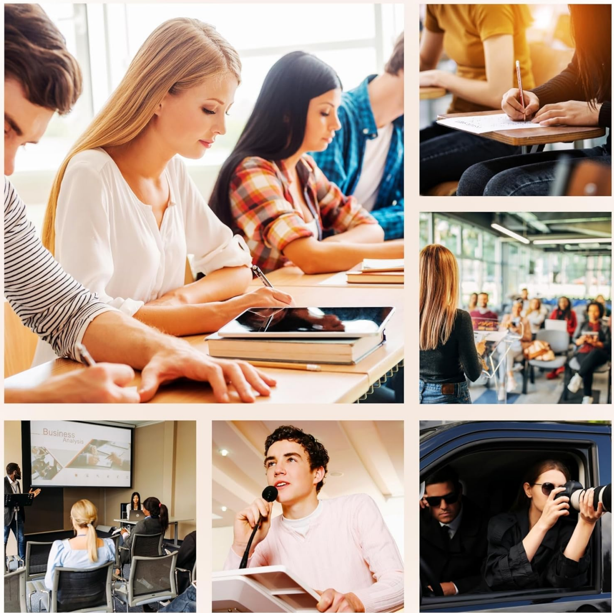
Figure 5: Examples of discreet applications for the Nano V6 system.