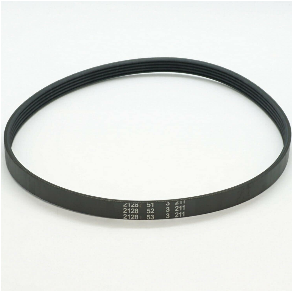
Image 1: A black multi-ribbed drive belt, approximately 22.87 inches long, designed for GE washing machines.