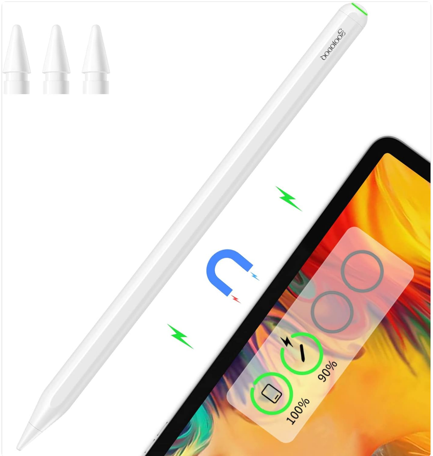
Image: The GOOJODOQ GD13 Stylus Pen, shown alongside an iPad displaying its wireless charging status and the three included replacement nibs.