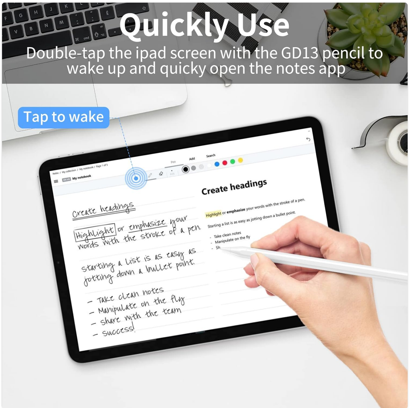
Image: A hand demonstrating the quick wake feature by double-tapping the iPad screen with the GD13 stylus to open the notes app.