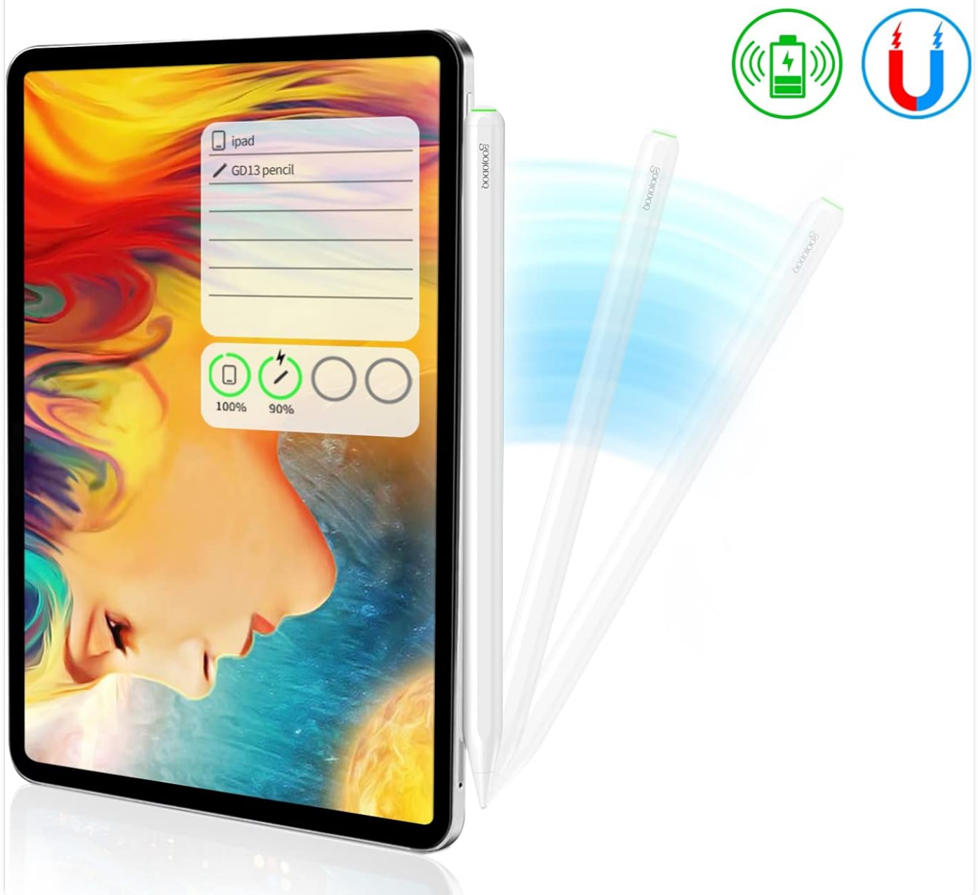
Image: The GD13 stylus magnetically attached to the side of an iPad, illustrating its wireless charging capability.

Ditch the cables, magnetically attach to the iPad for charging and storage