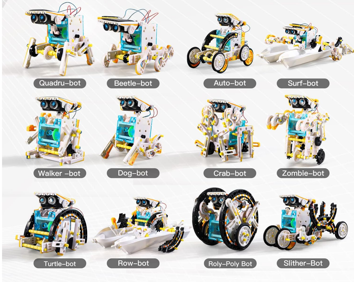
Image: A visual guide to the 12 different robot models that can be constructed from the kit.