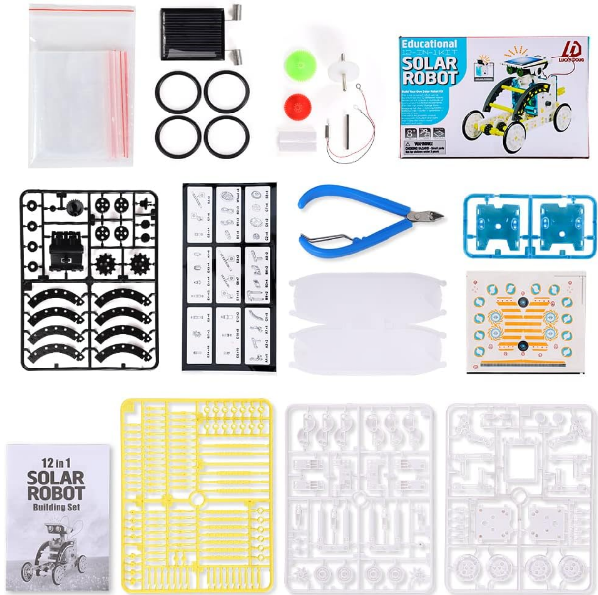
Image: All components of the Lucky Doug 12-in-1 STEM Solar Robot Kit, including plastic parts on sprues, a solar panel, motor, wires, and instruction manual.