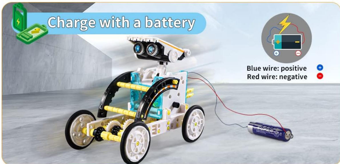
Image: Illustration of how the robot can be powered by the sun via its solar panel or by a battery.