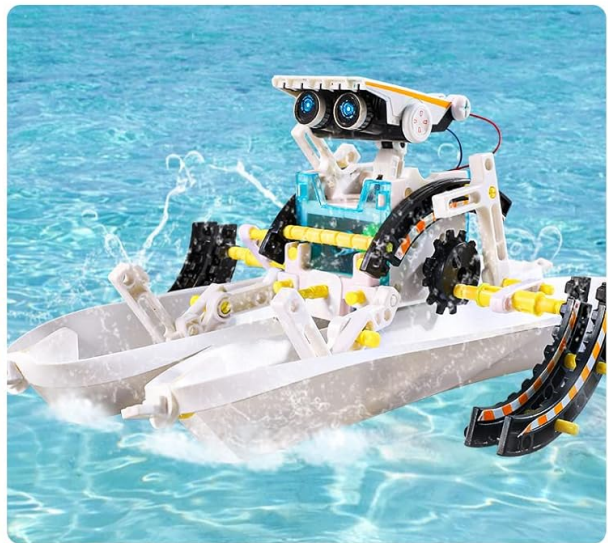
Image: Examples of robots operating on land and water, showcasing the versatility of the kit.