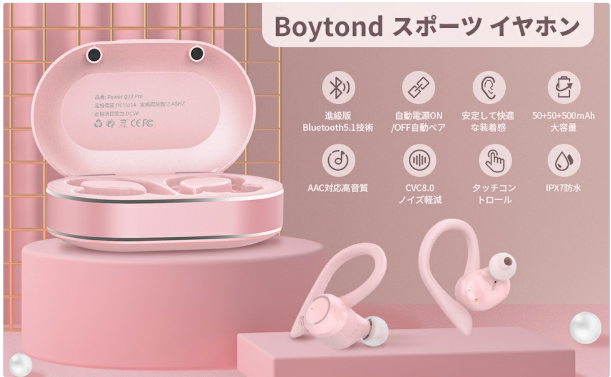
Image: An overview of the Boytond Sports Earphones, highlighting features such as Bluetooth 5.1, automatic pairing, comfortable fit, large battery capacity, AAC high-quality audio, CVC8.0 noise reduction, touch control, and IPX7 waterproofing.