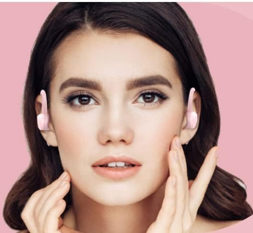
Image: An illustration showing the flexibility of using the earphones in mono mode (either left or right earbud independently) or stereo mode (both earbuds for a full audio experience).