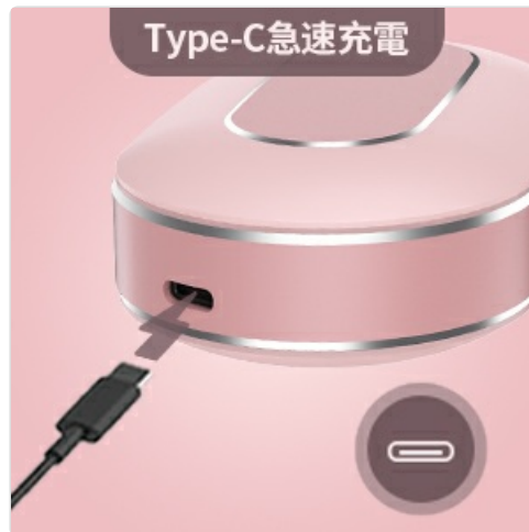
Image: A close-up of the charging case showing the Type-C fast charging port and a USB-C cable being inserted.

Battery Life: The earphones provide approximately 8 hours of continuous playback on a full charge. With the charging case, the total playback time extends to about 25 hours.