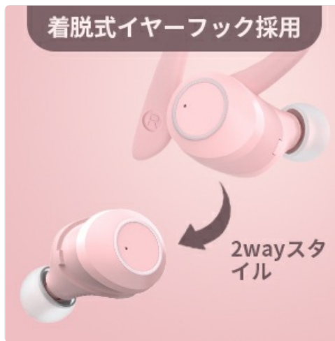
Image: A diagram showing the detachable ear hook, illustrating how the earphone can be used with or without the hook for a 2-way style.