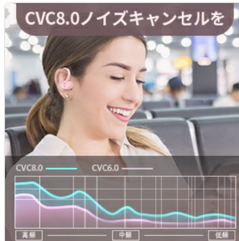
Image: A graph comparing CVC8.0 noise cancellation with CVC6.0, illustrating improved noise reduction across high, mid, and low frequencies for clearer calls.