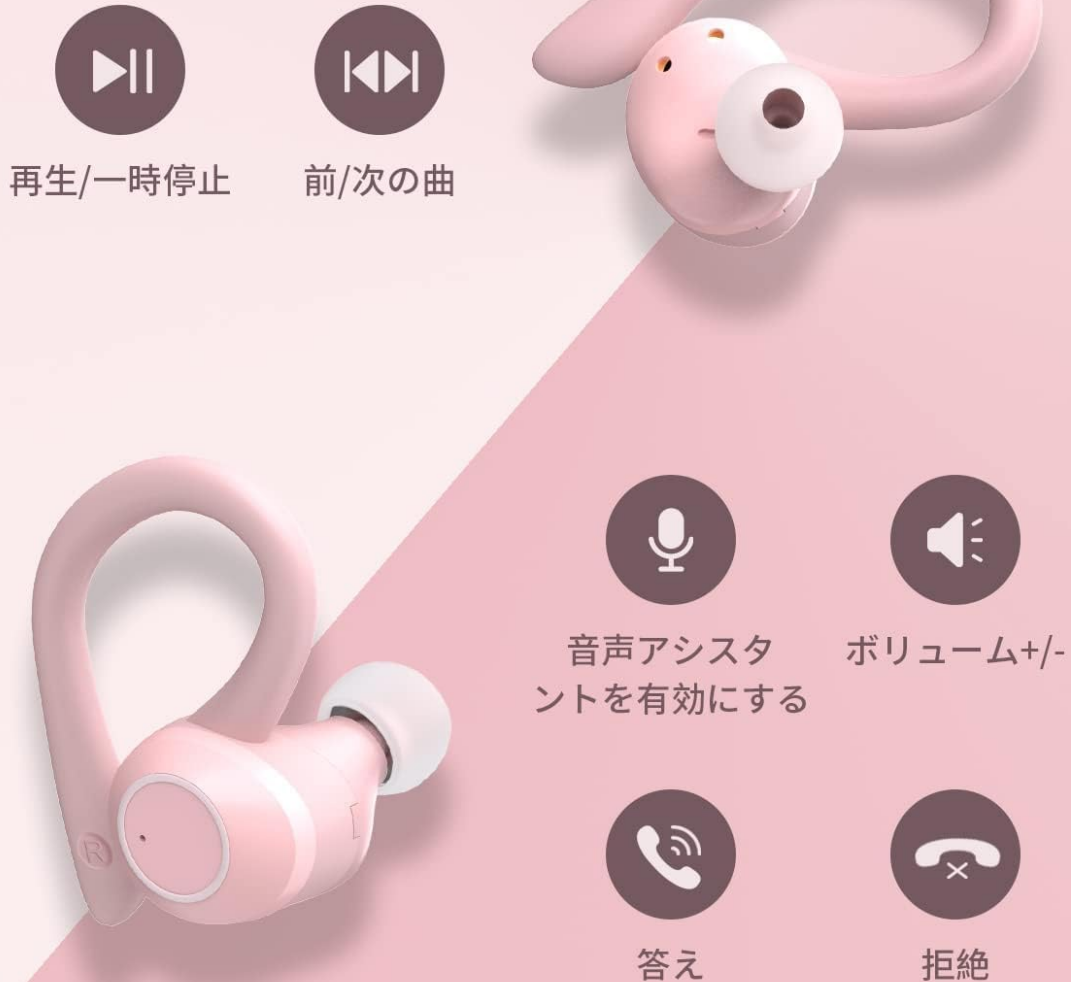
Image: A diagram illustrating the touch control functions of the earphones. It shows controls for play/pause, previous/next track, activating voice assistant, volume adjustment, answering calls, and rejecting calls.