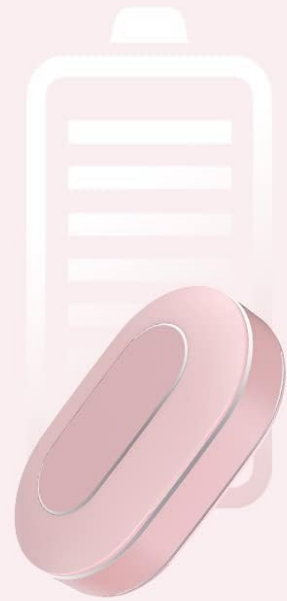
Image: A visual representation of battery life, indicating 5 hours of playback for the main unit, 25 hours with the charging case, and 1.5 hours for charging the case.