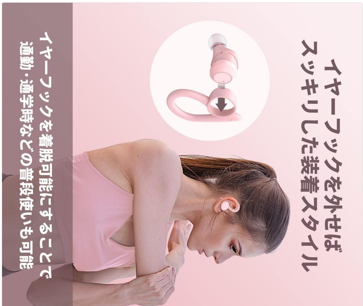
Image: A visual demonstrating that the ear hook can be removed for a sleek wearing style, making it suitable for daily use like commuting or studying.