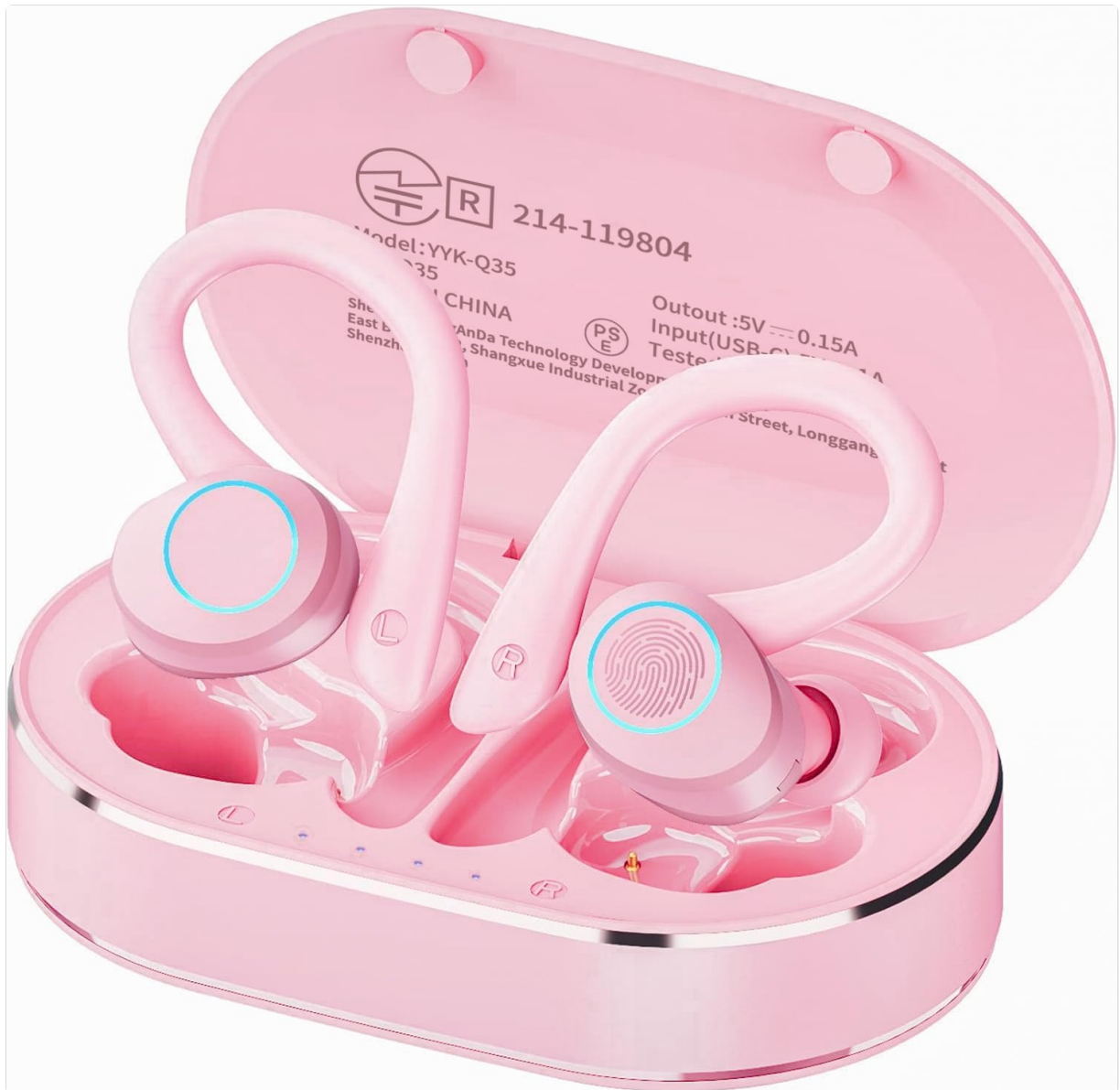
Image: The Boytond Bluetooth Earphones, showing both earbuds nestled in their charging case. The case is open, revealing the pink earphones with ear hooks.