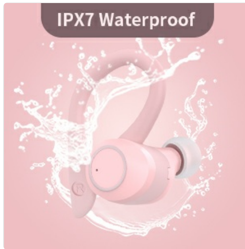
Image: An earphone being splashed with water, visually representing its IPX7 waterproof rating, suitable for resisting sweat and rain during sports activities.

The earphones are IPX7 waterproof, meaning they can withstand sweat and light rain. They are not suitable for swimming or showering. Ensure the earphones are dry before placing them back into the charging case to prevent damage.