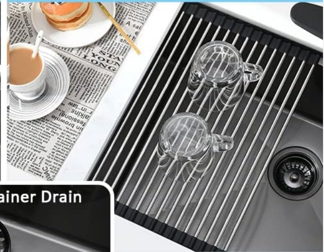
Basket Strainer Drain