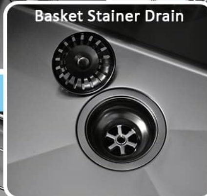
Basket Strainer Drain