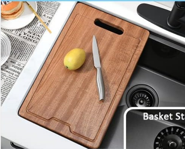
Wood Cutting Board