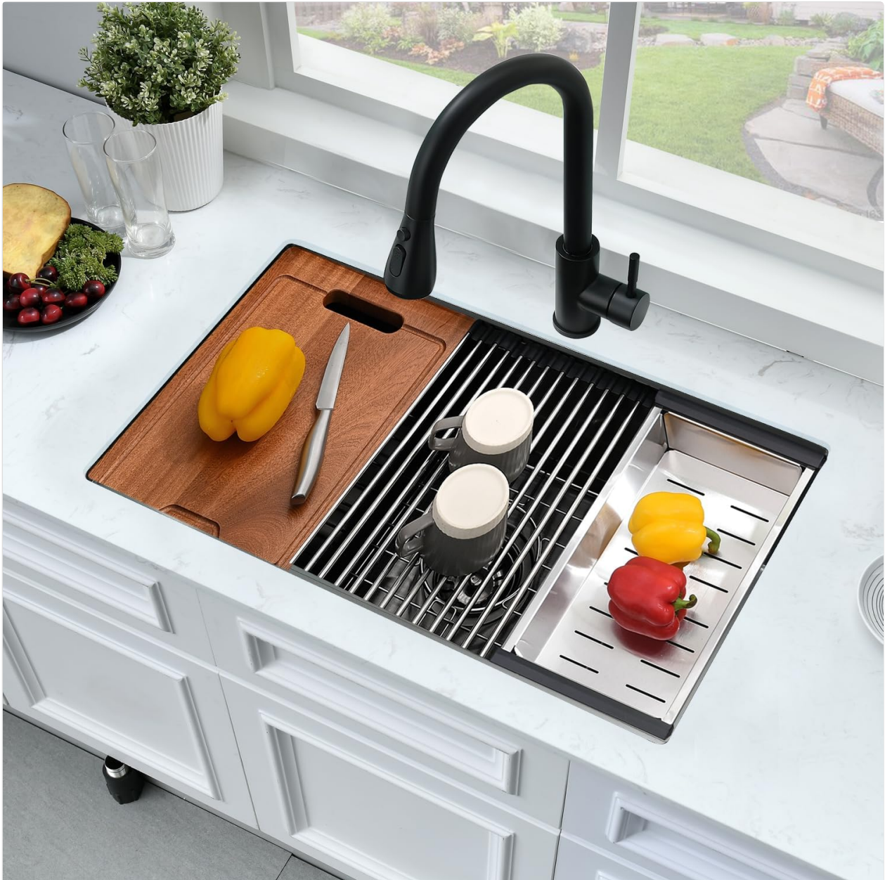
The Bokaiya workstation sink integrated into a kitchen counter, featuring a wooden cutting board and a roll-up drying rack positioned on the integrated ledges, demonstrating its functional design for food preparation and dish drying.