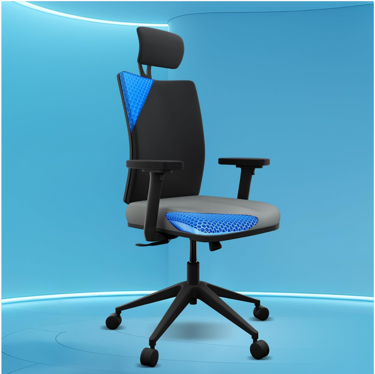
Image: The Sleep Company Onyx Orthopedic Office Chair. This image showcases the chair's design and the visible SmartGRID elements in the seat and backrest, indicating its ergonomic features.