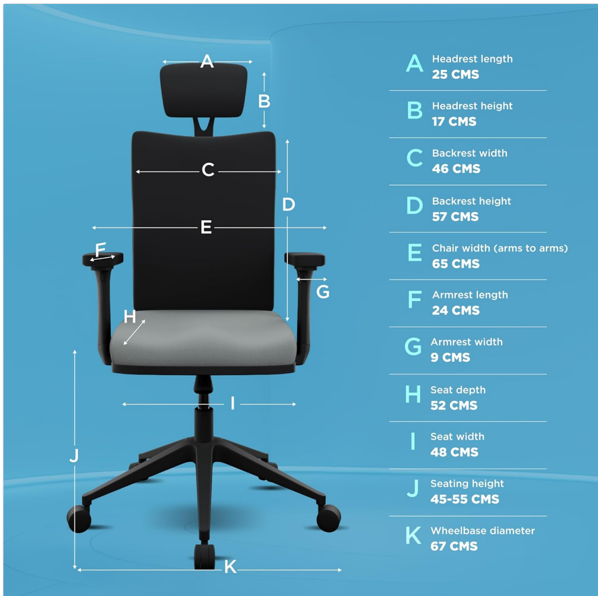
Image: The Sleep Company Onyx Orthopedic Office Chair with key dimensions. This diagram illustrates the chair's overall structure and measurement points for various components like headrest, backrest, armrests, seat, and wheelbase.