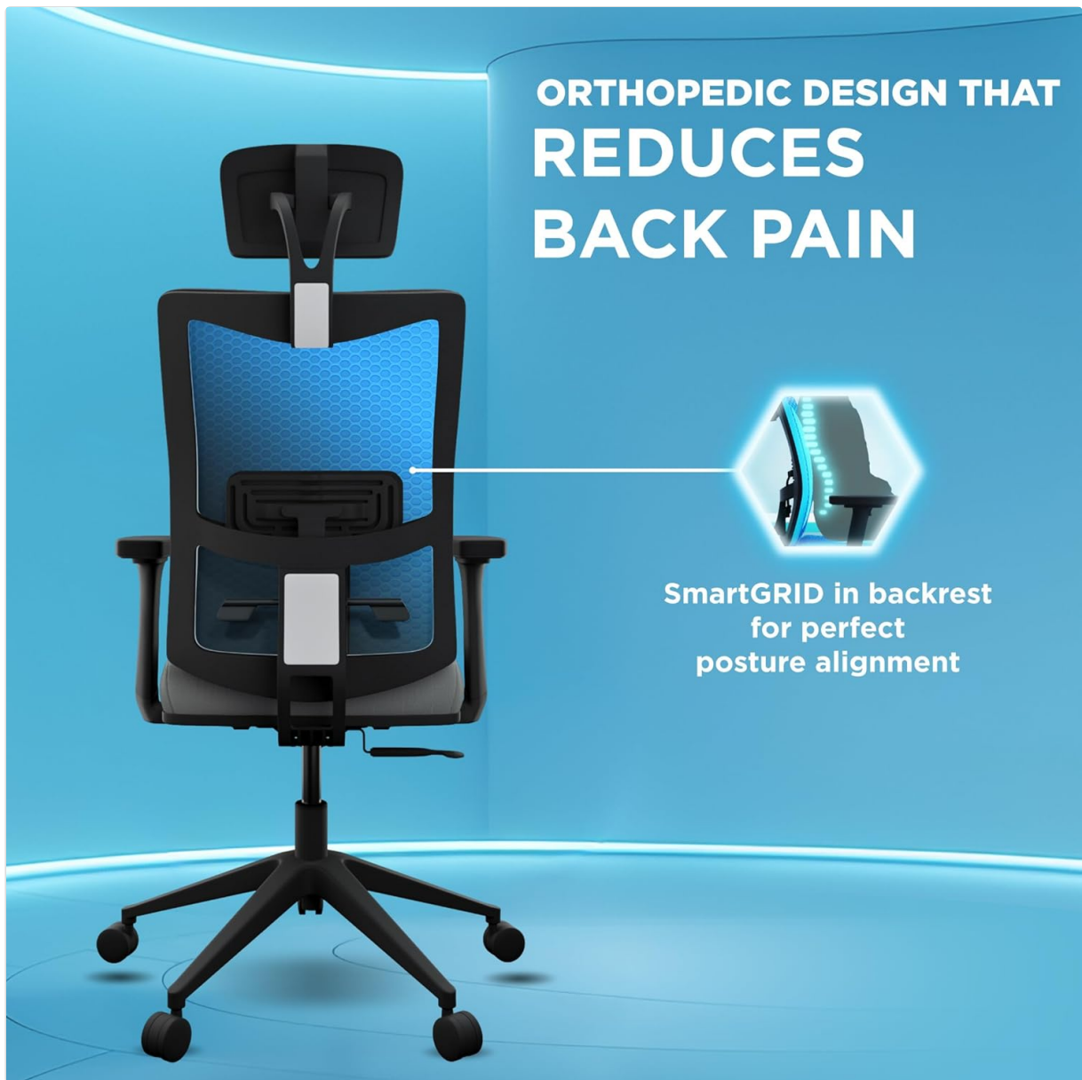
Image: Rear view of the Onyx chair, highlighting its orthopedic back support and the integration of SmartGRID technology within the backrest. This design aims to promote proper spinal alignment and reduce back discomfort.