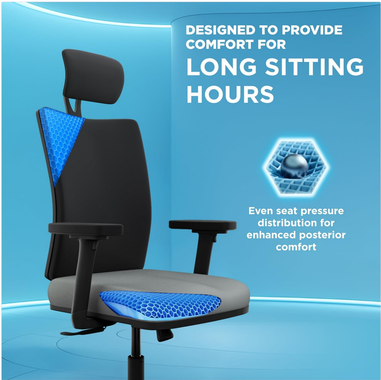
Image: A detailed view of the Onyx chair's seat and backrest, emphasizing the patented SmartGRID technology. This technology is designed for pressure distribution and enhanced comfort during extended sitting.

Even seat pressure distribution for enhanced posterior comfort