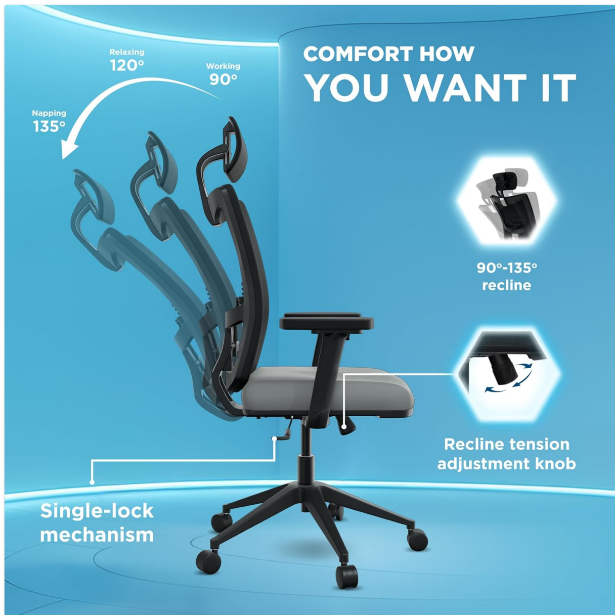
Image: The Onyx chair illustrating its recline functionality, ranging from 90° (working) to 135° (napping), and the recline tension adjustment knob. This shows how users can choose their preferred comfort level.