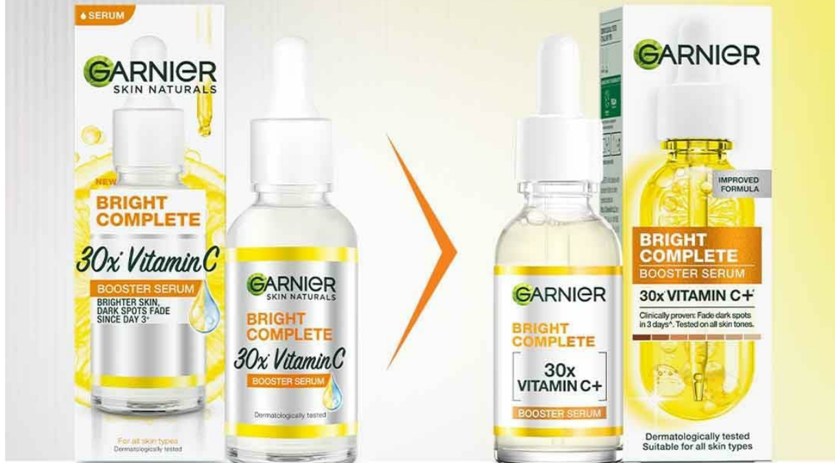
Image: Comparison of Garnier Skin Naturals Glow Serum packaging, highlighting a new look with the same trusted formula.