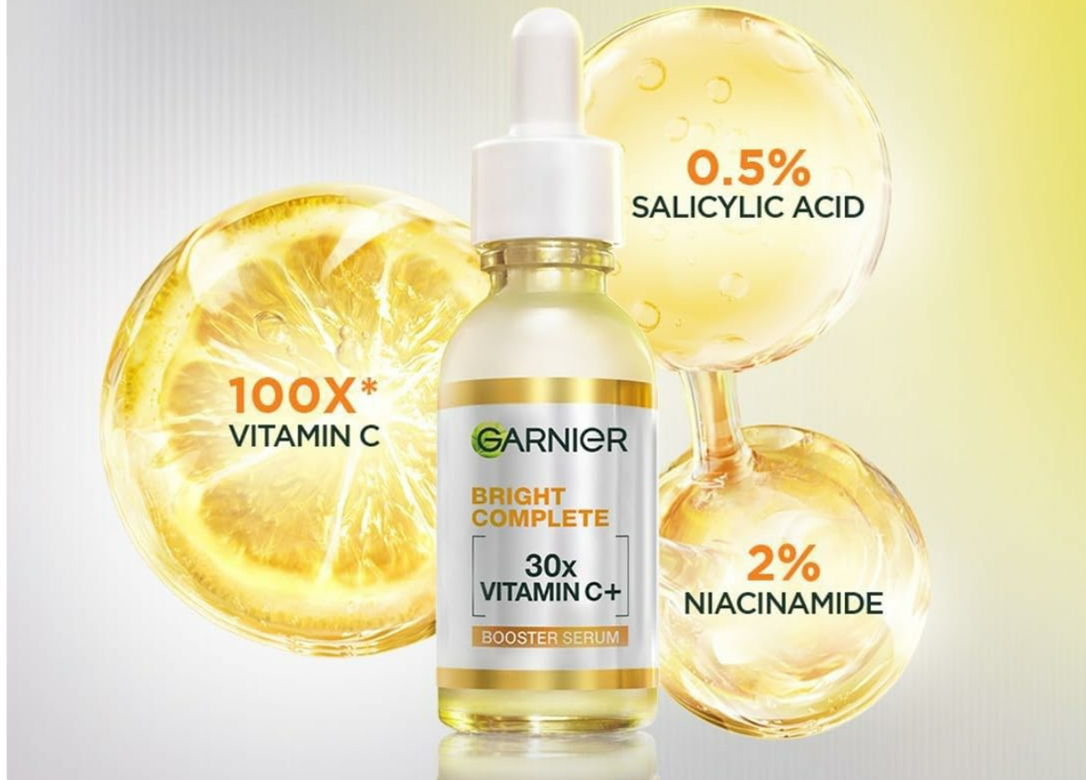
Image: Visual representation of key ingredients: Vitamin C+, 0.5% Salicylic Acid, and 2% Niacinamide.