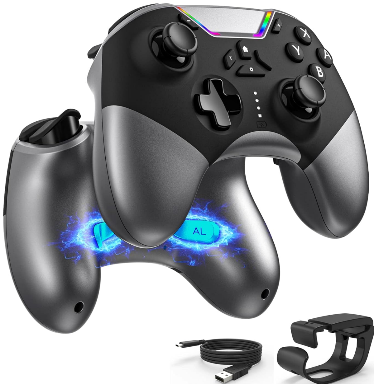
Figure 2: Included accessories: controller, phone clip, and USB-C cable.