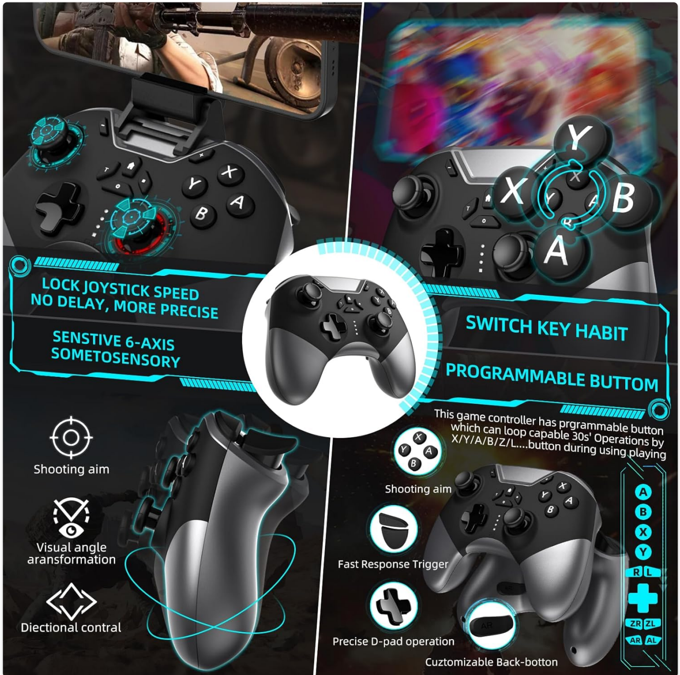
Figure 7: Key features of the aghi controller.

Home Wake-Up: Short press the Home button to wake up the controller and connected device.