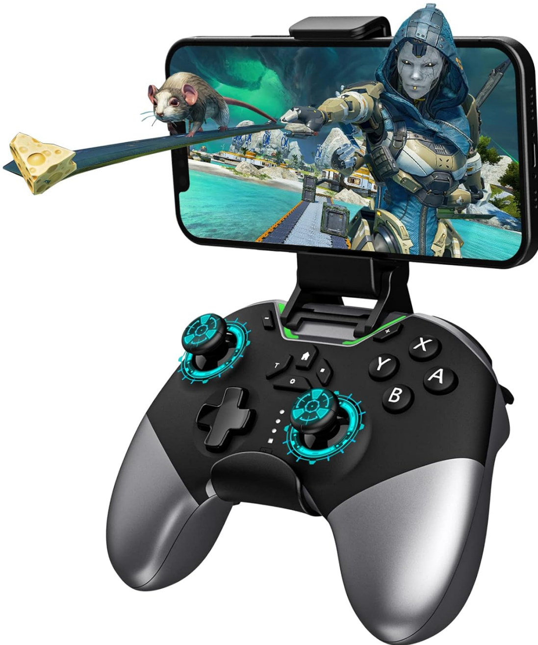
Figure 1: Aghi Bluetooth Controller with a smartphone mounted, showcasing its mobile gaming capability.