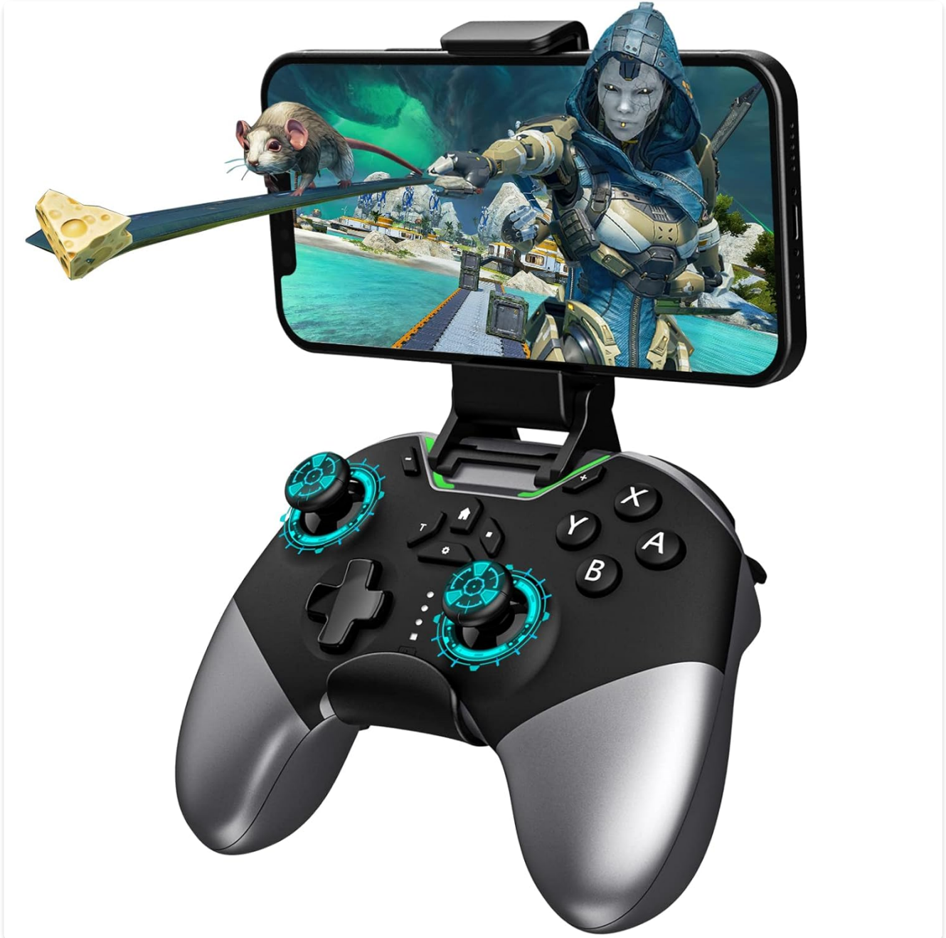
Figure 6: Controller with phone clip attached.

The included phone clip can be attached to the controller to hold your smartphone. It is suitable for phones with widths ranging from 45mm to 75mm (approximately 3.6-6.5 inches).