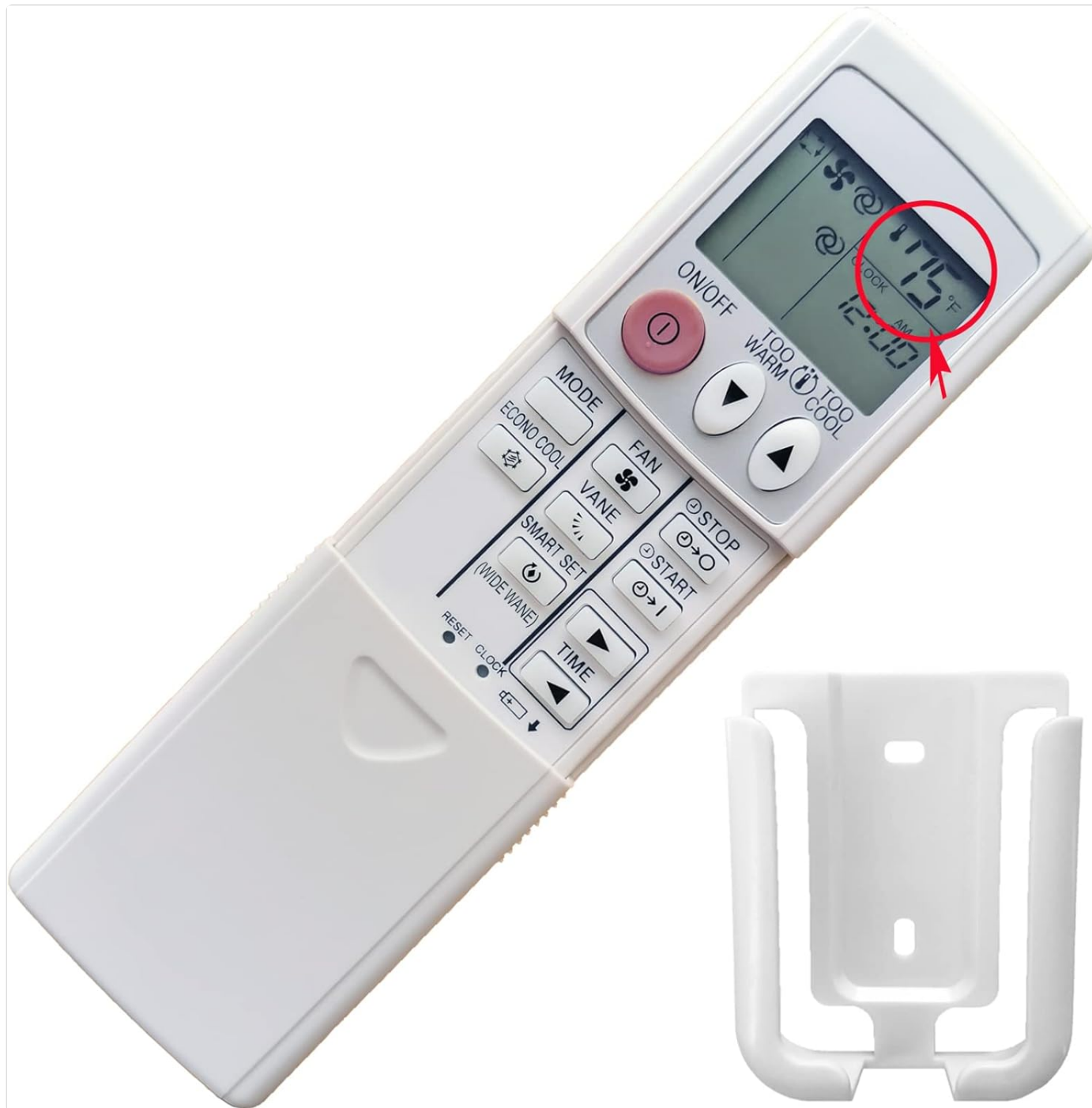
Image: The remote control with a red circle highlighting the temperature display area, showing the current temperature and unit.

Familiarize yourself with the buttons and display on your remote control to effectively manage your air conditioner.