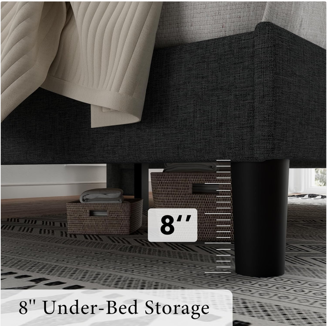
Figure 4: Illustration of the 8-inch under-bed storage space.