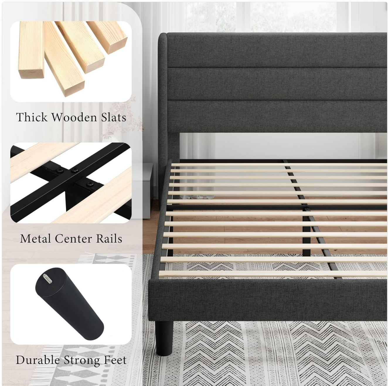
Figure 2: Components such as thick wooden slats, metal center rails, and durable feet, designed for robust support.