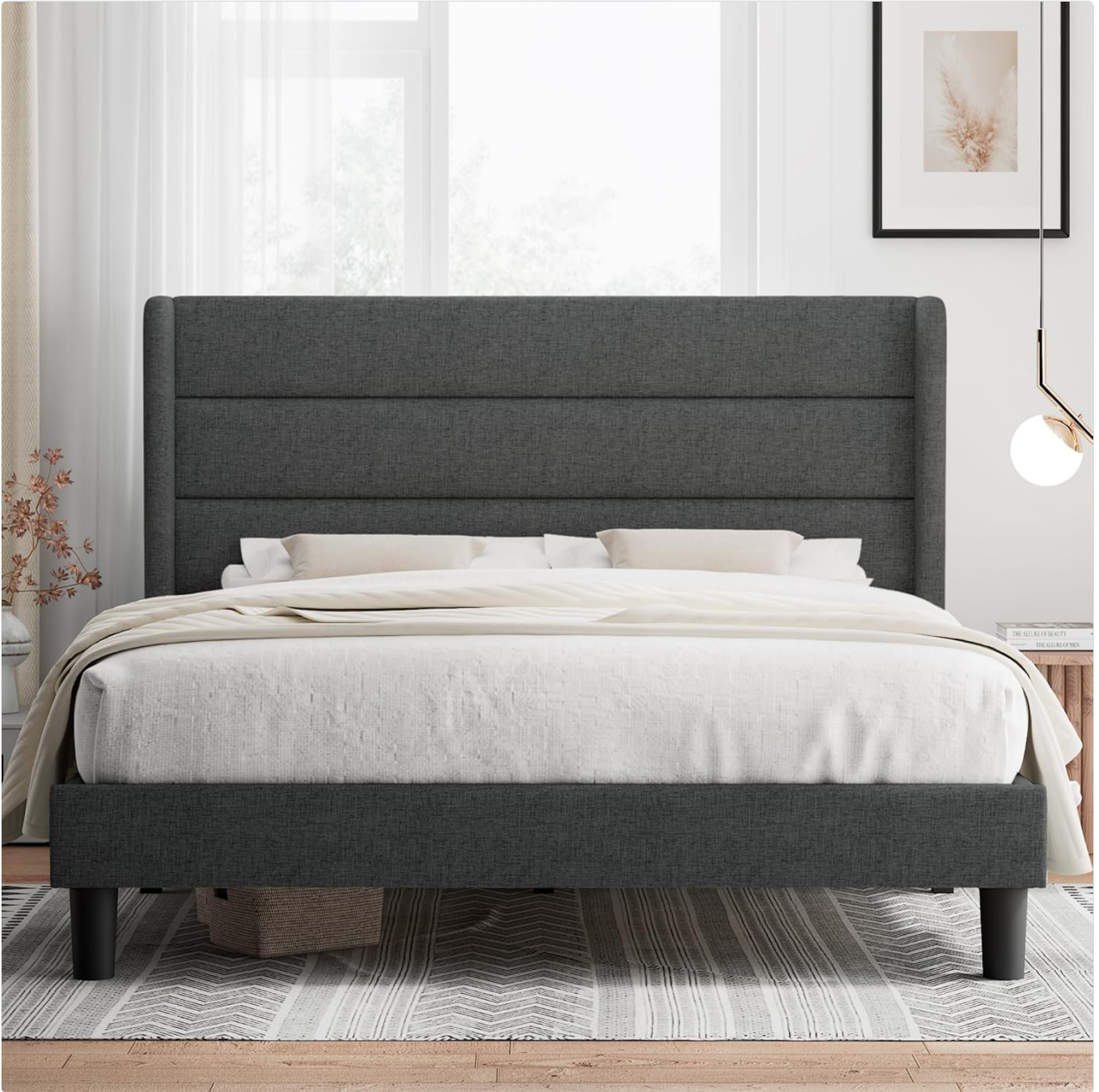
Figure 1: Fully assembled iPormis Queen Bed Frame with Wingback in Dark Gray.