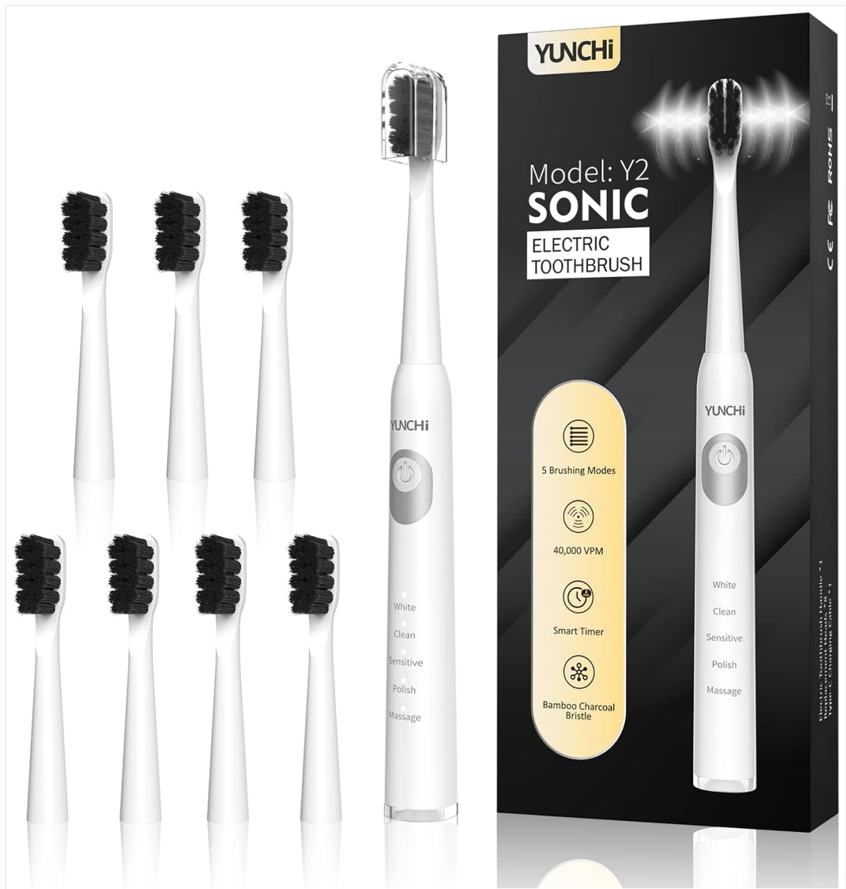
Image: YUNCHI Sonic Electric Toothbrush Y2, showing the handle, eight charcoal brush heads, and the product packaging.