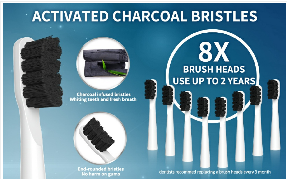
Image: YUNCHI Sonic Electric Toothbrush Y2 with a display of eight activated charcoal brush heads, indicating their long-term usability.