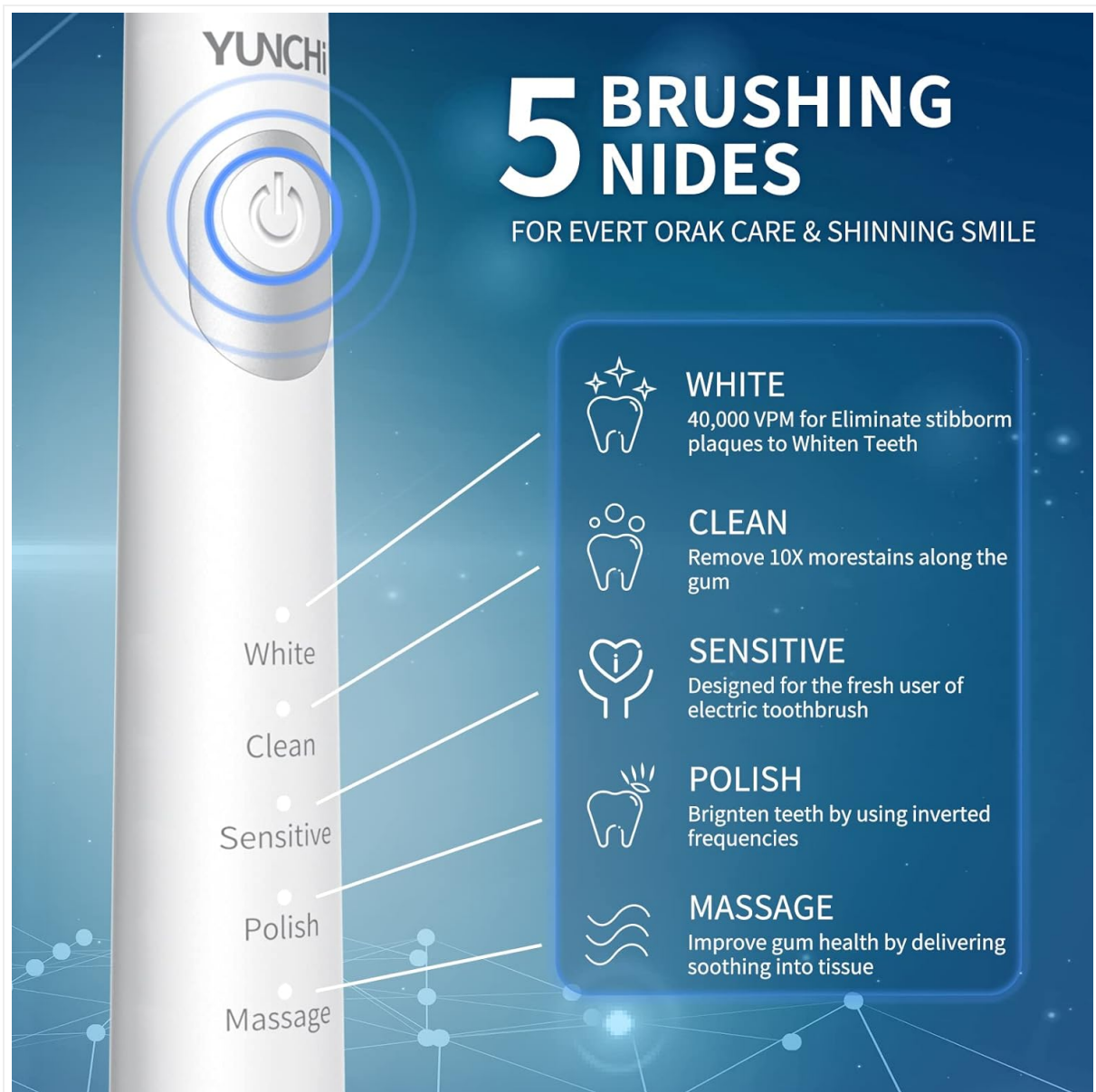
Image: YUNCHI Sonic Electric Toothbrush Y2 handle, highlighting the power button and the five distinct brushing modes: White, Clean, Sensitive, Polish, and Massage.