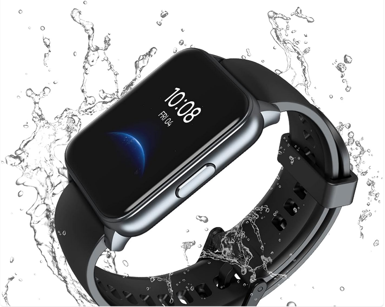
Image: The DIZO Smartwatch being splashed with water, illustrating its IP68 water-resistant capability, safe for activities like hand washing.