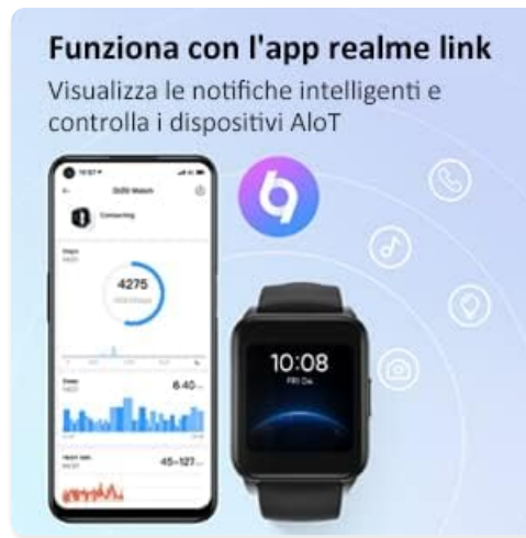
Image: A smartphone displaying the realmeLink application interface, showing activity data and connection status, alongside the DIZO Smartwatch, indicating app connectivity.