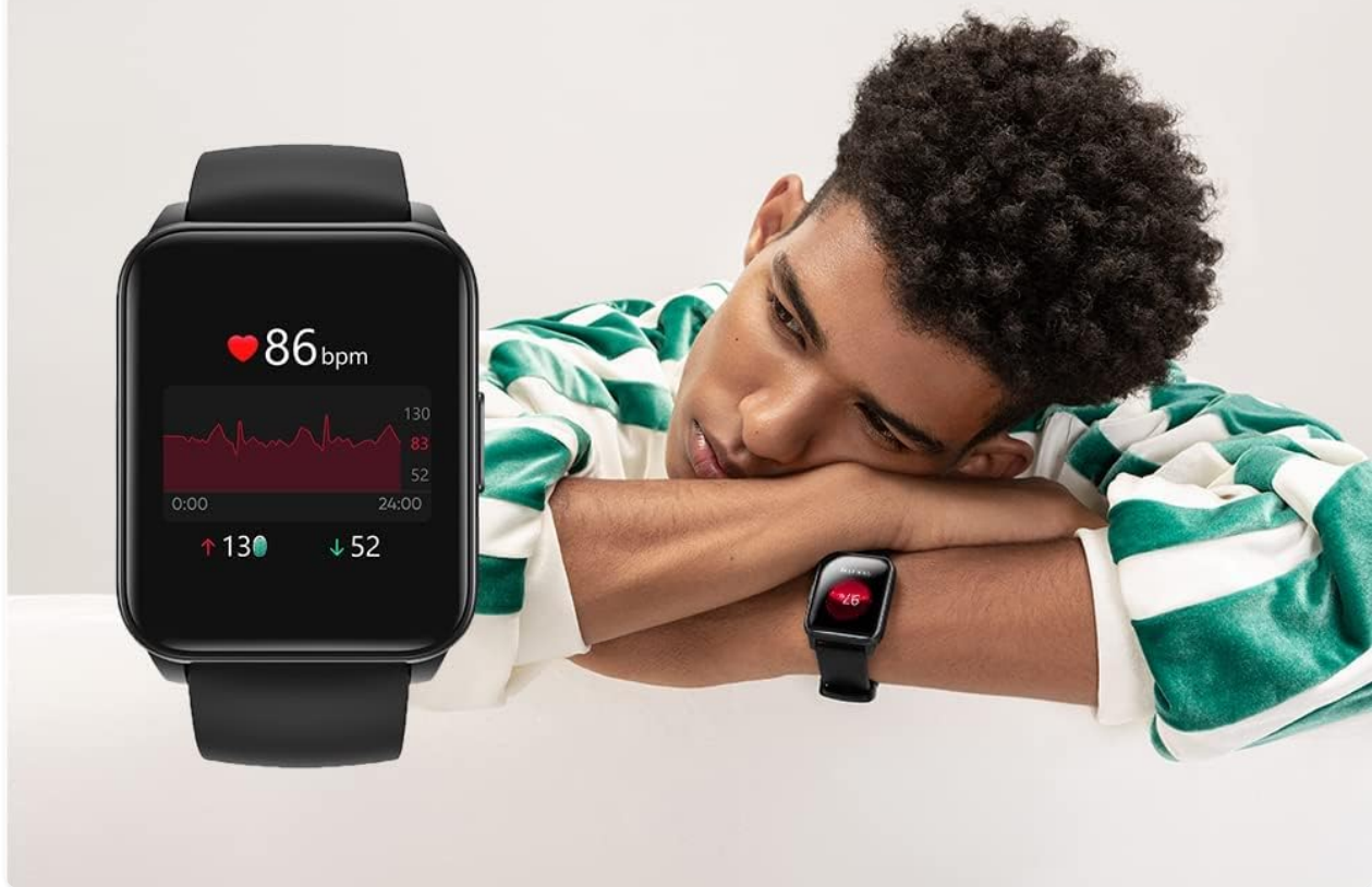
Image: The DIZO Smartwatch screen showing real-time heart rate data (86 bpm) and a graph, with icons for heart rate, blood oxygen, and sleep quality monitoring above a person wearing the watch.