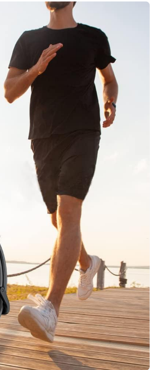
Image: The DIZO Smartwatch displaying activity tracking metrics like steps, heart rate, and calories, alongside a smartphone showing a map of a running route and a person running, illustrating 24-hour activity tracking.