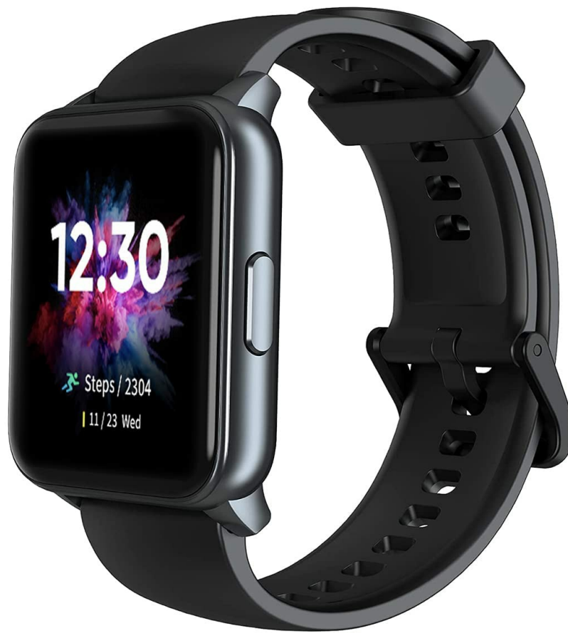
Image: The DIZO Smartwatch displaying different watch faces and icons representing features like call reminder, message reminder, blood oxygen monitoring, heart rate monitoring, sleep monitoring, calorie tracking, steps, 90 sports modes, camera control, music control, find phone, and stopwatch.