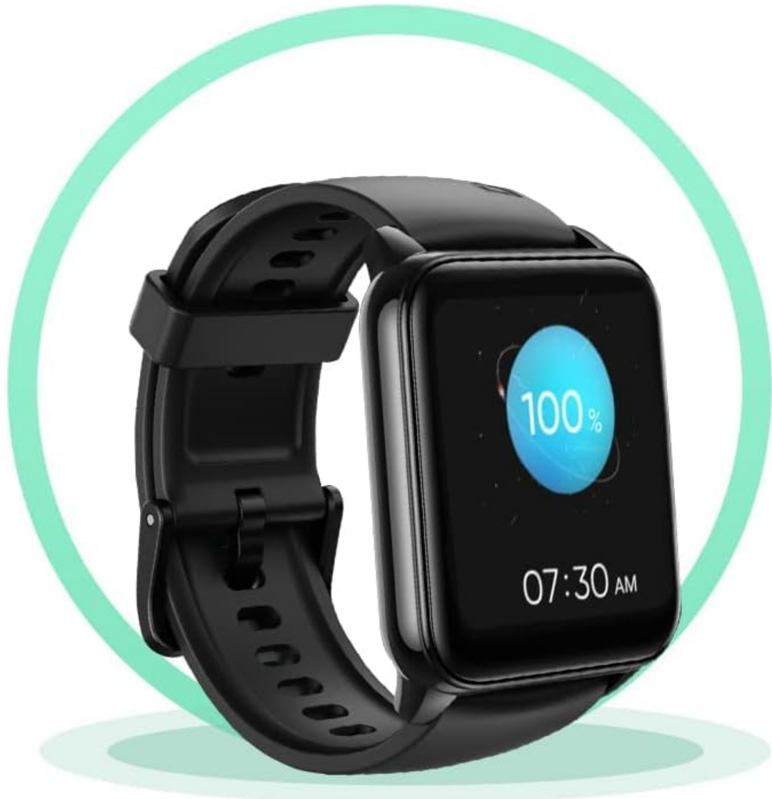
Image: The DIZO Smartwatch screen showing a 100% battery charge indicator and the time 07:30 AM, illustrating its long battery life.

315mAh Large Battery Stores Enough Power to Enjoy Outdoor Sports