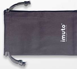
Figure 9: Warranty Information