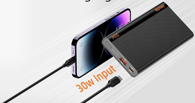
Figure 7: Fast Charging a Smartphone