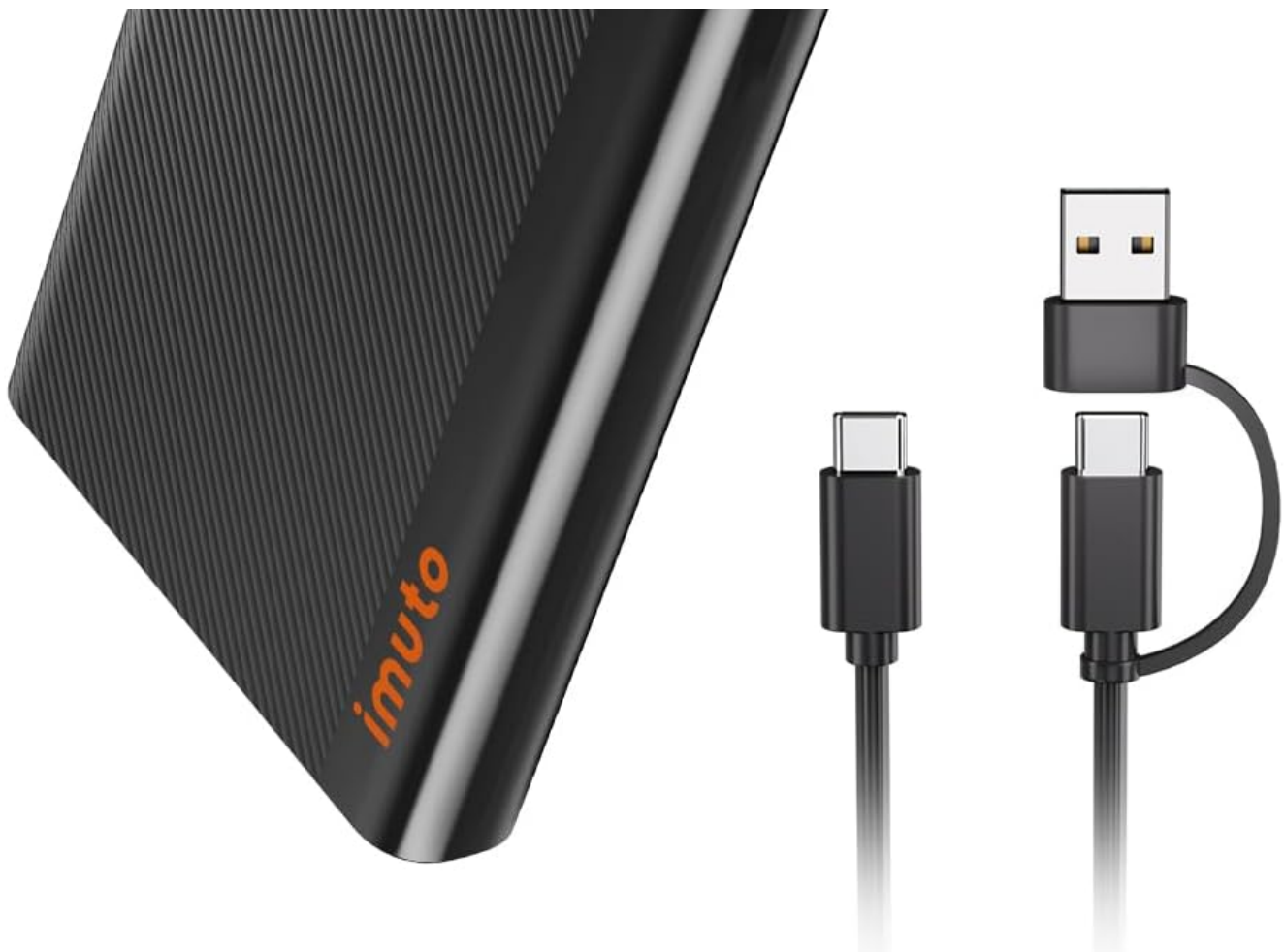
Figure 1: imuto 30W Slim Portable Charger