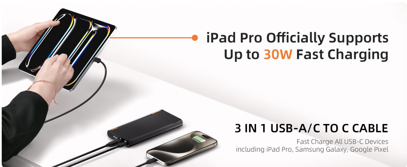
Figure 5: 30W Fast Charging for iPad Pro