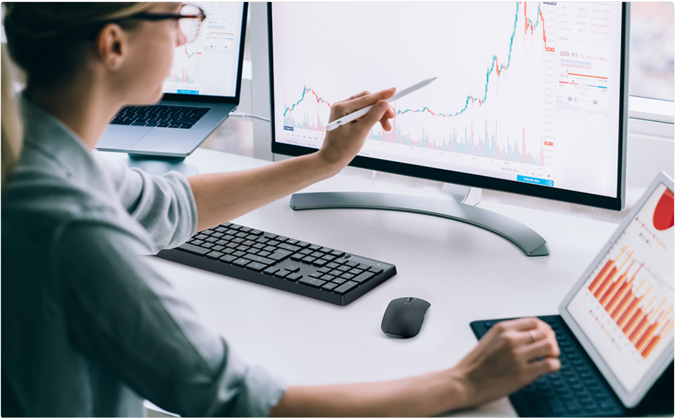
Image 3.3: A user operating the VEILZOR keyboard and mouse in a typical office or home setup, demonstrating its practical application.