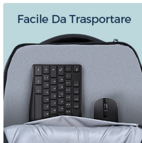
Image 4.1: The compact dimensions of the keyboard and mouse, illustrating their portability and ease of storage.