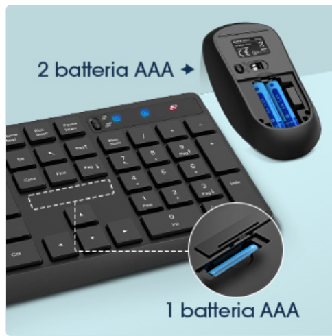
Image 2.1: Illustration showing the battery compartments for the keyboard (1 AAA battery) and mouse. Note: The image shows 2 AAA batteries for the mouse, but product specifications indicate 1 AA battery. Please refer to the markings inside the battery compartments for the correct battery type and quantity.