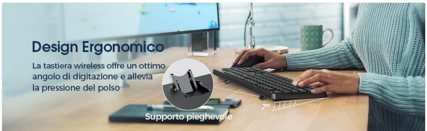
Image 3.2: The keyboard's ergonomic design, showing the foldable support that provides a 7-degree typing angle for improved comfort.