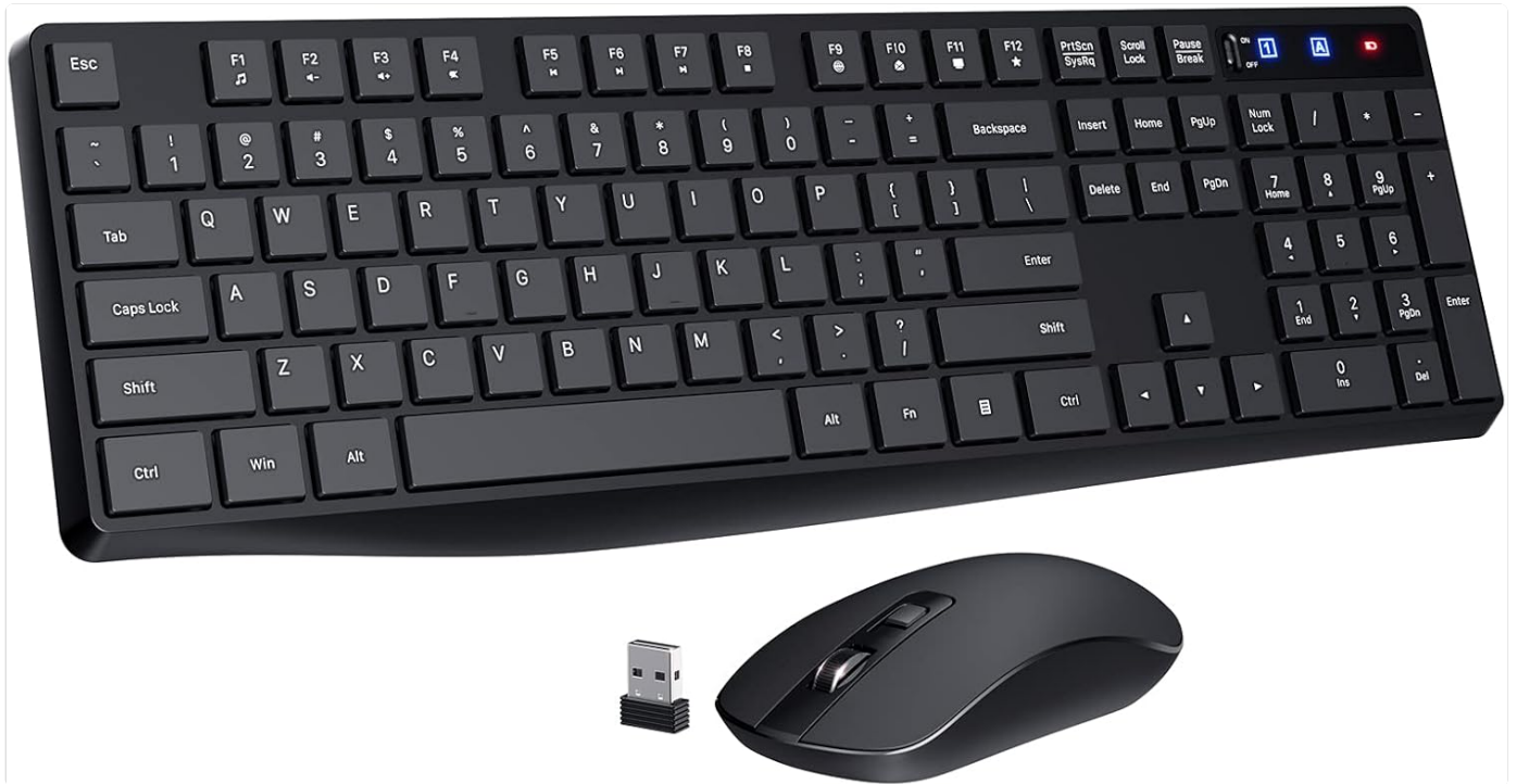
Image 1.1: The VEILZOR Wireless Keyboard and Mouse Kit, including the keyboard, mouse, and USB receiver.

Thank you for choosing the VEILZOR Wireless Keyboard and Mouse Kit. This kit provides a convenient and efficient solution for your computing needs, offering a full-size keyboard with a numeric keypad and a responsive mouse, both connected wirelessly via a single 2.4 GHz USB receiver. This manual will guide you through the setup, operation, maintenance, and troubleshooting of your new wireless peripheral set.