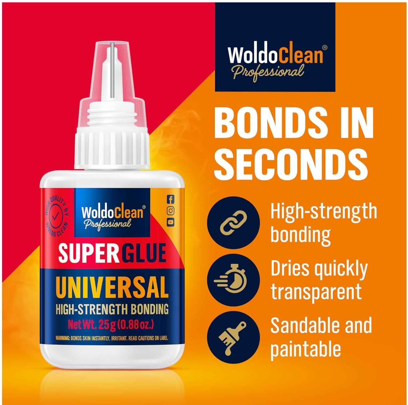
Figure 2: Key Bonding Properties