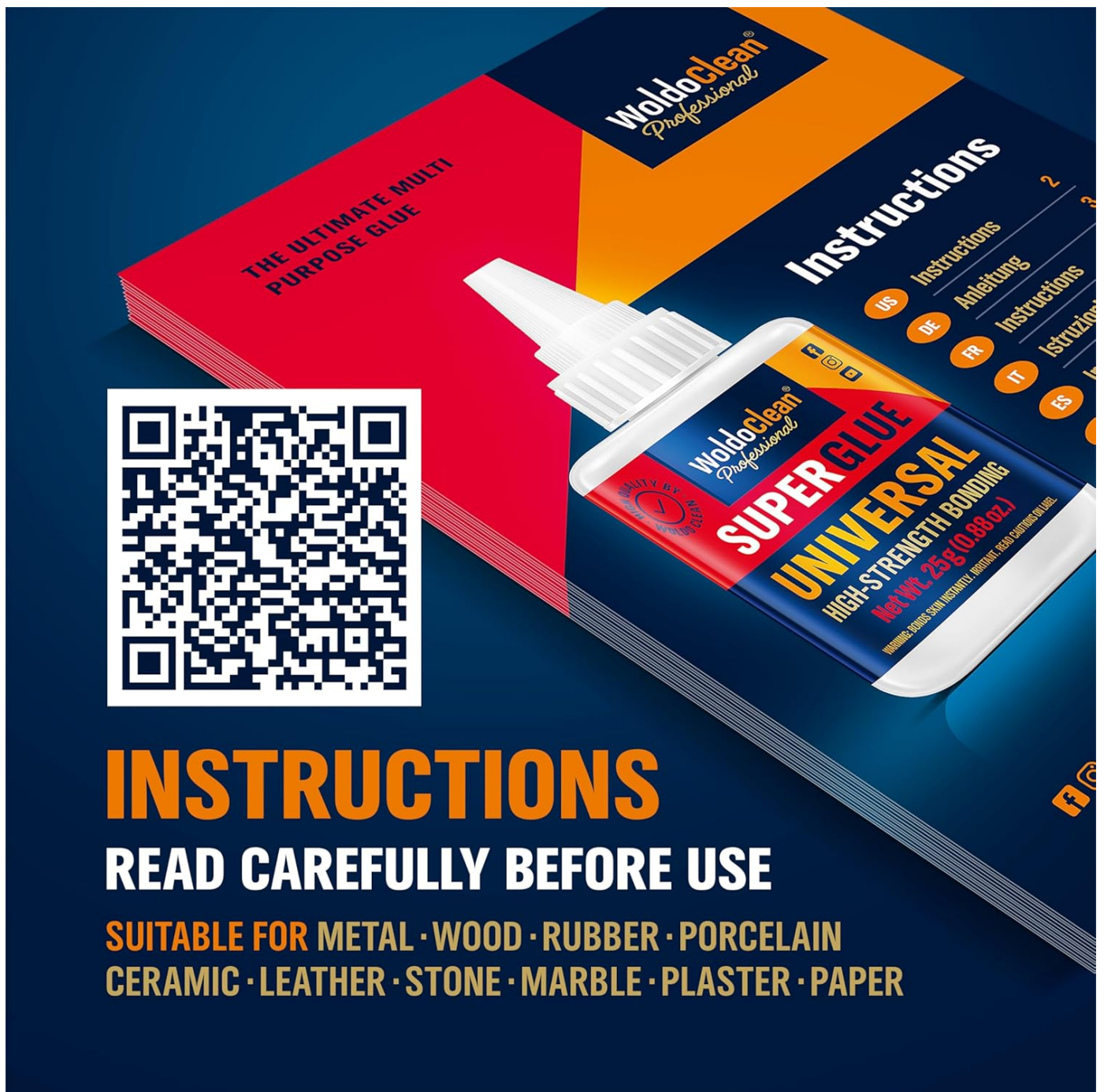
Figure 10: Scan QR Code for Instructions

WoldoClean is committed to providing high-quality products. For any inquiries or assistance, please contact WoldoClean customer support through their official channels.