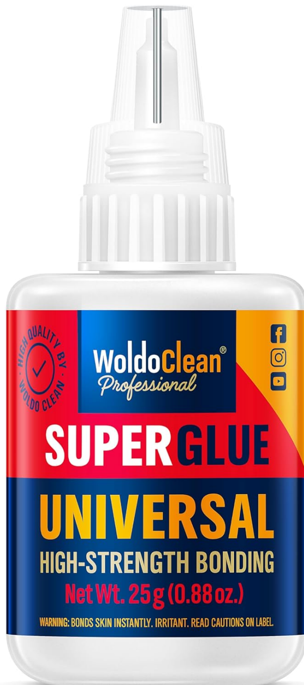
Figure 1: WoldoClean Super Glue Universal Product