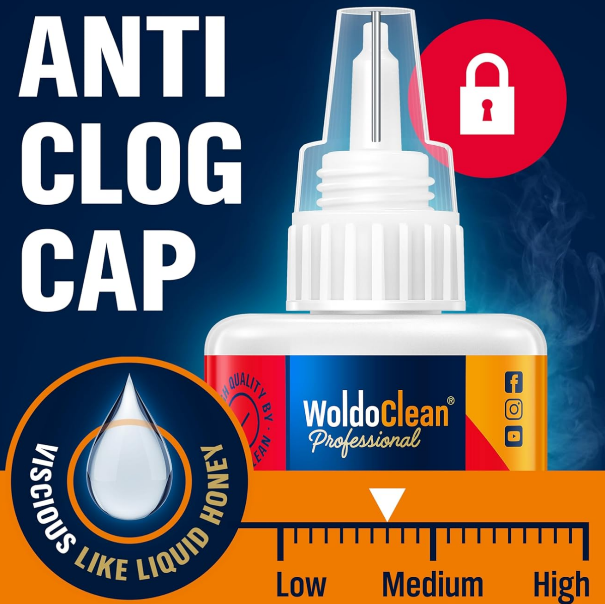
Figure 4: Anti-Clog Cap and Viscosity