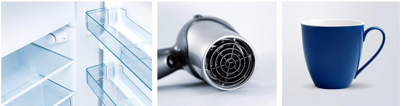
Figure 9: Versatile Household Repairs