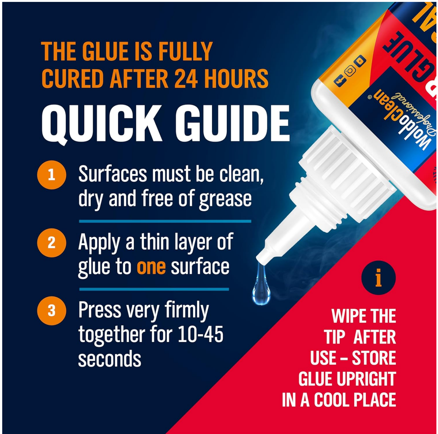
Figure 6: Quick Guide for Application

4. Curing: The glue will achieve full cure in 24 hours for maximum strength.