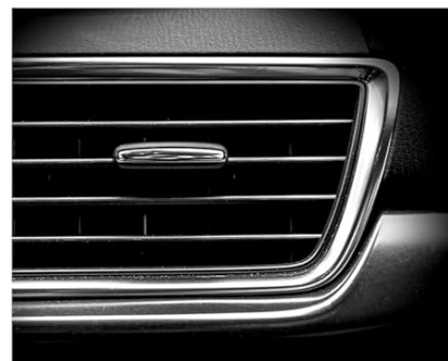
Figure 8: Automotive Applications