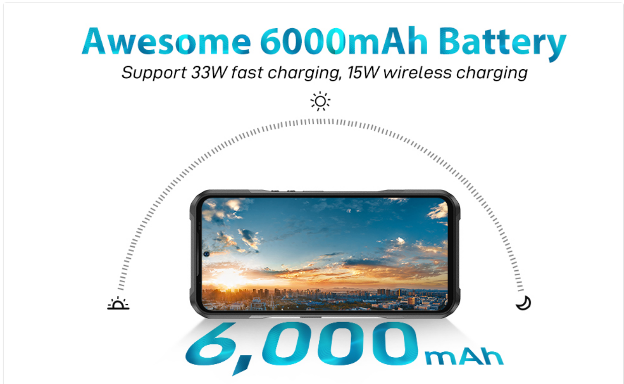
Image: The DOOGEE V20 highlighting its 6000mAh battery capacity.