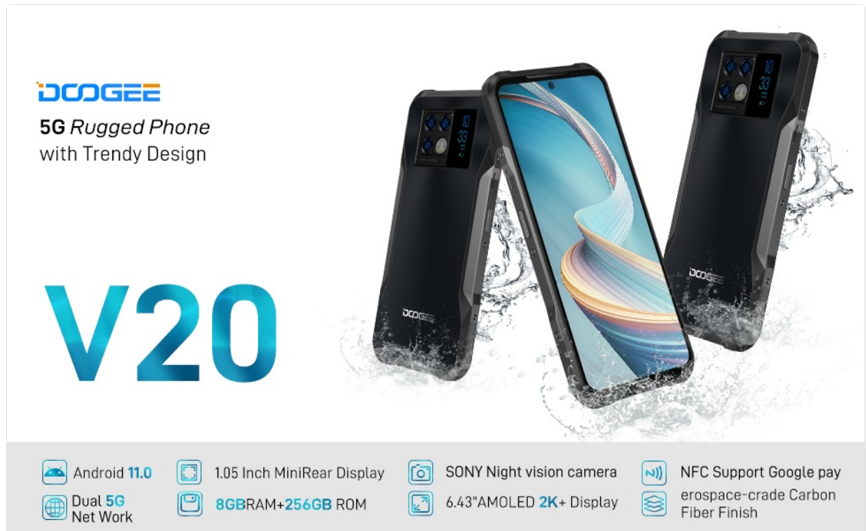
Image: DOOGEE V20 5G Rugged Smartphone highlighting key features.

The DOOGEE V20 is a robust 5G rugged smartphone designed for durability and high performance. It features a vibrant 6.43-inch AMOLED DotDisplay, a versatile triple camera system including a 64MP main lens and a 20MP night vision camera, and a long-lasting 6000mAh battery. Built to withstand harsh environments, it boasts IP68, IP69K, and MIL-STD-810G certifications for water, dust, and shock resistance. The device runs on Android 11 and includes advanced features like NFC and a unique rear mini display for quick access to information and controls.