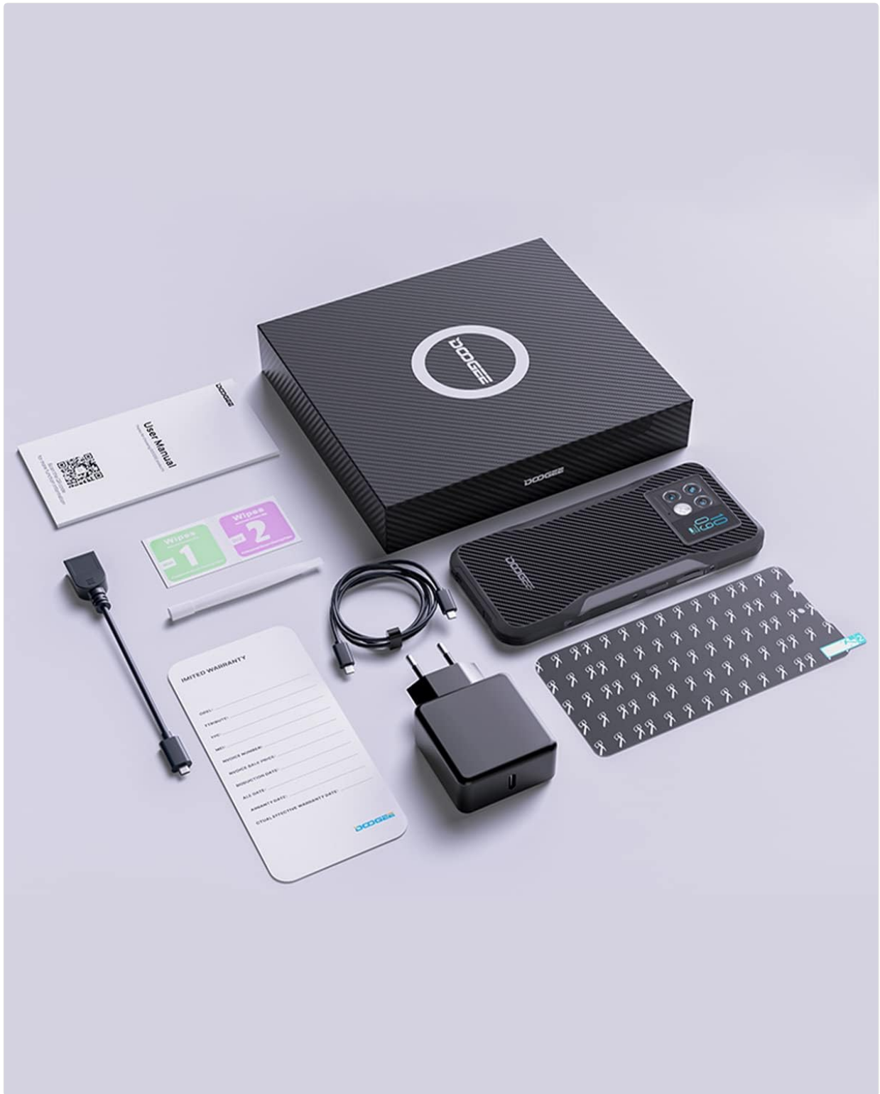
Image: All accessories included in the DOOGEE V20 retail box.

Video: An unboxing demonstration of the DOOGEE V20 smartphone and its included accessories.