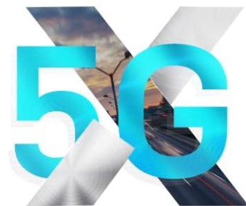
Dual 5G Network