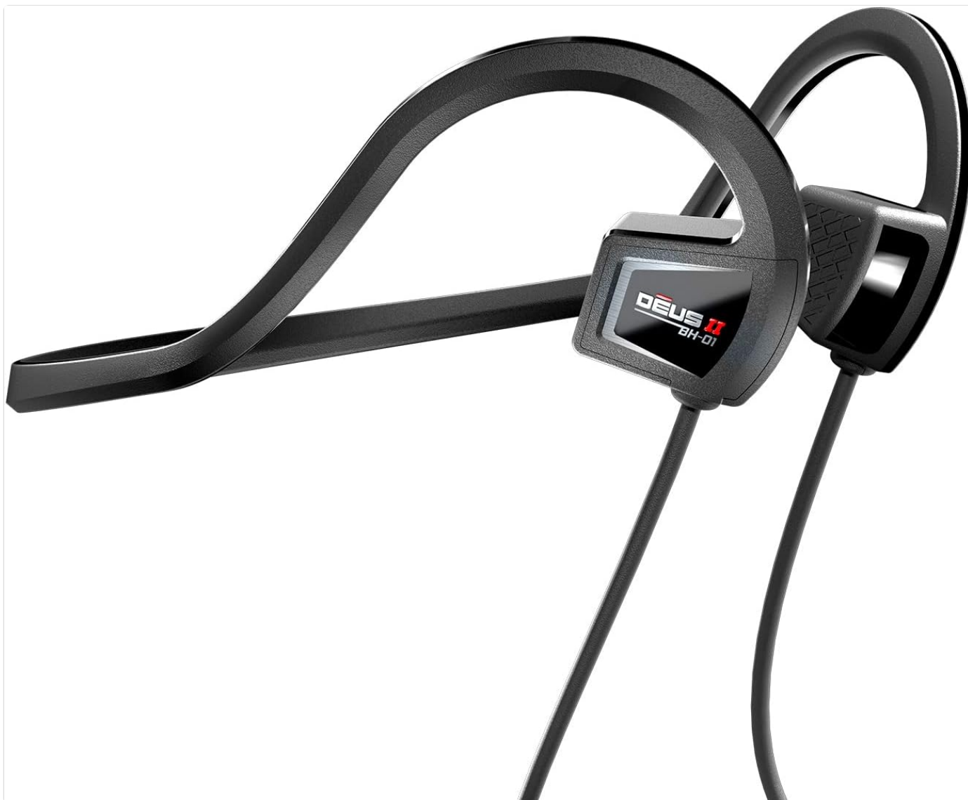
Figure 1: XP BH-01 Bone Conduction Wired Headphones. These headphones are designed to sit comfortably on the cheekbones, transmitting sound through bone vibrations.