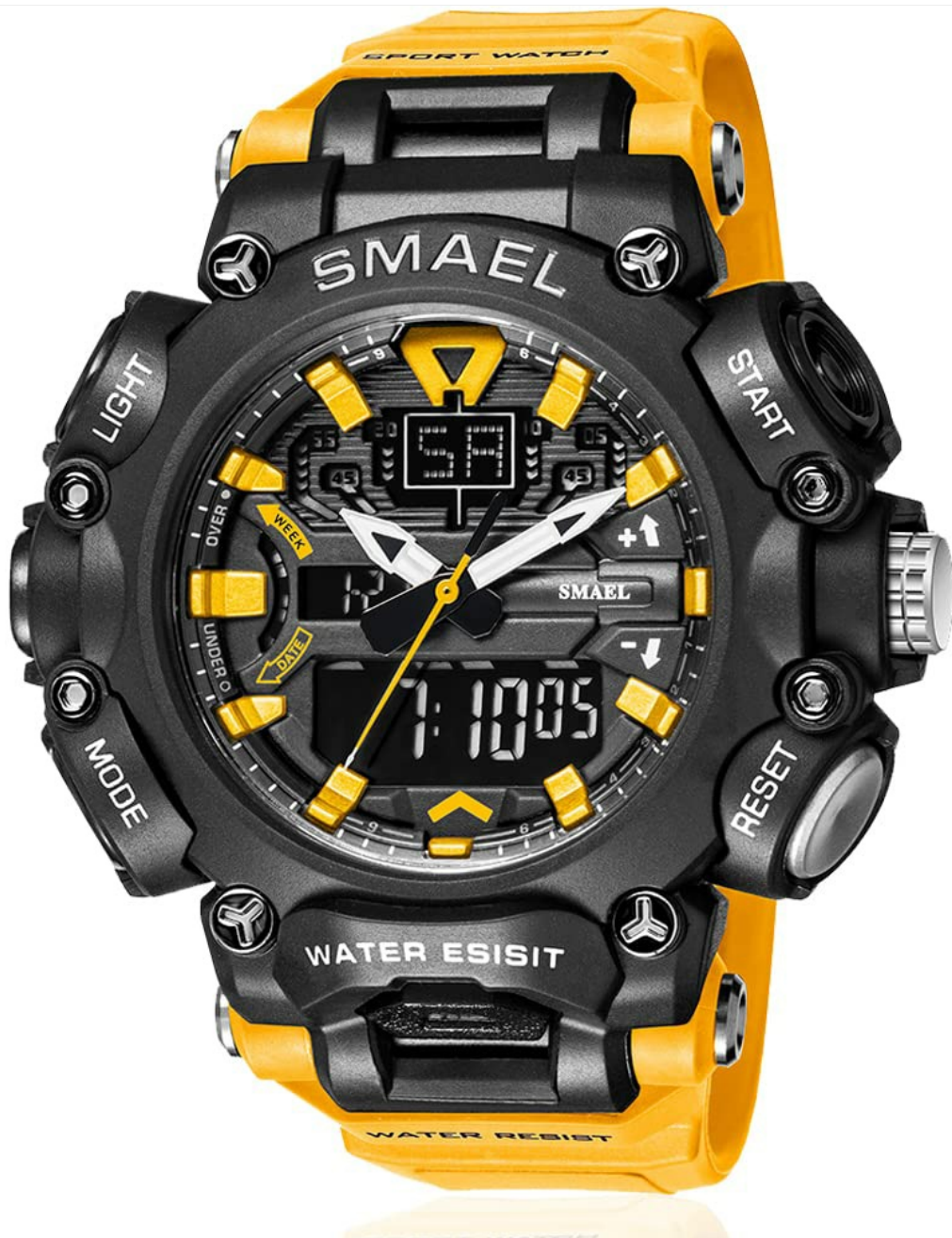
Image: Front view of the SMAEL Model 8053 watch, showcasing its yellow and black design with both analog hands and a digital display.