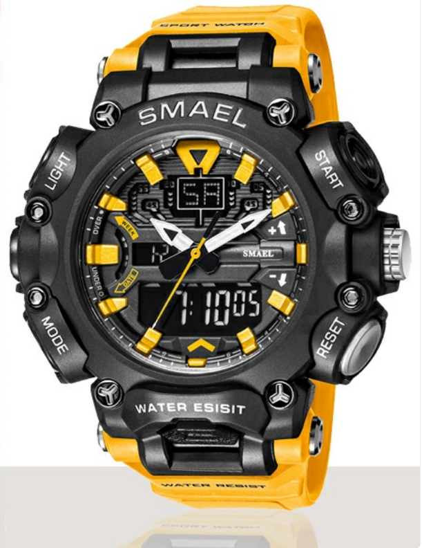
Image: Graphic highlighting key features of the SMAEL watch, including dual movement display, 50m waterproof, stopwatch, alarm, calendar, 12/24 hour, week display, and luminous indication.