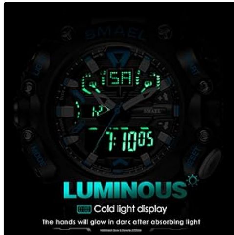
Image: The SMAEL watch digital display illuminated by its LED backlight, showing clear visibility in low light conditions.