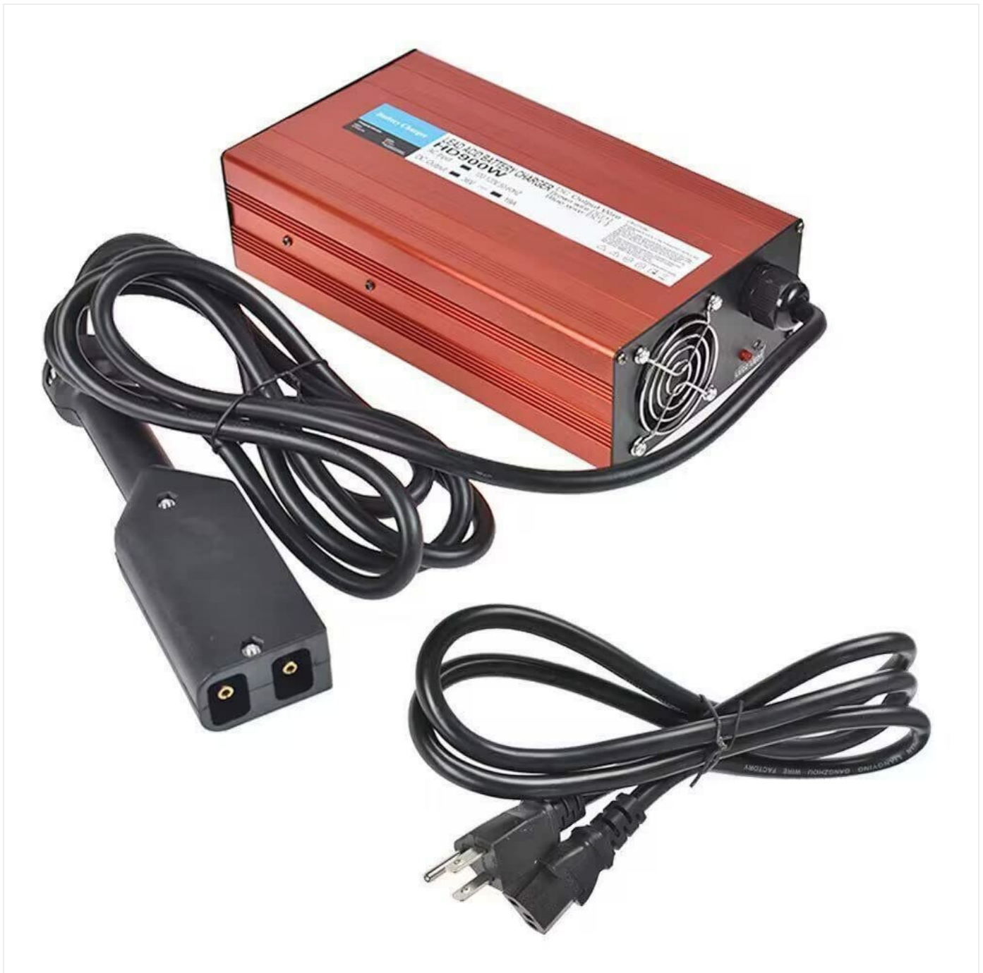
Image: The Kircuit 36V 18A AC Charger, showing its D-Plug connector.