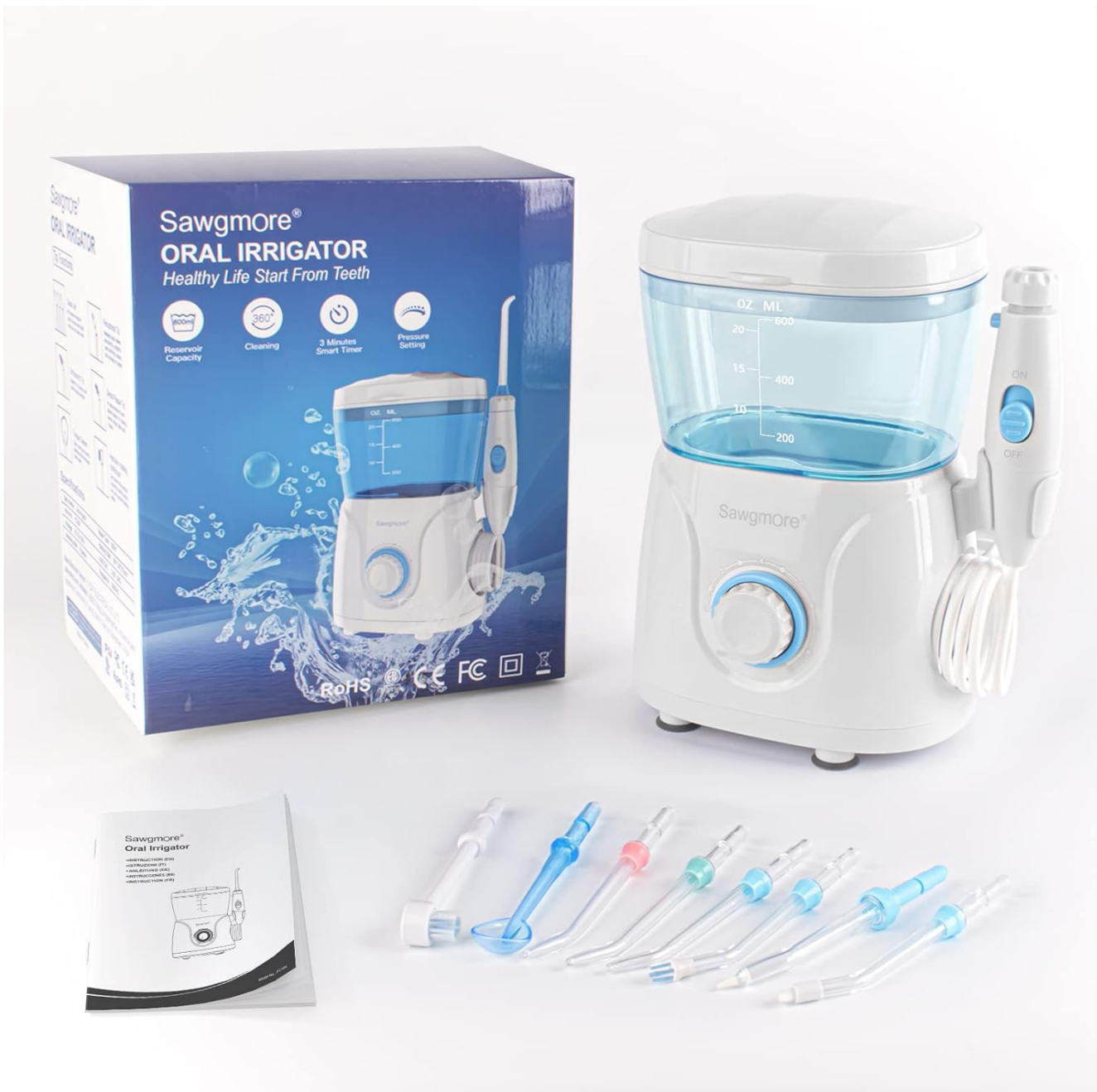
Figure 3.1: Contents of the Sawgmore Water Flosser package.