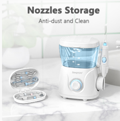
Figure 7.1: Nozzle storage box for anti-dust and clean keeping.