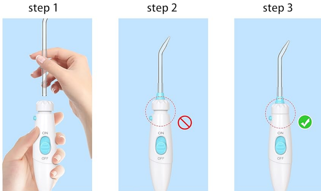
Figure 4.2: Correct nozzle tip insertion.