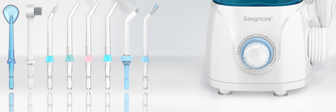
Figure 2.1: Sawgmore Water Flosser addressing common oral health concerns.

Care for Your Teeth, Care for Your Health