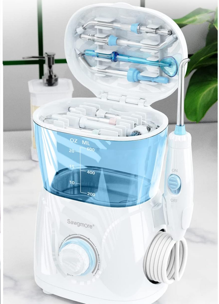
Figure 4.1: Filling the water reservoir.