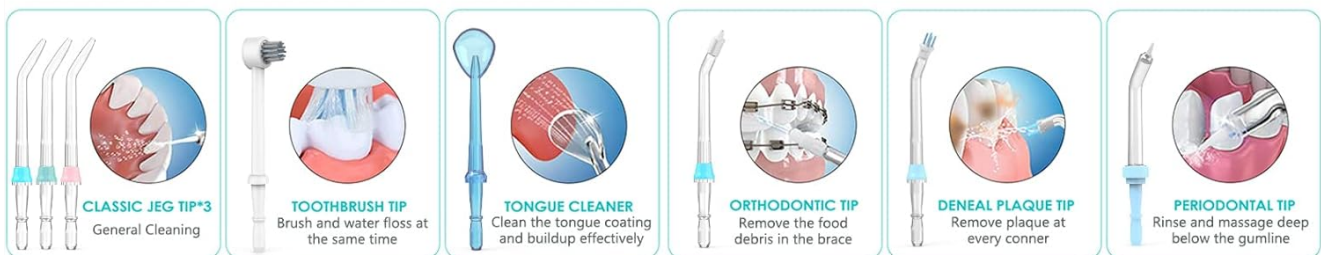
Figure 6.1: Overview of included nozzle tips.

Tips: It is recommended that standard nozzles and tongue cleaners should be replaced every six months. Other nozzles should be replaced every three months.