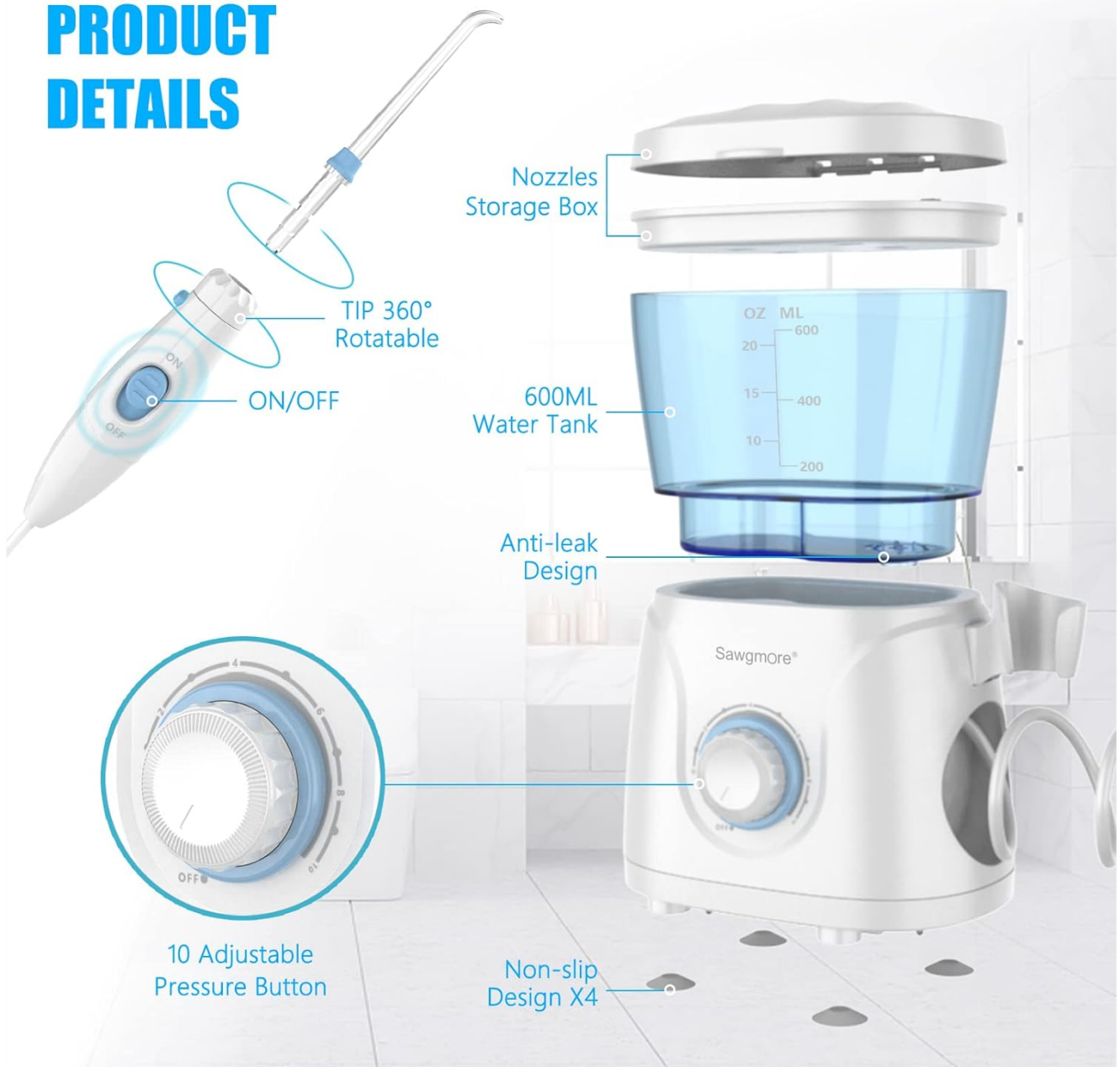
Figure 2.2: Product details and components.