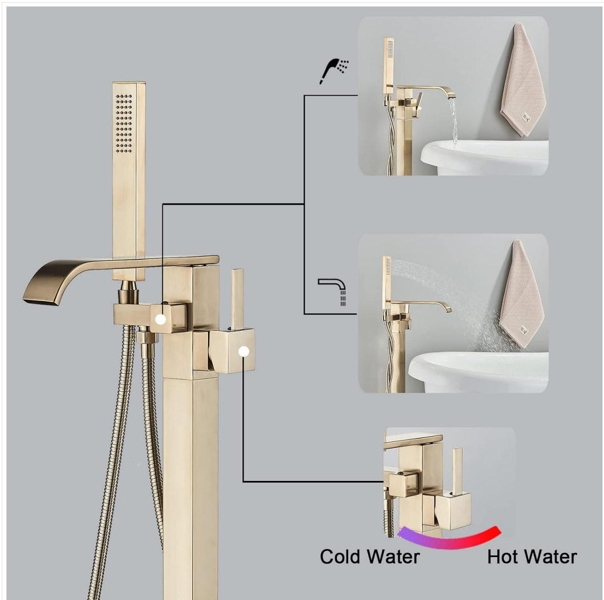
Image: Controls for hot/cold water and diverter function.