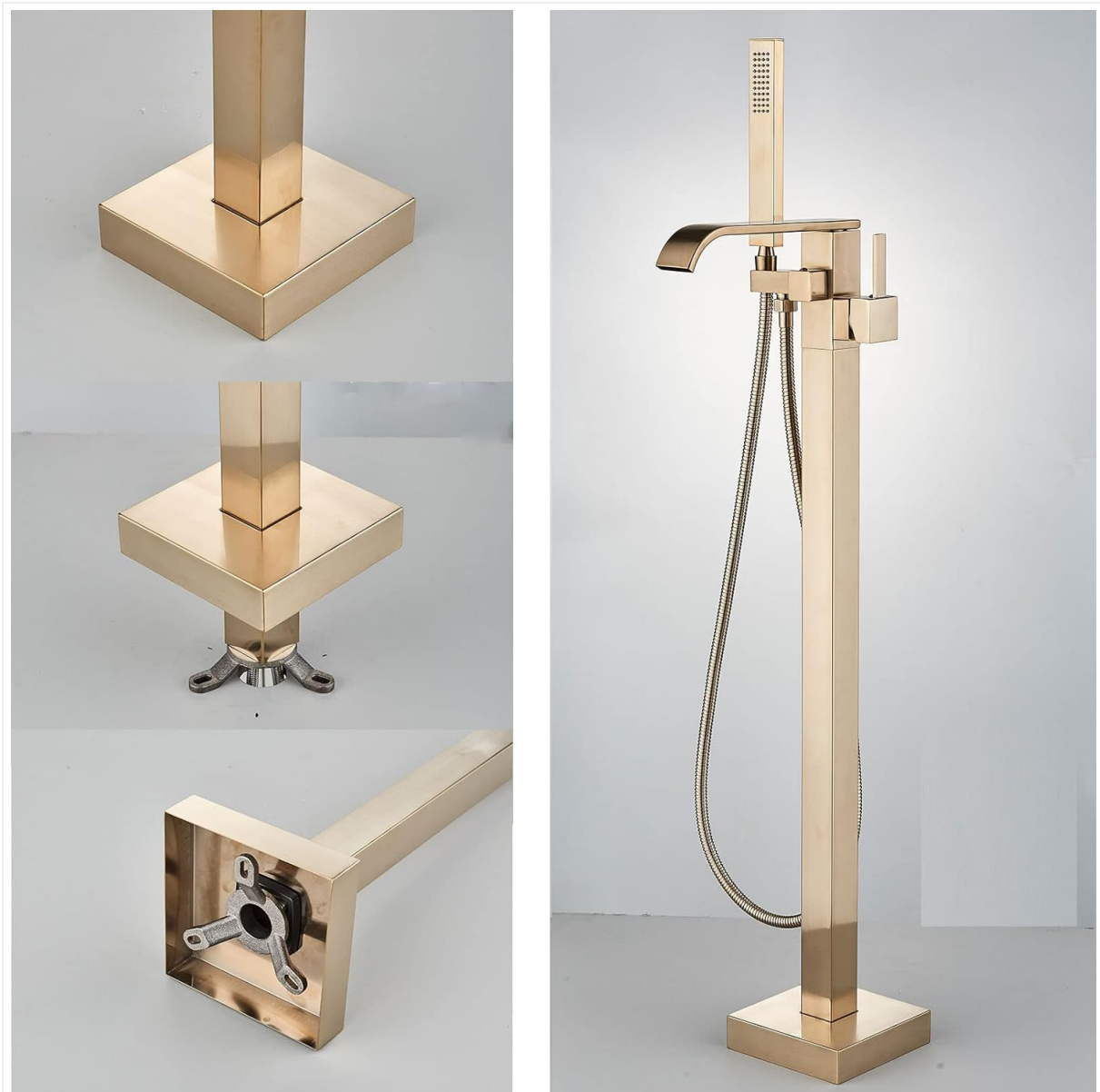
Image: Detailed view of the faucet base and mounting components.