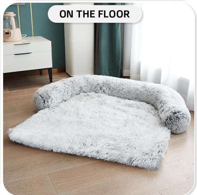
Figure 3: Versatile usage of the dog bed.