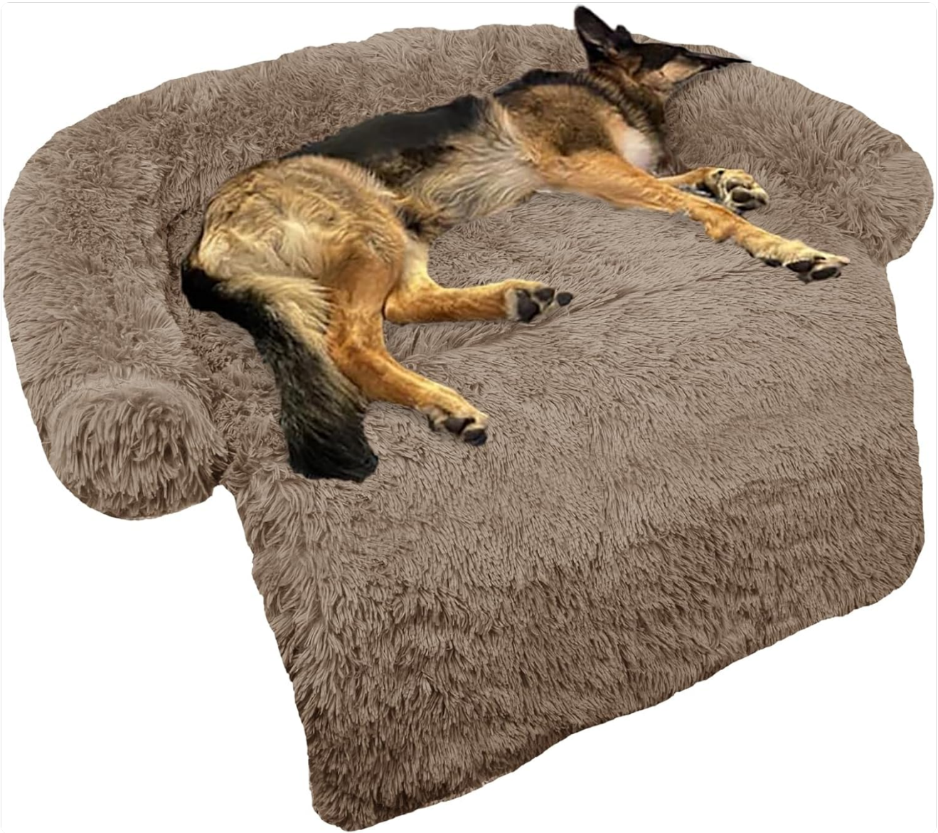
Figure 1: GGIB Calming Dog Bed with a dog resting on it.