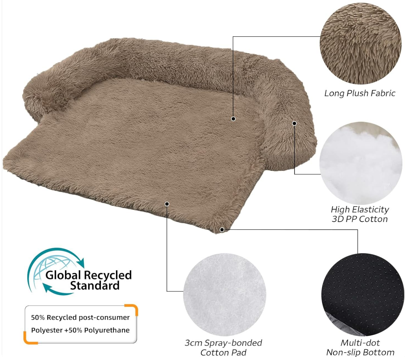
Figure 2: Internal components and material details.