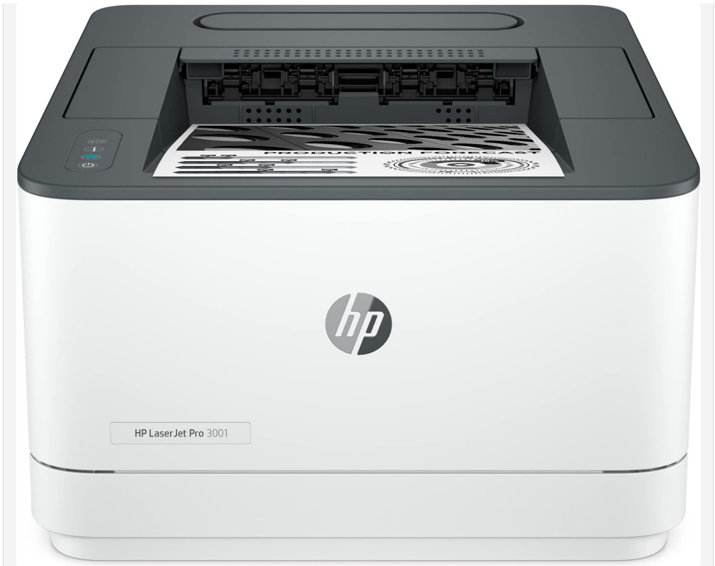
Figure 1.1: Front view of the HP LaserJet Pro 3001dw Wireless Black & White Printer.