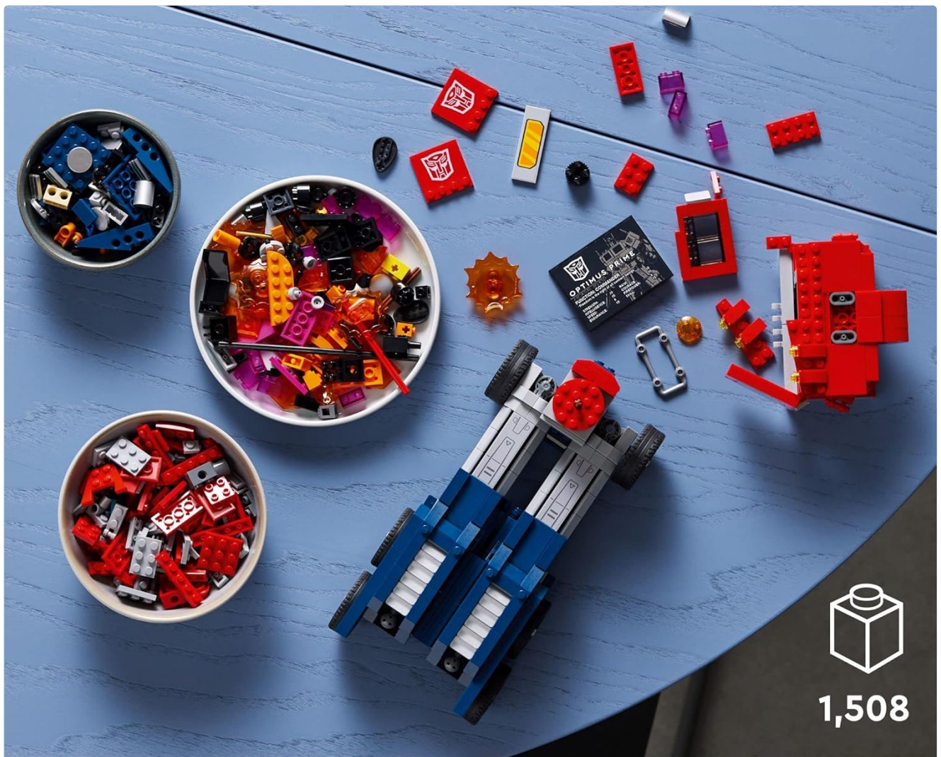
Image: An overhead view of sorted LEGO elements and the partially constructed Optimus Prime model, illustrating the building experience.