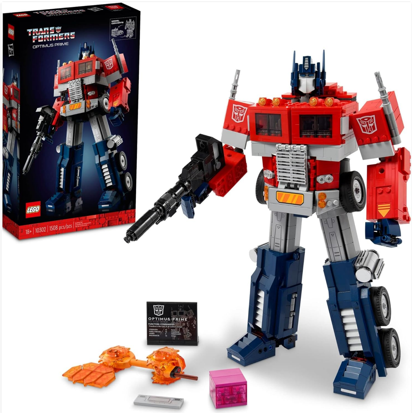
Image: The complete LEGO Optimus Prime model in robot form, alongside its truck mode, various accessories, and the product packaging.