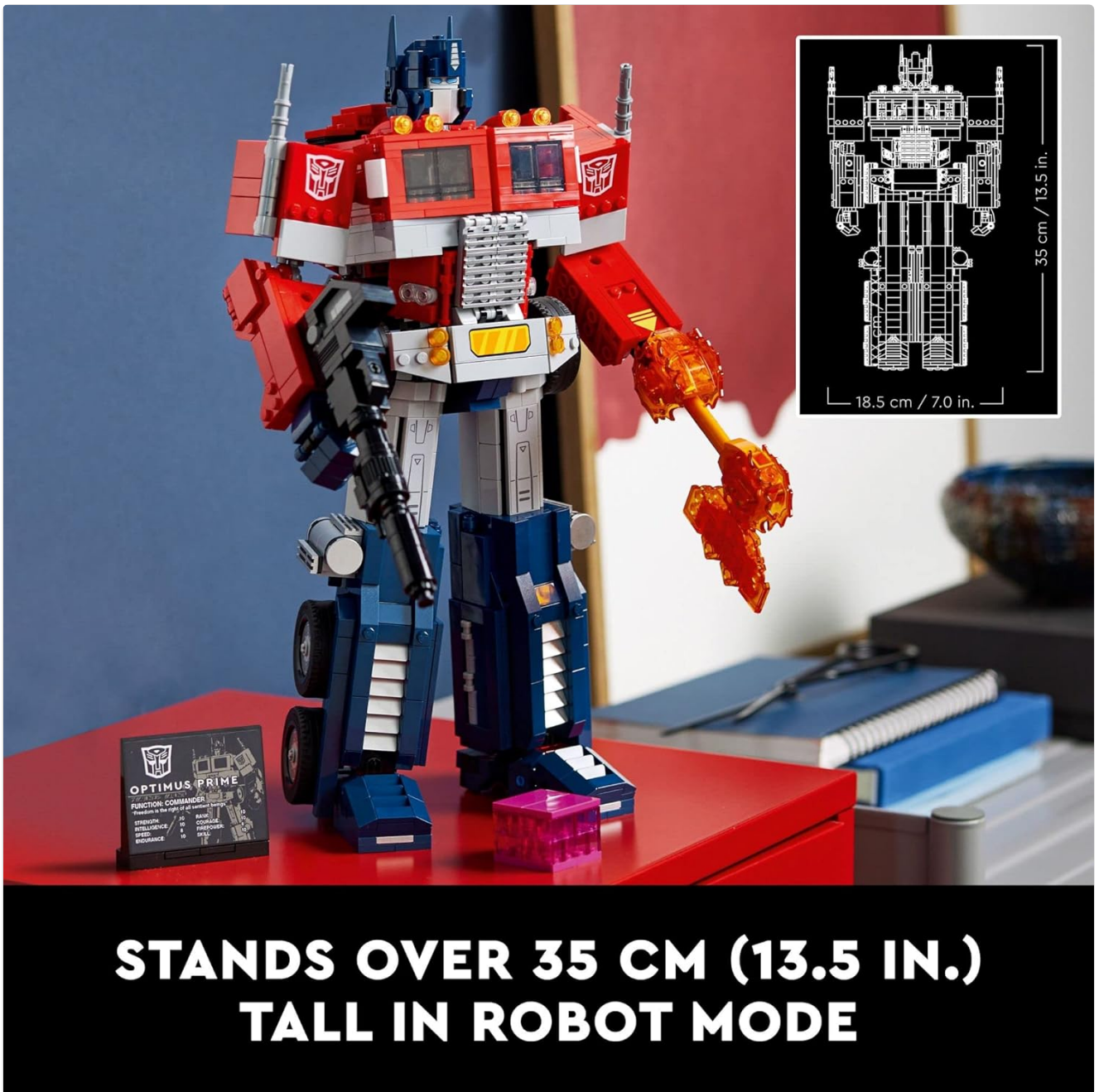
Image: Optimus Prime in robot mode, highlighting its impressive height of over 13.5 inches (35 cm).