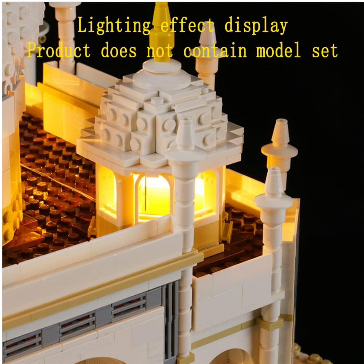
Illuminated dome and surrounding structures.