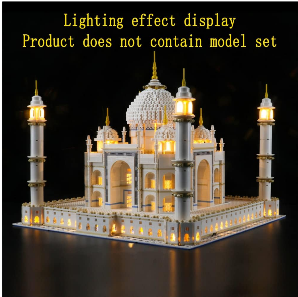
Overall illuminated Taj Mahal model.