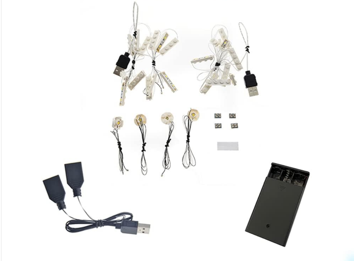
This image displays the components included in the lighting kit.

Please note: This product only contains the following items and installation instruction, not LEGO set!