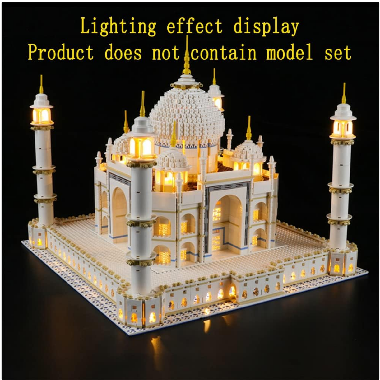
Alternate view of the illuminated model.

Lighting effect display Product does not contain model set