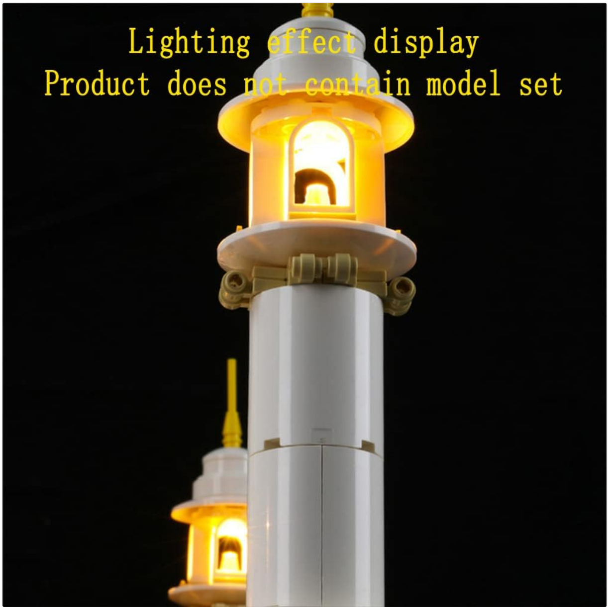
Close-up of an illuminated tower.

Lighting effect display Product does not contain model set