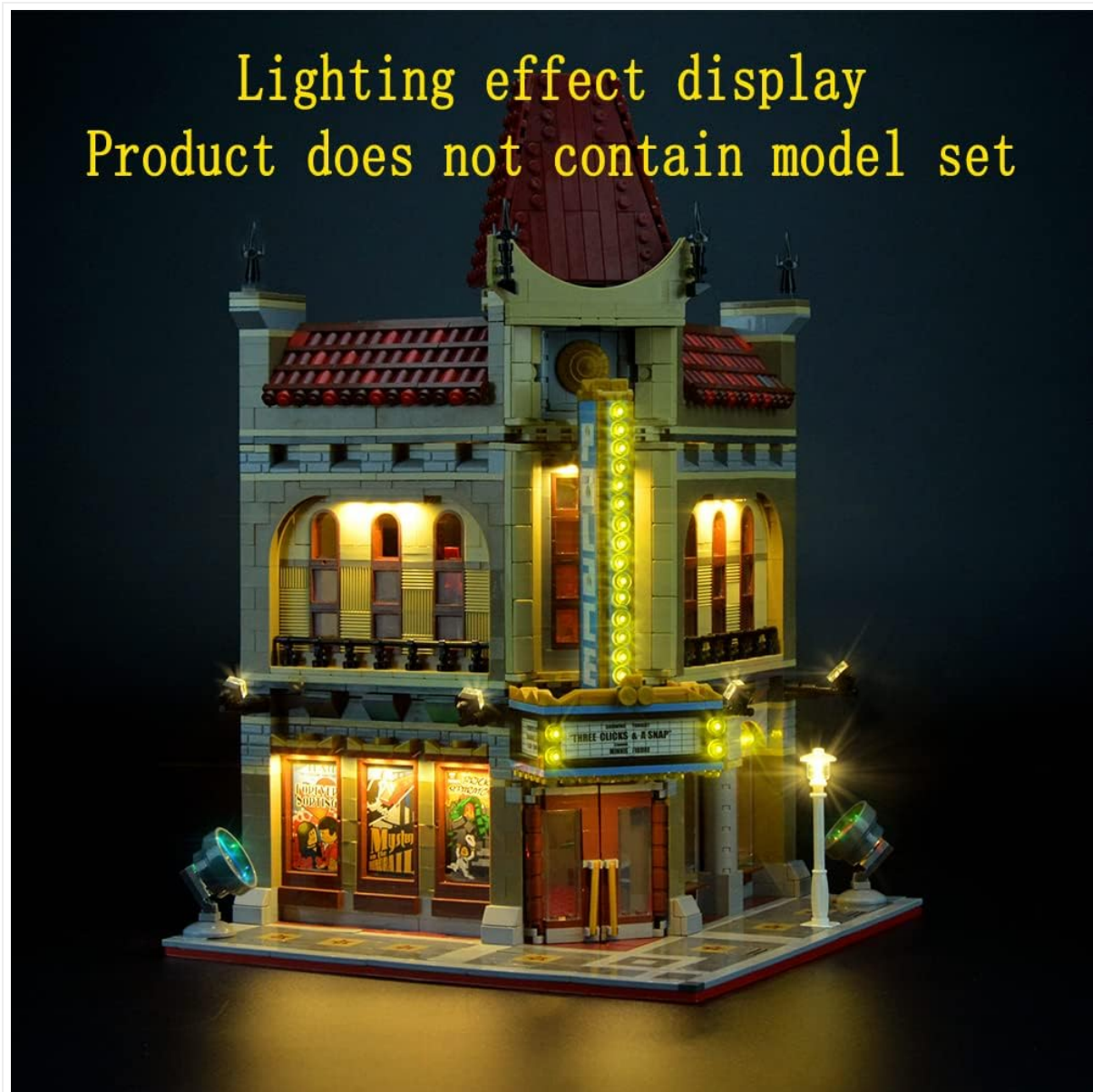
Image: The LEGO Palace Cinema model with the GEAMENT LED light kit fully installed and illuminated.

Observe the various lighting effects, including the illuminated interior, exterior details, and the iconic 'Palace' sign. The lights are intended to provide a dynamic and visually appealing display for your model.