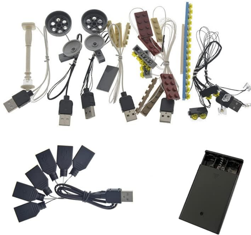
Image: Components included in the GEAMENT LED light kit.

Please note: This product only contains the following items and installation instruction, not LEGO set!