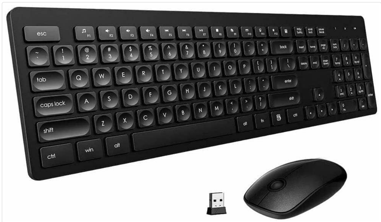
Image: The included black wireless keyboard and mouse, along with their compact USB receiver, ready for connection to the desktop.