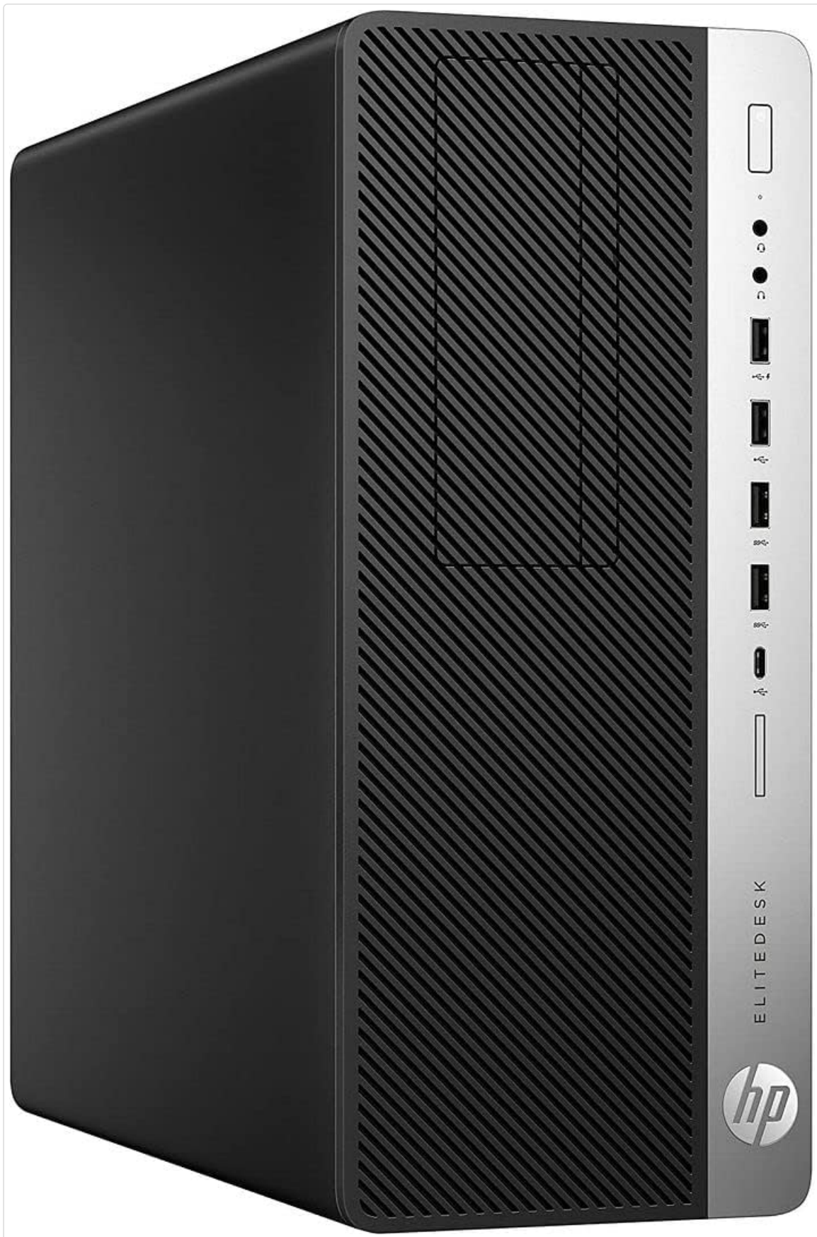
Image: Angled front view of the HP EliteDesk 800 G3 Tower desktop computer, showcasing its sleek black and silver design.