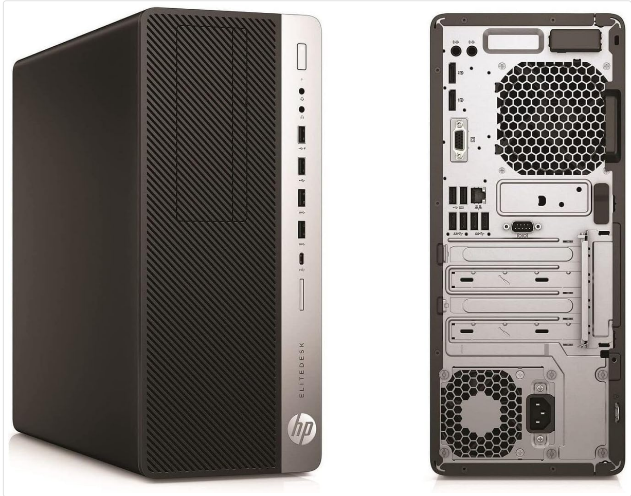
Image: Dual view of the HP EliteDesk 800 G3 Tower, displaying both the front panel with its ports and the rear panel with its extensive connectivity options, including DisplayPorts, USB ports, Ethernet, and power input.