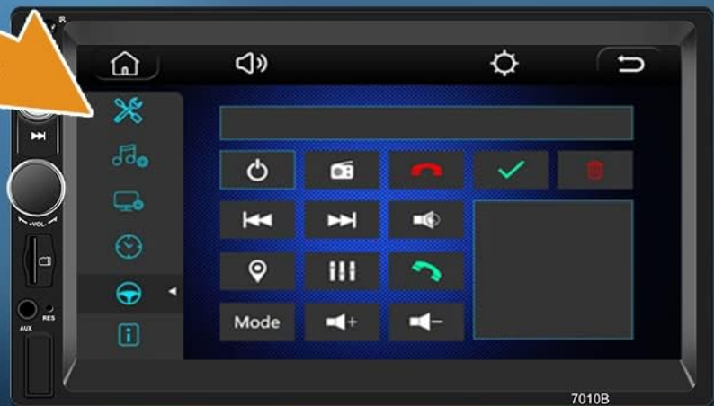
Image: The car radio display showing a clear view from a backup camera with parking guidelines, and a separate diagram illustrating the Steering Wheel Control (SWC) function.