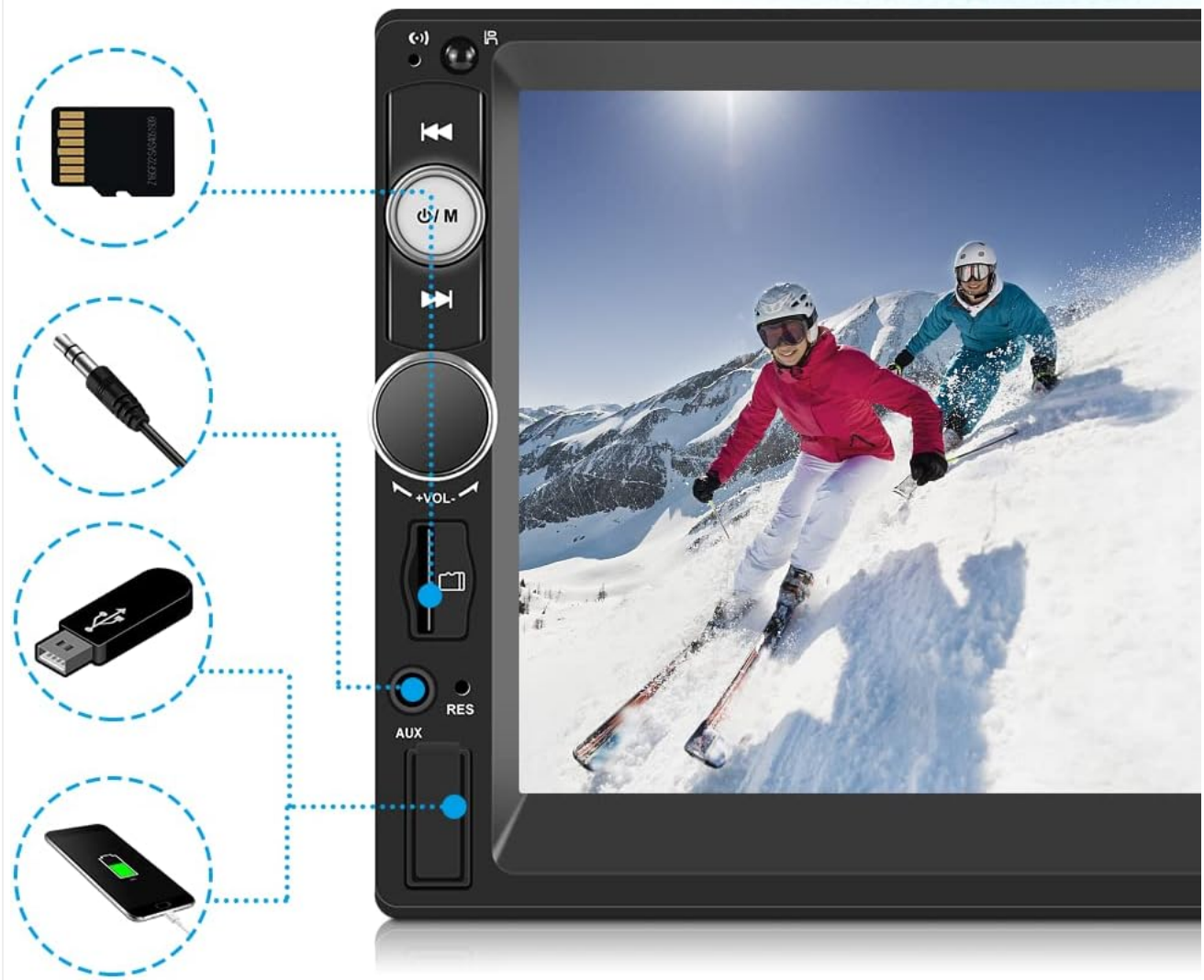
Image: A close-up of the car radio's side panel showing inputs for TF card, AUX, and USB, indicating support for various play modes.

Supports unlimited capacity USB stick / TF card / audio and video input (AUX IN) / audio output (subwoofer) / video output (screen sync).