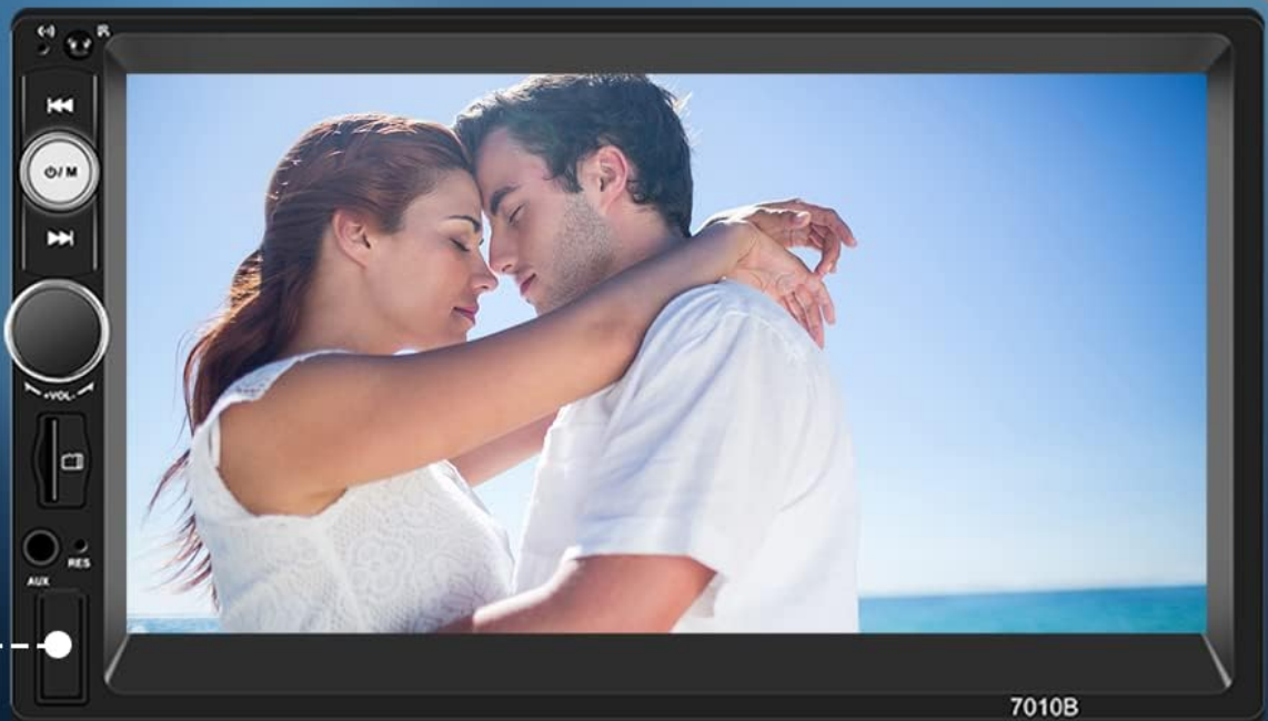
Image: The car radio display showing a smartphone screen mirrored onto it, demonstrating the wireless Mirror Link function.