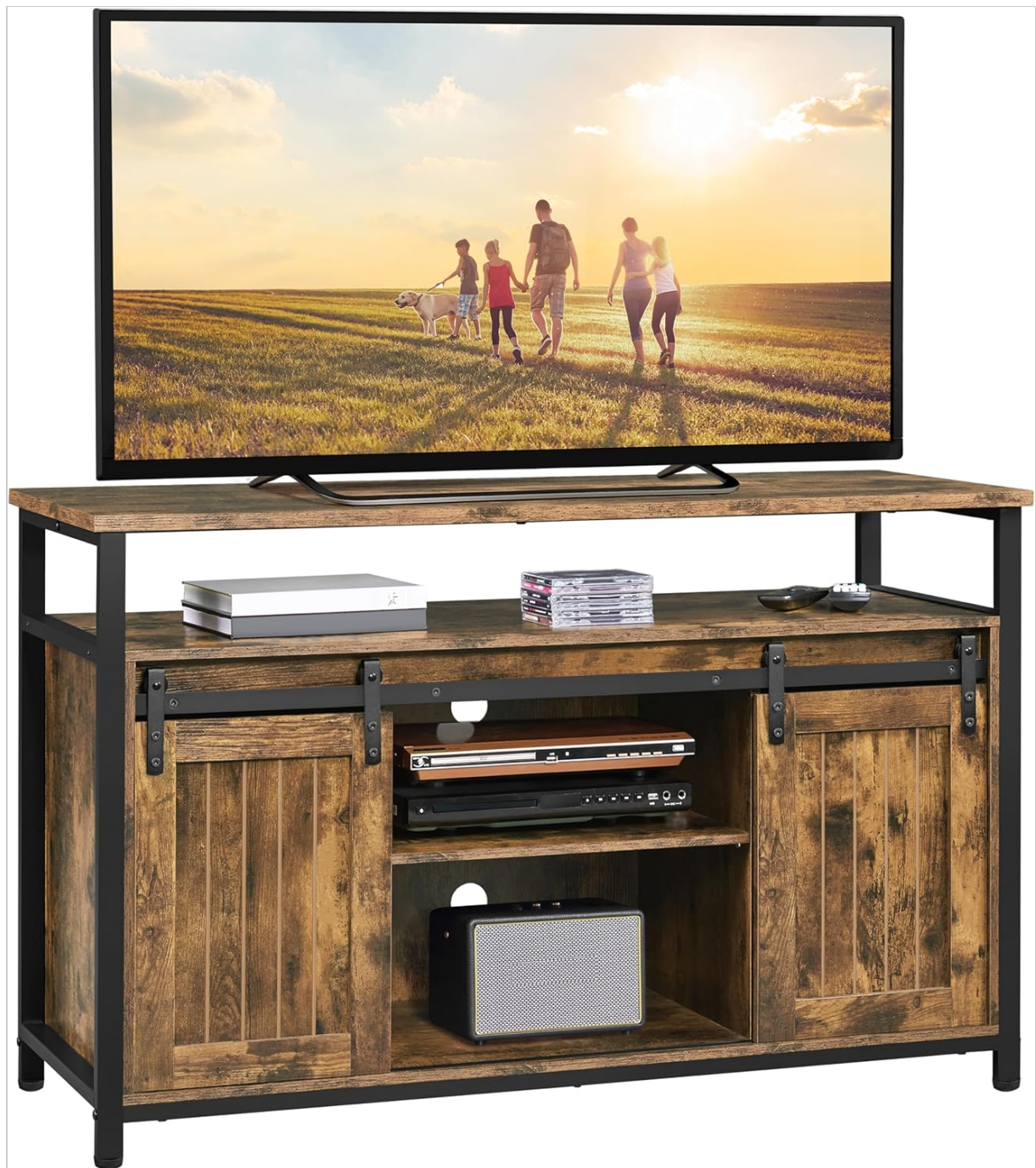
Image: Fully assembled Yaheetech Farmhouse TV Stand, showcasing its rustic brown finish and black metal accents. A television is placed on the top surface, and media components are visible in the central open shelves.