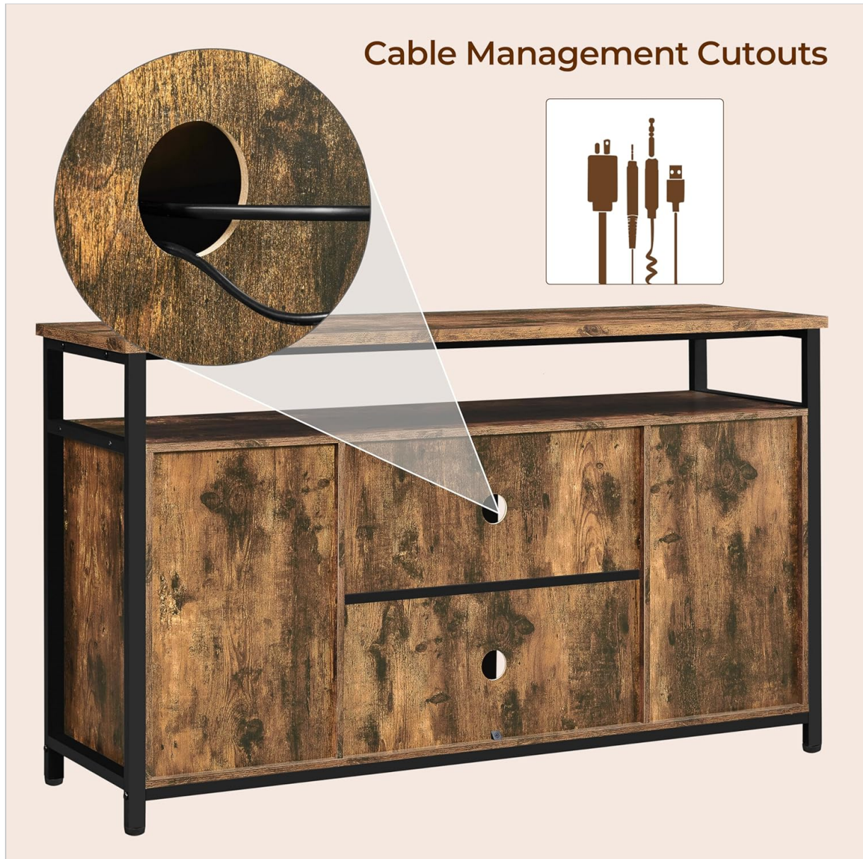
Image: A close-up view of the cable management cutouts on the back panel of the TV stand. A cable is shown passing through one of the circular openings, illustrating its function for organizing wires.