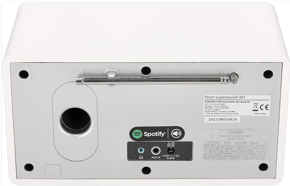
Figure 2.5: The rear panel of the Pinell Supersound 301, highlighting the AUX IN and headphone output ports.