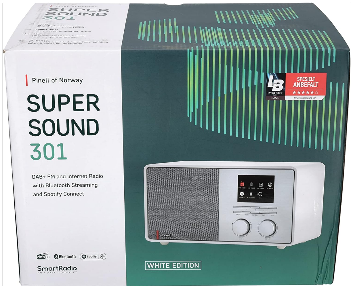
Figure 1.1: The Pinell Supersound 301 product packaging, showing the radio and its branding.