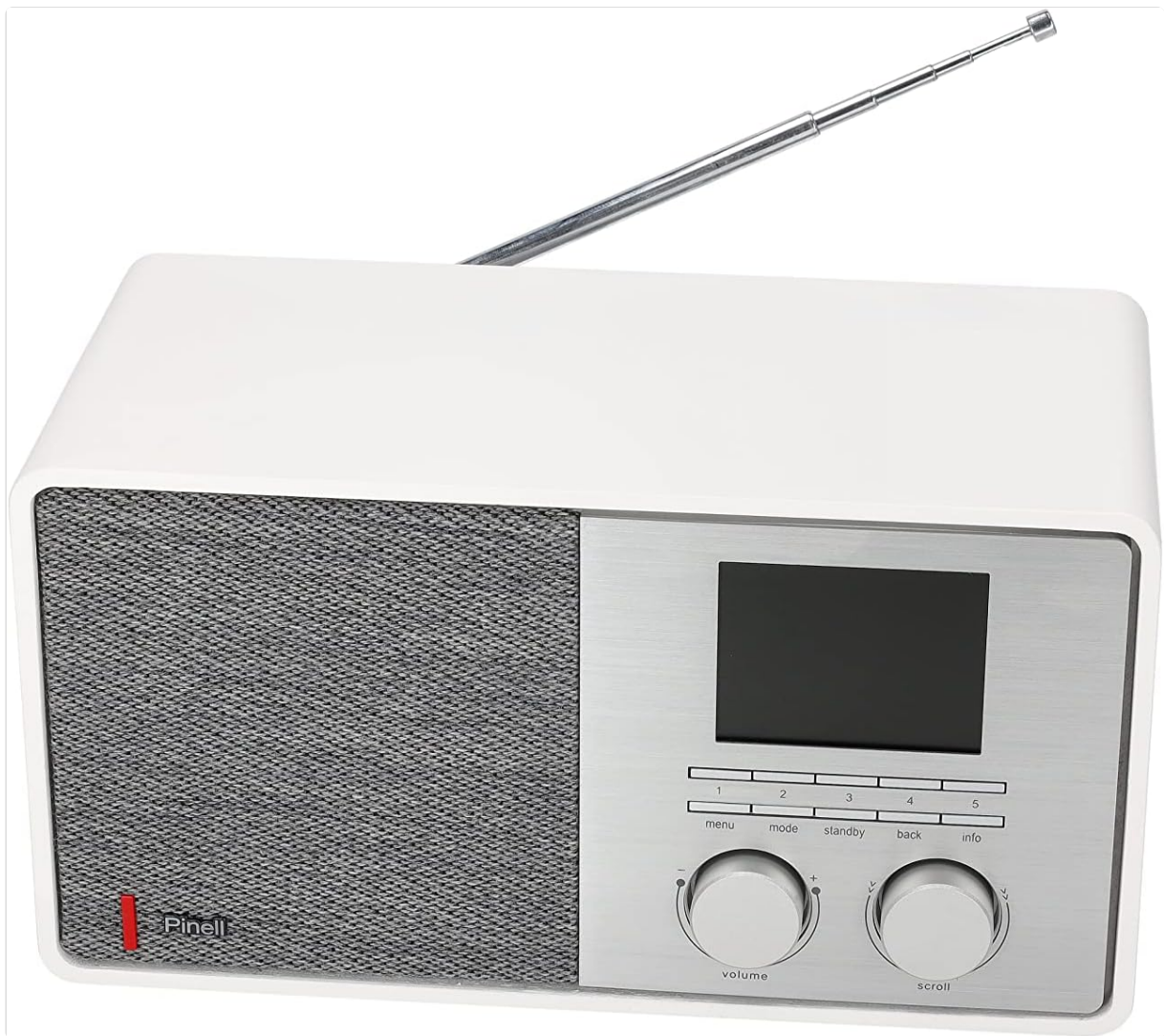
Figure 1.2: The Pinell Supersound 301 with its telescopic antenna fully extended for improved radio reception.