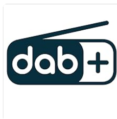
Figure 2.3: The DAB+ logo, representing Digital Audio Broadcasting Plus technology.

Enjoy digital and analog terrestrial radio broadcasts.