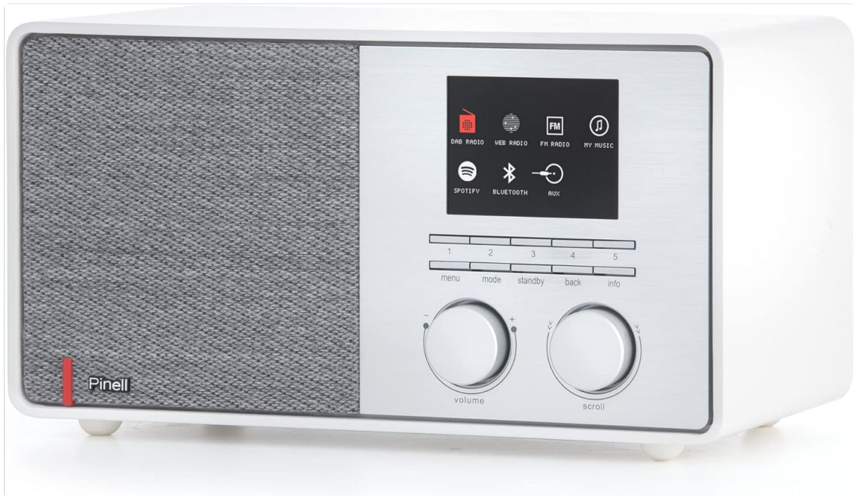
Figure 2.1: Front panel of the Pinell Supersound 301, showing the display, control knobs, and buttons.

The Pinell Supersound 301 features intuitive controls on its front panel and a remote control for convenient operation.