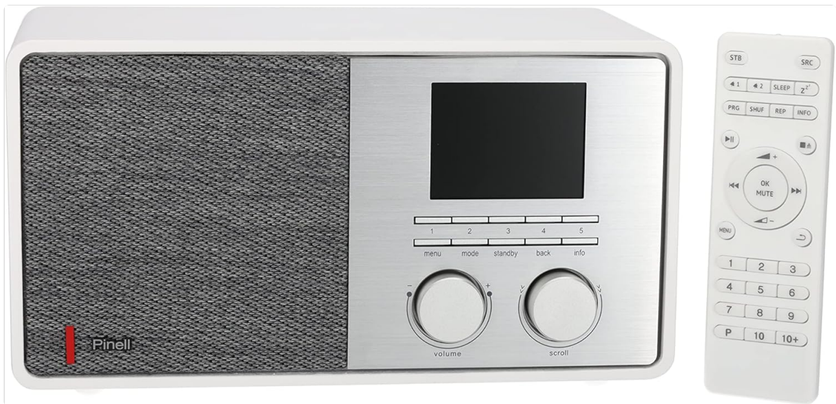
Figure 2.2: The Pinell Supersound 301 radio shown alongside its dedicated remote control.

Refer to the remote control layout for specific button functions, which mirror most of the front panel controls and add numerical input for presets and direct access.