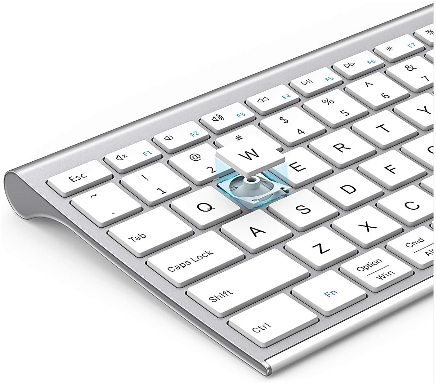
Image: An exploded view of a keycap, illustrating the underlying scissor mechanism for stable and precise typing.