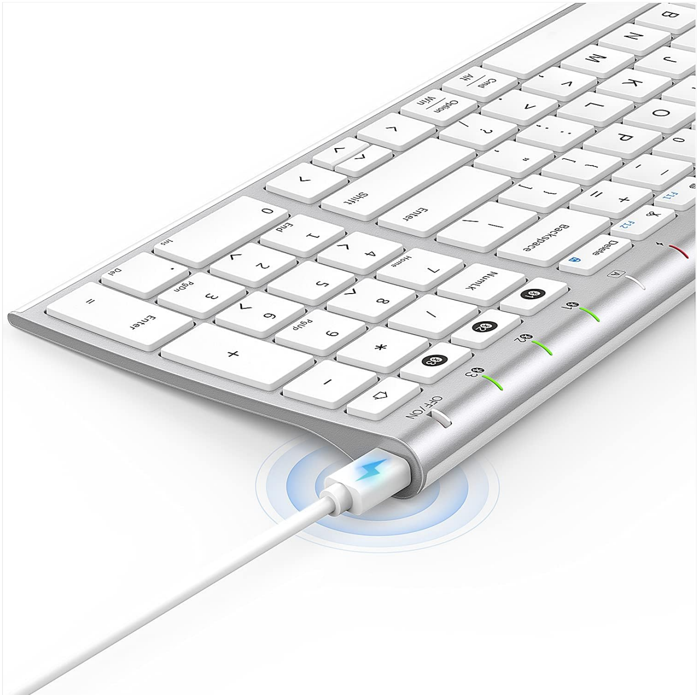
Image: The included USB charging cable, used to recharge the keyboard's built-in battery.