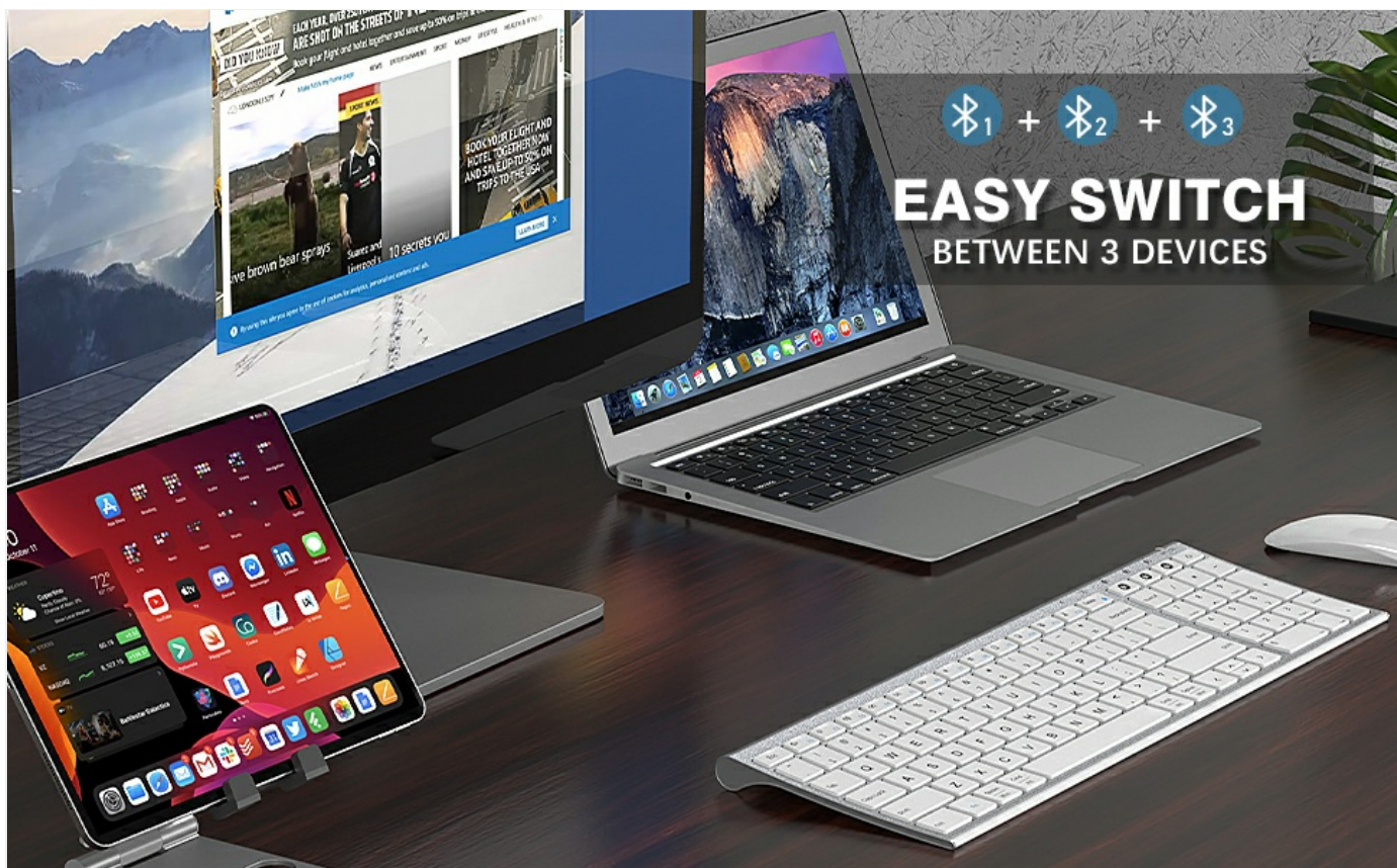
Image: An illustration demonstrating the keyboard's ability to easily switch between a laptop, tablet, and smartphone.

Your browser does not support the video tag.