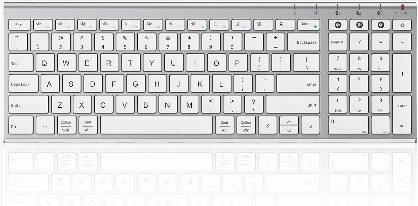
Image: The Nasuque Bluetooth Keyboard in silver, showcasing its full layout and slim profile.

Thank you for choosing the Nasuque Bluetooth Keyboard. This wireless, rechargeable, and ultra-slim keyboard is designed for seamless compatibility with Mac OS and iOS devices, including MacBook Pro/Air, iMac, iPhone, and iPad Pro/Air/Mini. Featuring a full-size layout with a numeric keypad and a stable scissor mechanism beneath each key, it offers a comfortable and precise typing experience. Its multi-device capability allows you to connect and switch between up to three devices effortlessly.