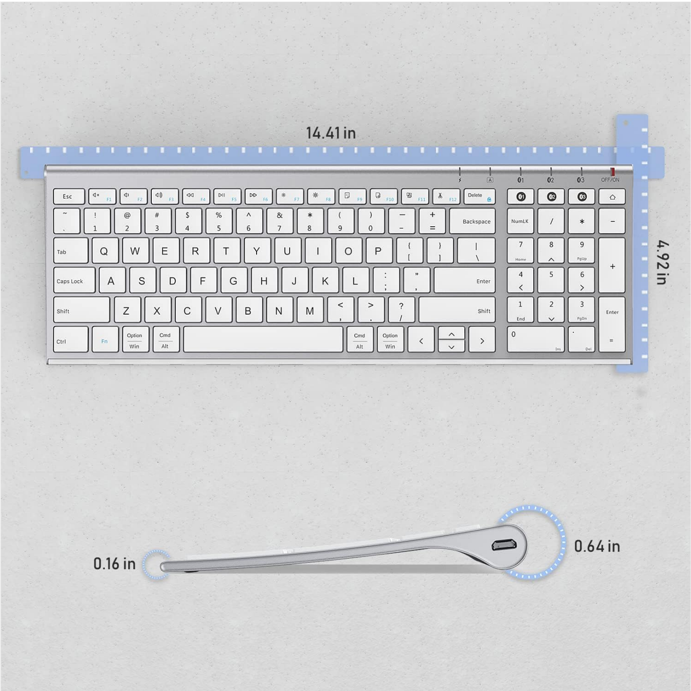
Image: Diagram illustrating the precise dimensions of the Nasuque Bluetooth Keyboard.

For warranty information, technical support, or any inquiries regarding your Nasuque Bluetooth Keyboard, please contact the manufacturer directly through the retailer's platform or the contact information provided with your purchase. Please retain your proof of purchase for warranty claims.