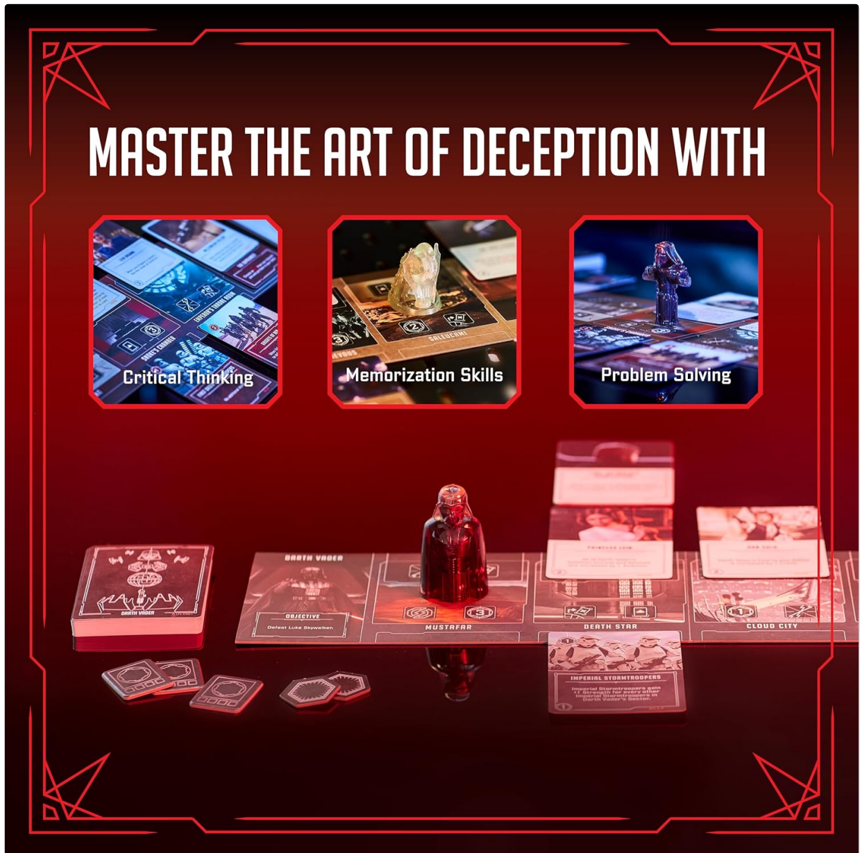
Image: A section of the game board highlighting key strategic elements: Critical Thinking, Memorization Skills, and Problem Solving, emphasizing the intellectual engagement required for gameplay.

Success in Star Wars Villainous requires a blend of critical thinking, memorization, and problem-solving skills. Players must manage their hand of cards, strategically move their villain, and anticipate opponents' moves while working towards their own unique objective. The Fate Deck introduces elements of chance and interaction, allowing players to hinder their rivals.