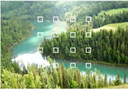
② multi point metering