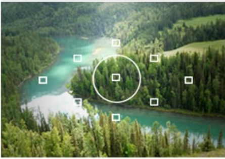
① central metering