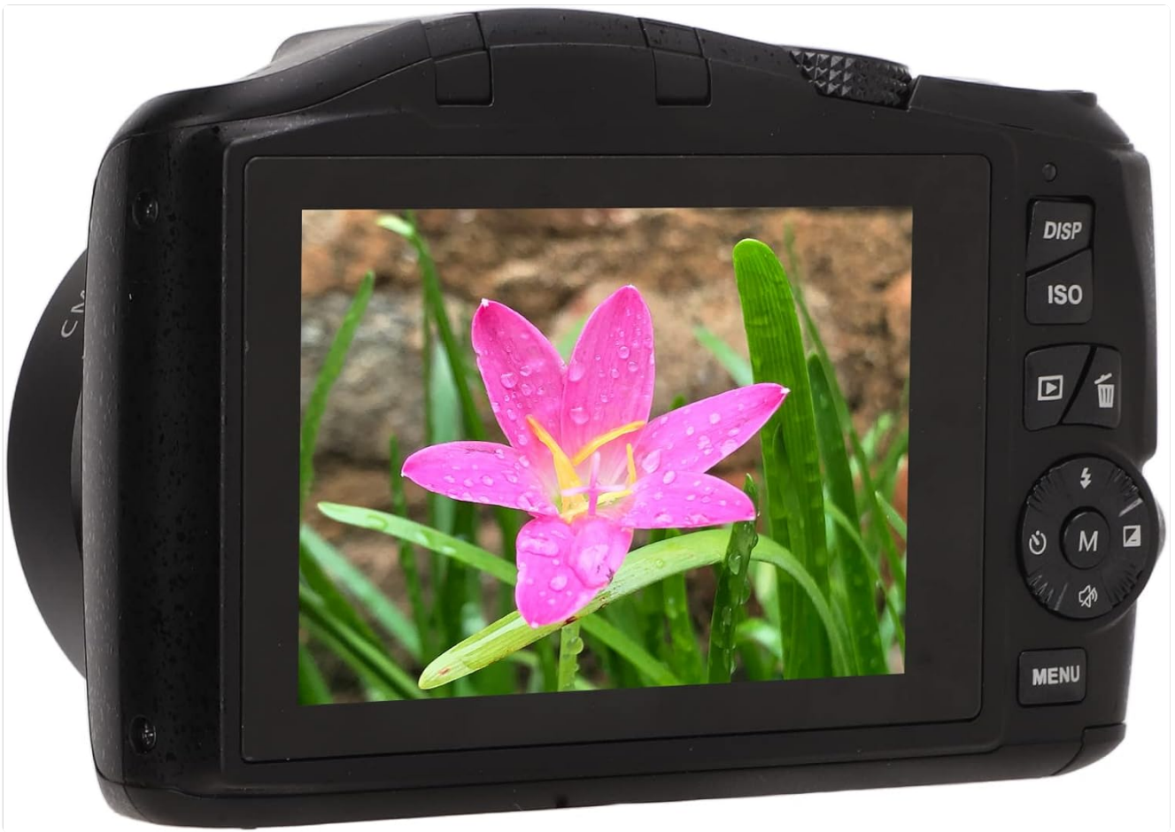
The camera's display showing a captured image of a pink flower, demonstrating image playback.