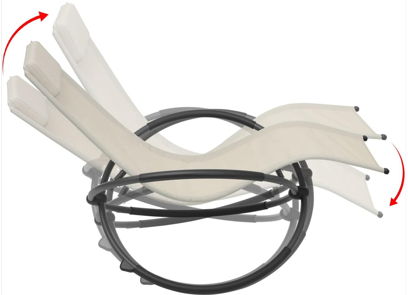
Image: The ergonomic design allows for a gentle rocking motion.