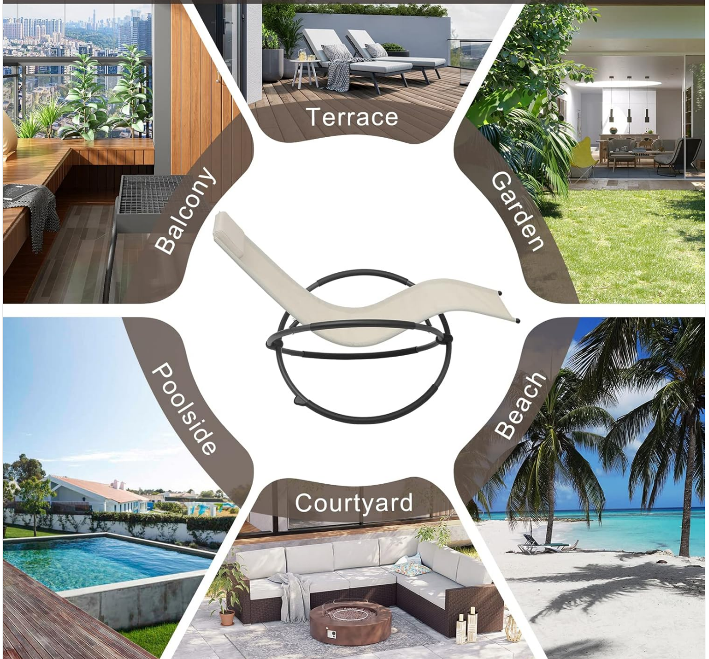
Image: The sun lounger is suitable for many outdoor scenarios.