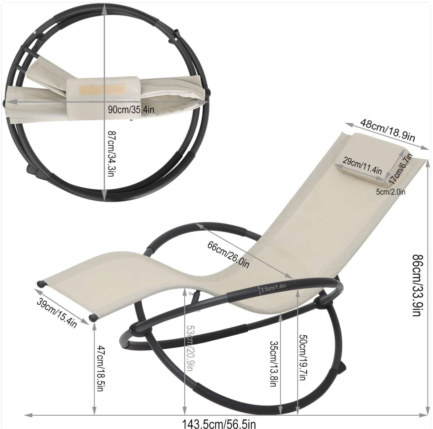
Image: Dimensions of the sun lounger, unfolded and folded.