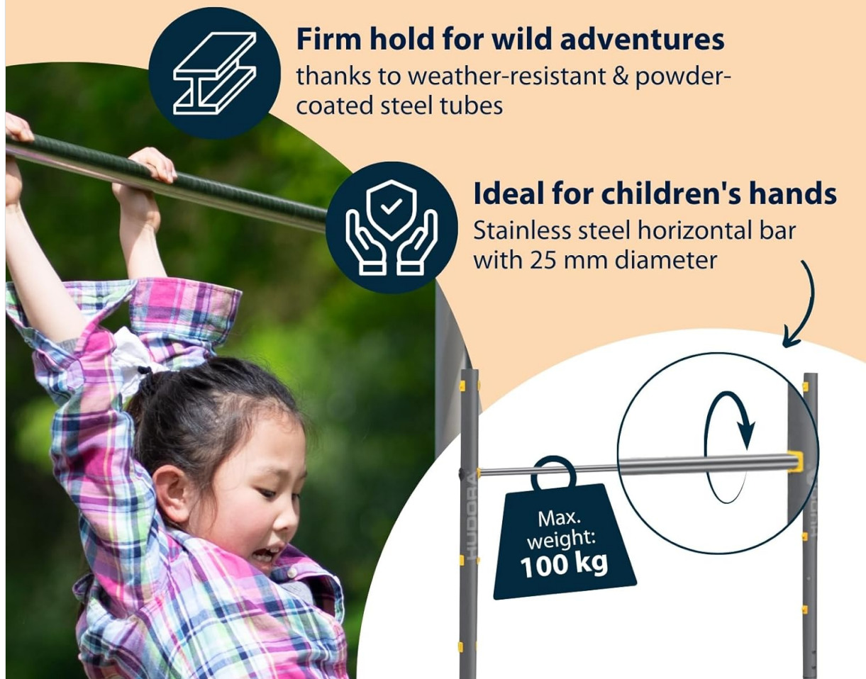
Figure 2.3: Key safety features, including weather-resistant powder-coated steel tubes for a firm hold and a 25 mm diameter stainless steel horizontal bar, designed to support a maximum weight of 100 kg.