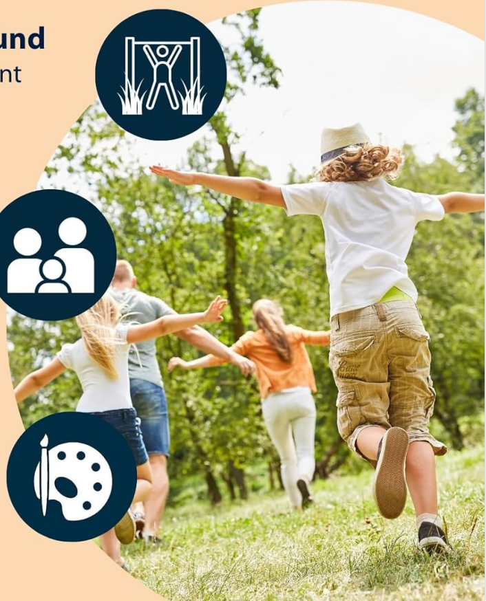
Figure 4.1: The gymnastics bar provides a personal playground, promoting physical development and fun for the entire family, suitable for children from 3 years and adults up to 100 kg.