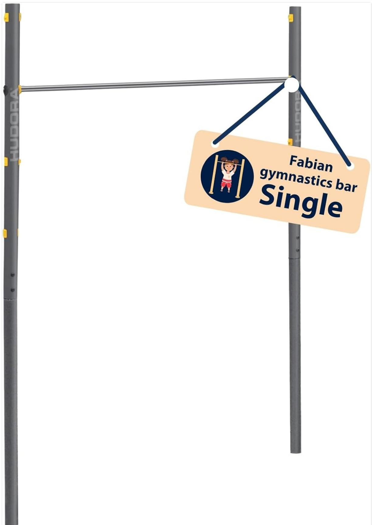
Figure 2.1: The HUDORA 64003 Single Gymnastics Bar, showcasing its simple grey design and sturdy construction.