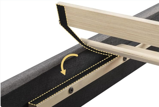
Image: Details highlighting the premium linen fabric, sturdy construction, and the Velcro slat system for easy assembly.