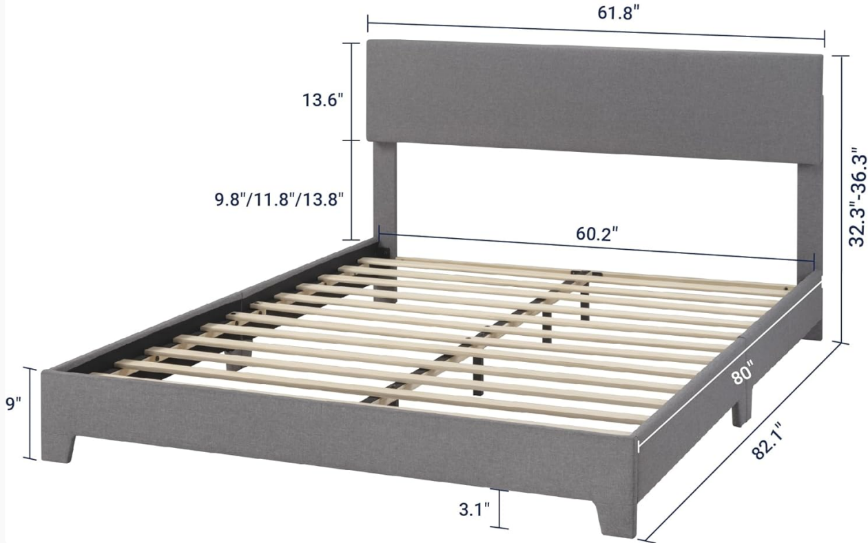
Image: Detailed dimensions of the Queen bed frame.

Weight Capacity: 800 lbs. Recommend Mattress Thickness: 8-14 in.