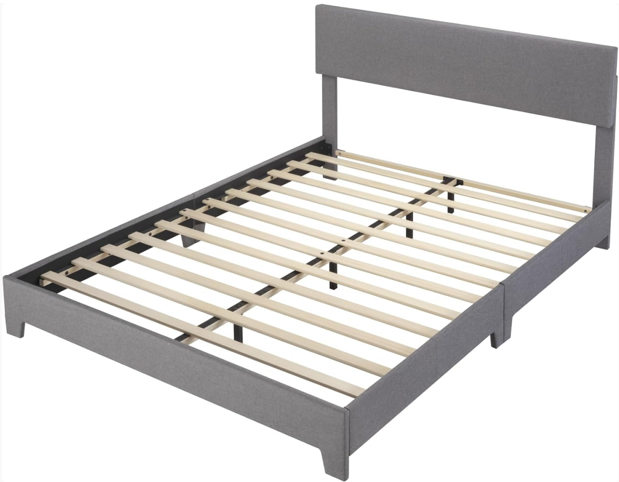
Image: The bed frame structure with wooden slats, designed for mattress support without a box spring.