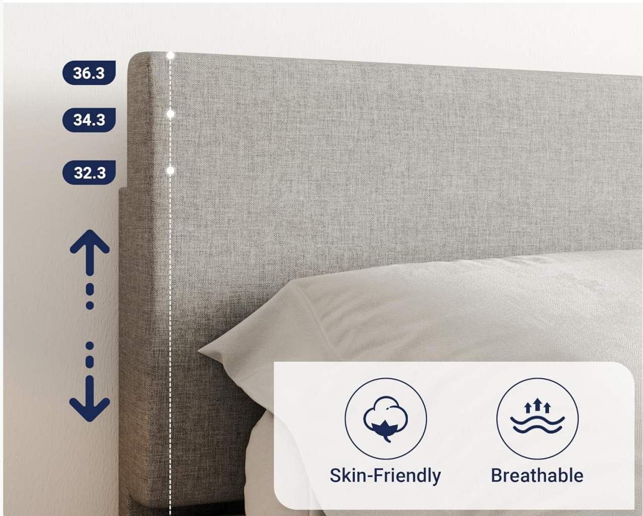
Image: Visual representation of the adjustable headboard heights.