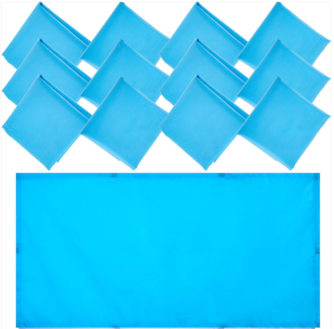
Image: A set of twelve blue fluorescent light covers, with one cover unfolded to show its full size.