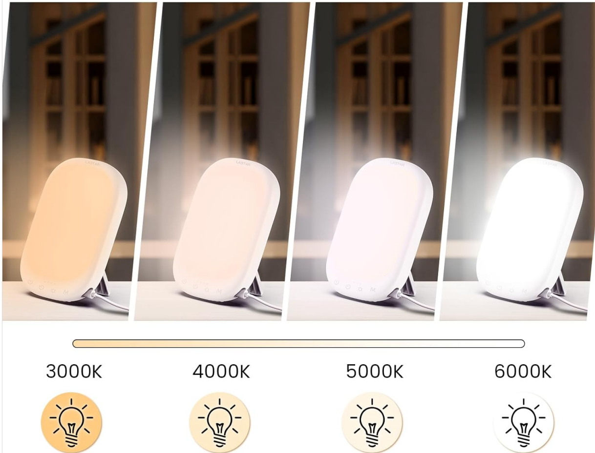
Image: This diagram displays the four distinct color temperature options of the LASTAR Sun Lamp, ranging from a warm 3000K to a cool 6000K.