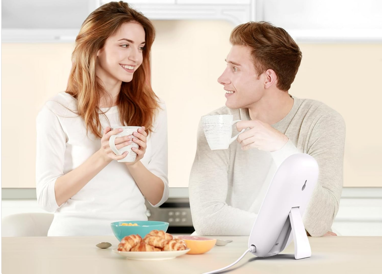
Image: An overview of the LASTAR Sun Lamp's main features, including its 4 color temperature settings, full spectrum light, UV-free LED technology, 10,000 Lux output, and integrated timer and memory functions.