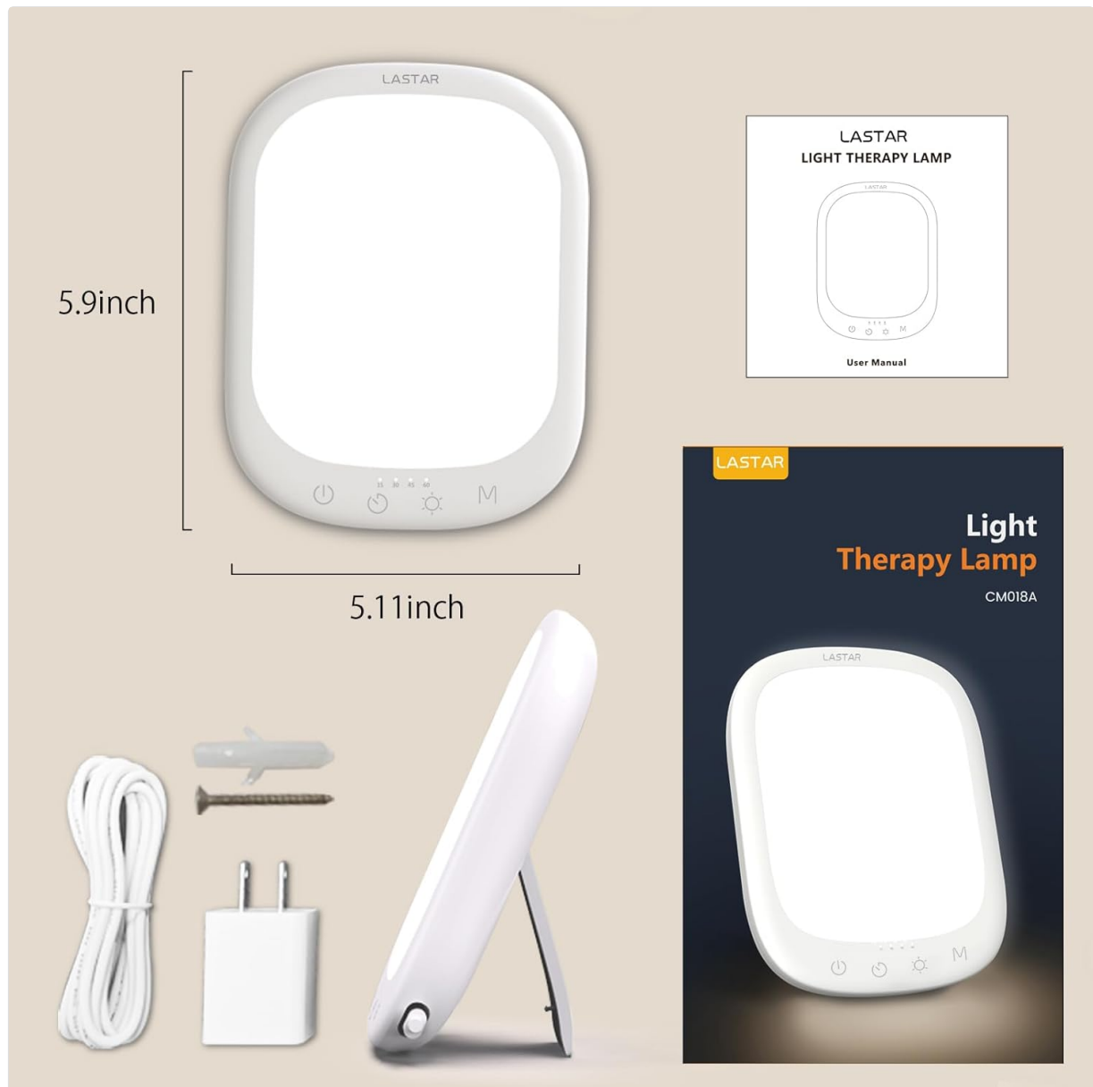
Image: The package contents of the LASTAR Sun Lamp, showing the lamp, power adapter, USB-C cable, wall mounting screws and anchors, and the user manual.