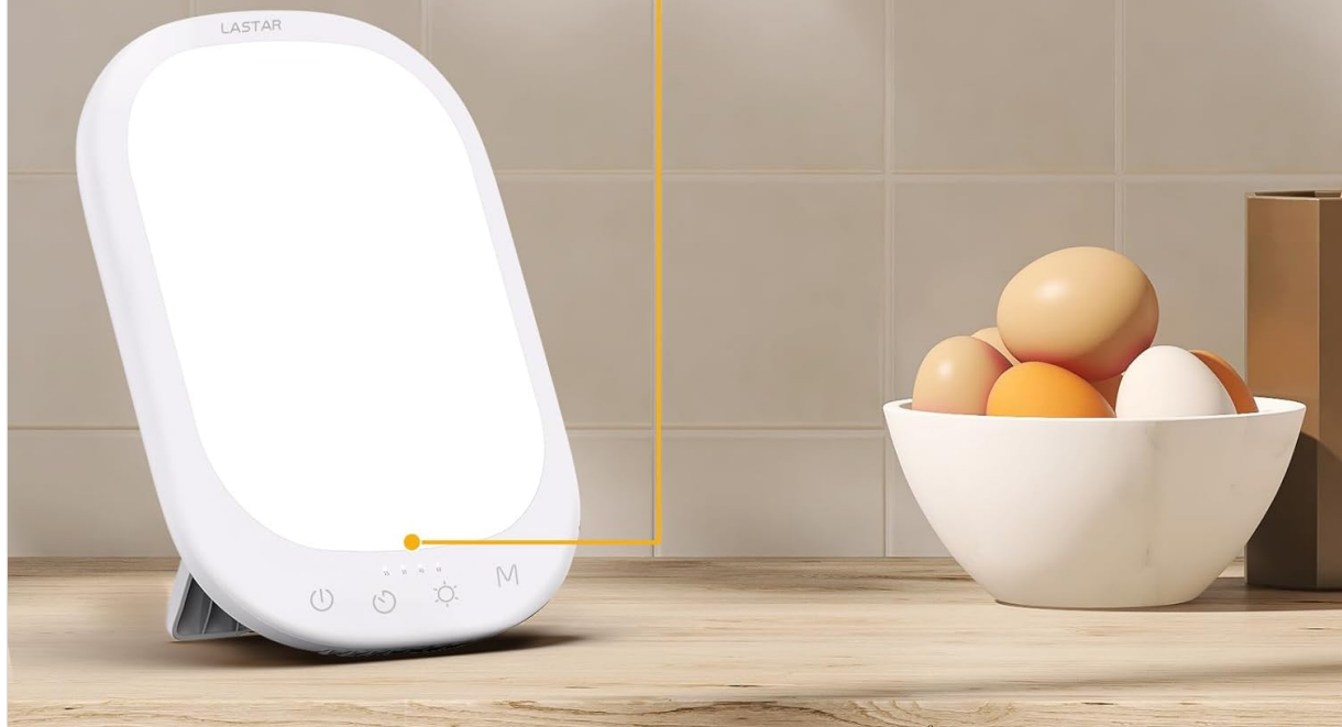
Image: The LASTAR Sun Lamp's timer function is shown, highlighting the selectable durations of 15, 30, 45, and 60 minutes for automated operation.