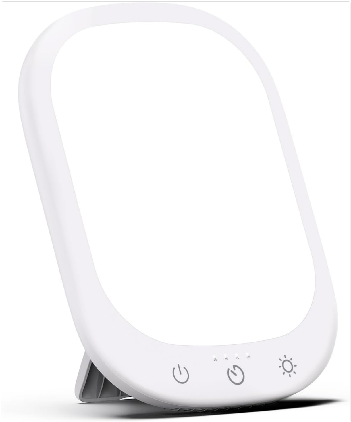
Image: Front view of the LASTAR Sun Lamp, showcasing its minimalist design and touch-sensitive control panel at the base.